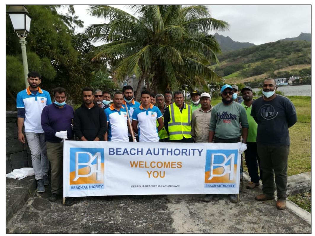
Group photo (Beach Authority, Tourism Authority and District Council of Grand Port)