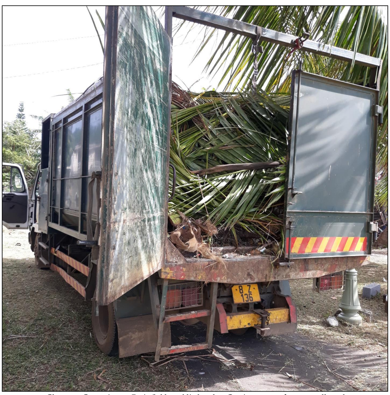
Clean-up Campaign at Petit Sable public beach – Carting away of wastes collected