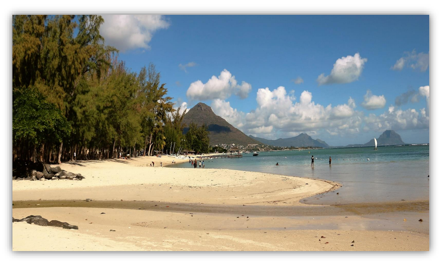
Wolmar public beach

An action plan for period March 2017 to March 2018 is annexed.