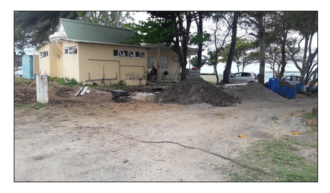
6.2 Provision of 2000 litres water tank on new metal support and 9000 litres water tank placed on newly constructed concrete platform.