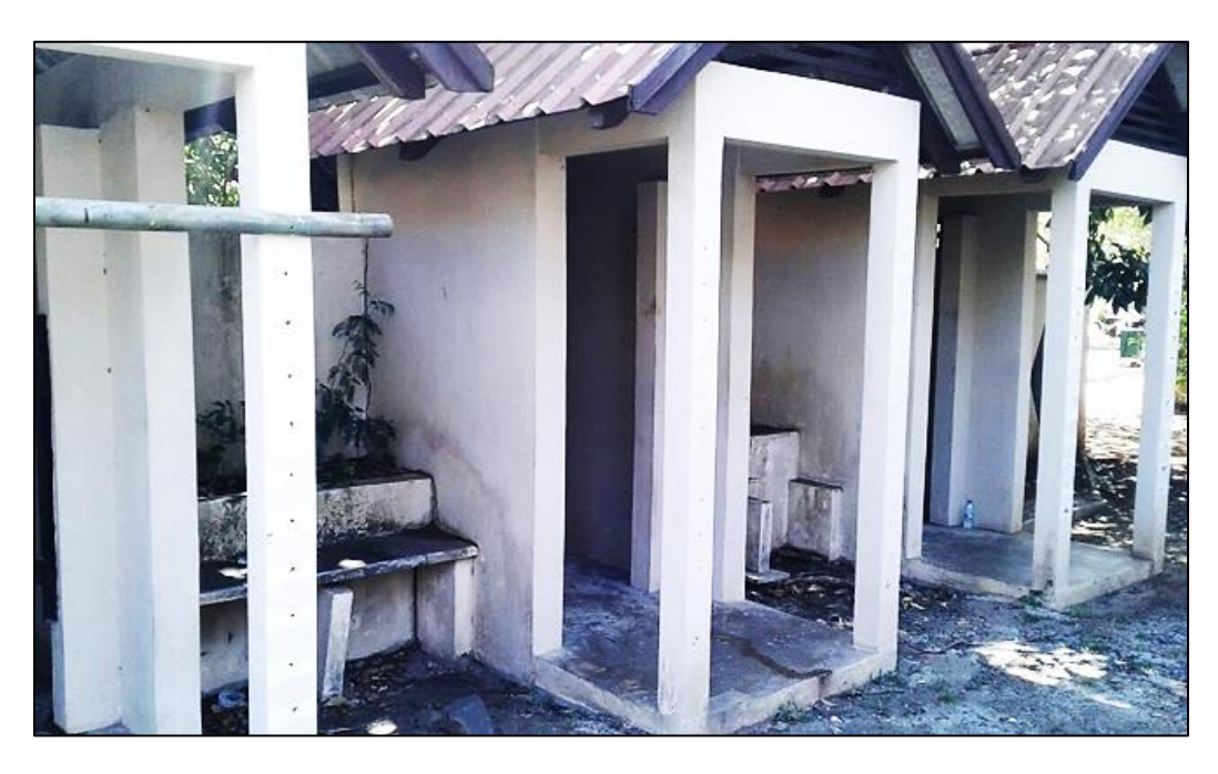
Building in poor state