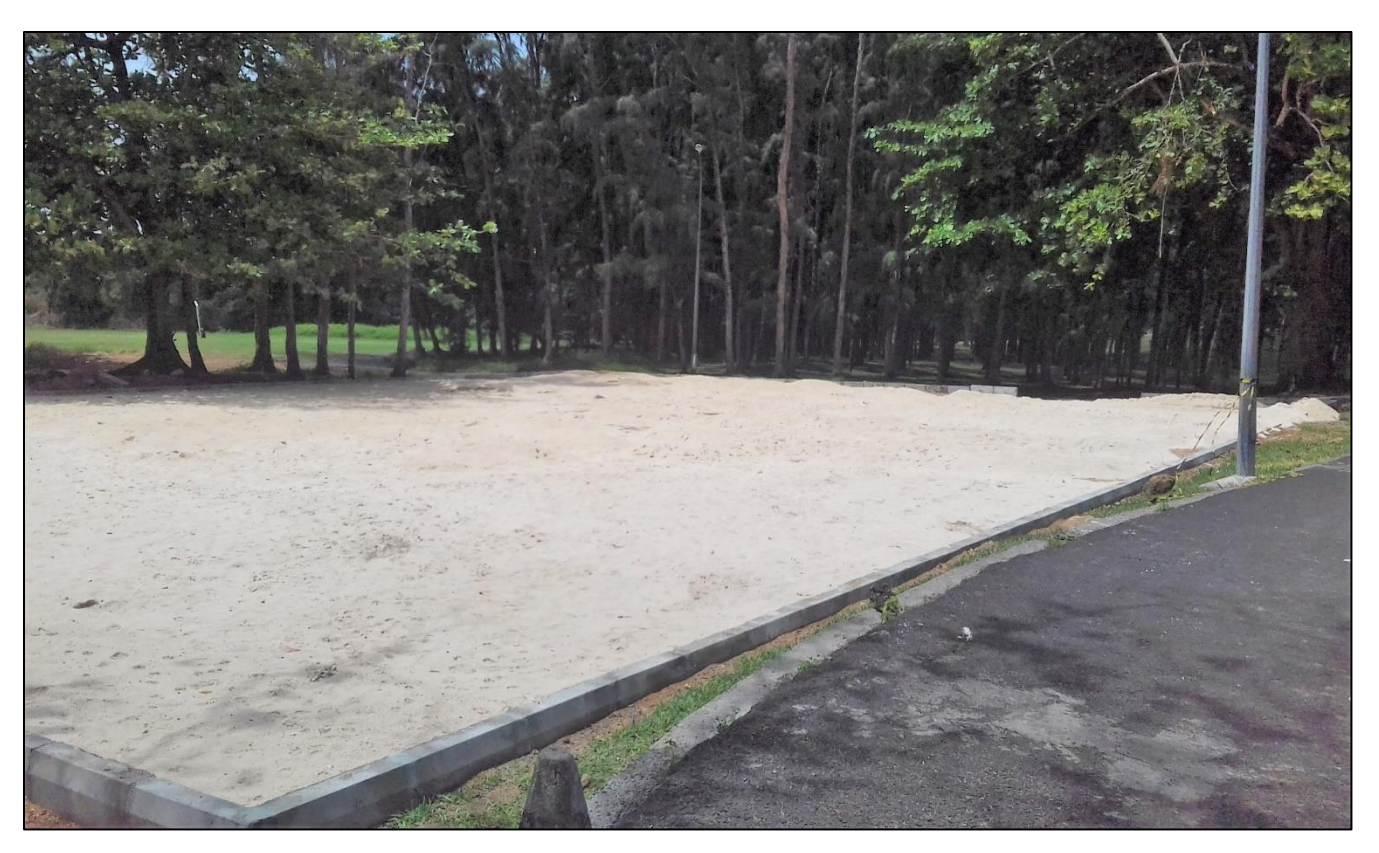
Construction of Beach Soccer Pitch