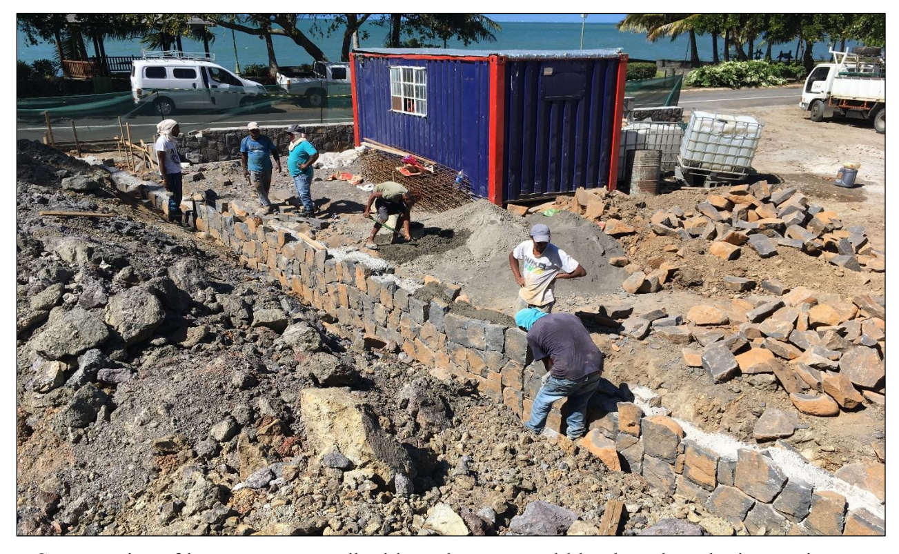
Construction of low masonry wall with undecomposed blue basalt rocks is ongoing