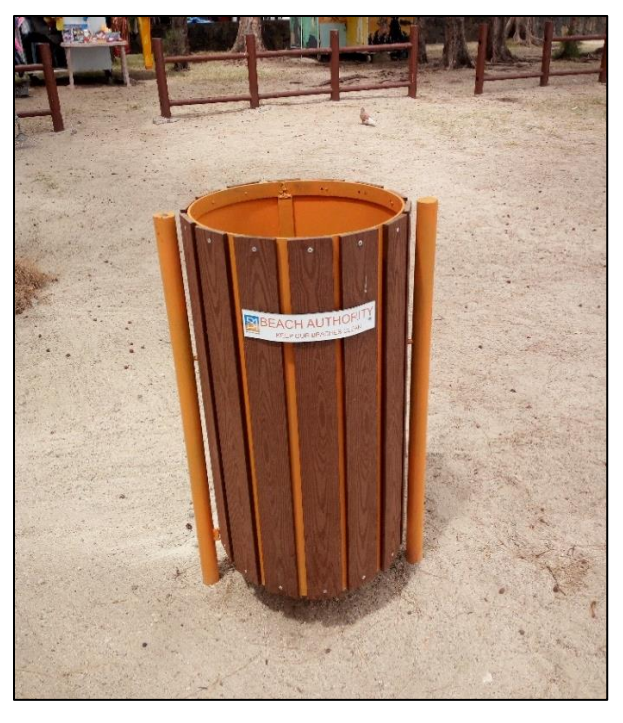
Provision of bin at Flic en Flac public beach