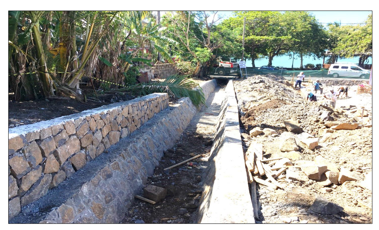
Coping on drainage system is ongoing