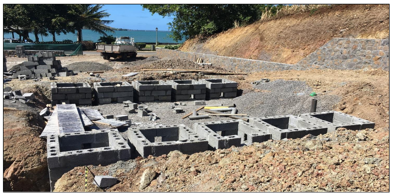
Excavation to receive components of leaching field is completed and construction of leaching field structure is ongoing