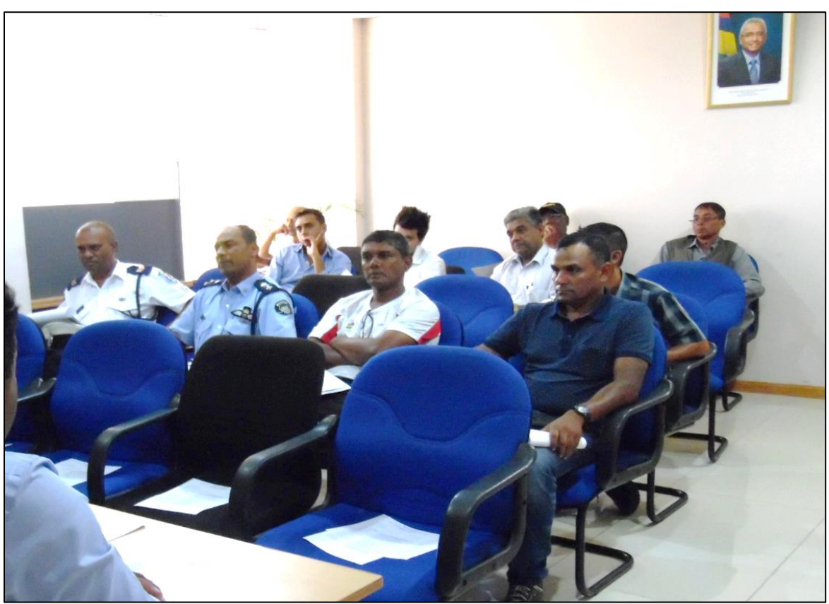
Meeting held with all stakeholders at the seat of the Authority in the context of Ganga Snan