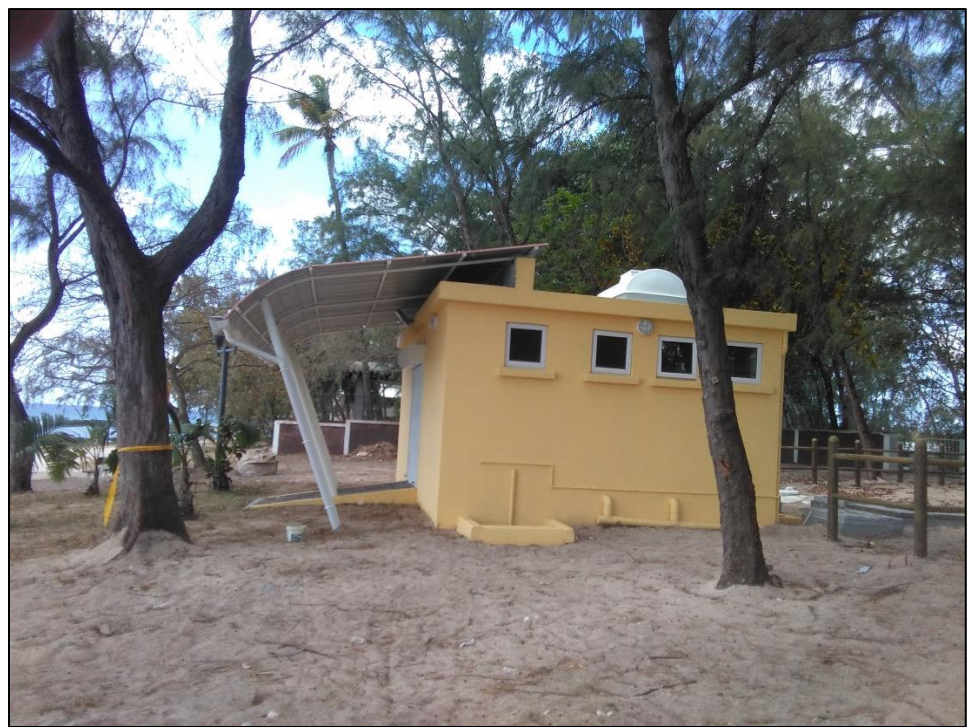
Painting of toilet blocks and fixation of Corrugated Iron Sheet (CIS) roof completed