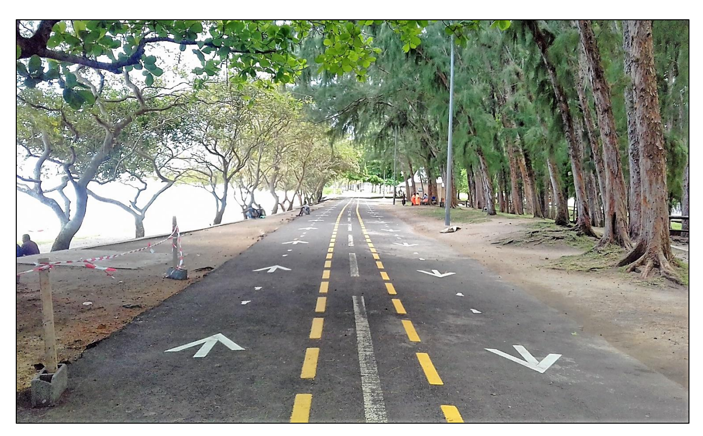
Marking of Jogging Track