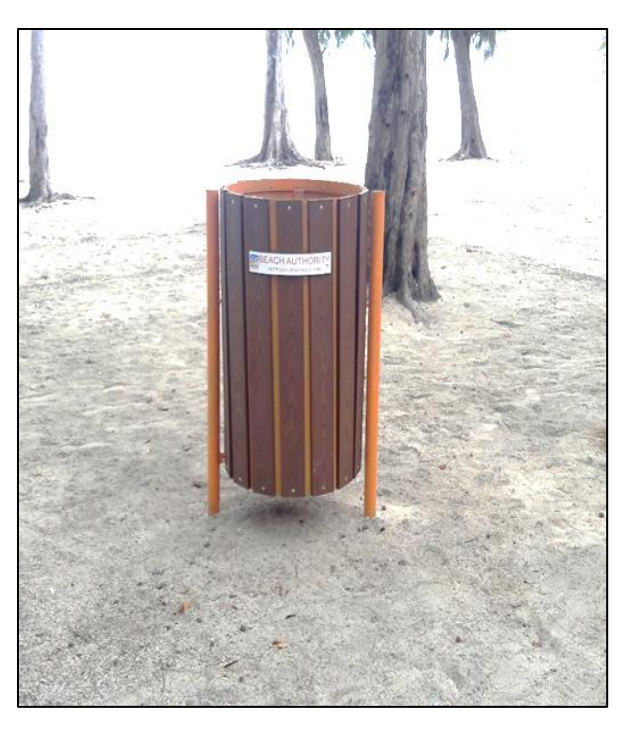
Provision of bin at Wolmar public beach