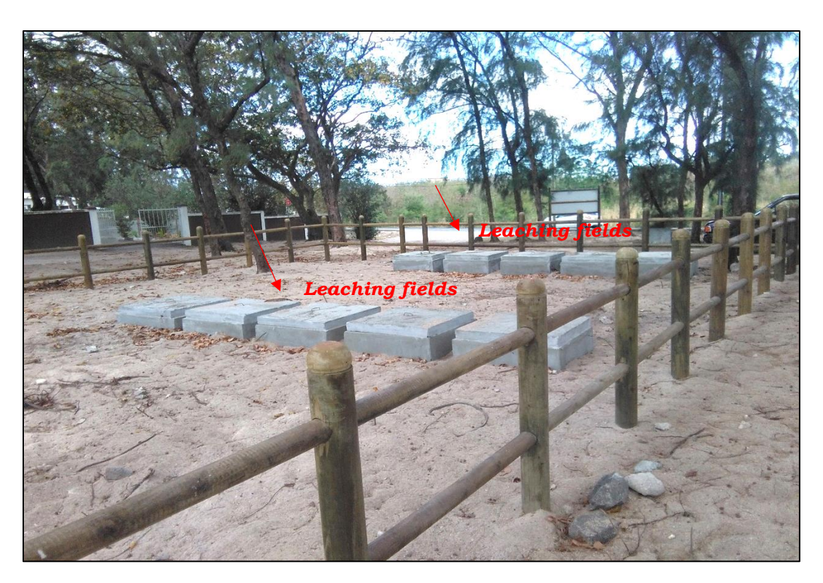
Enclosure of leaching fields with pine poles