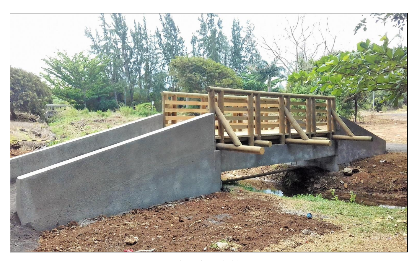
Construction of Footbridge