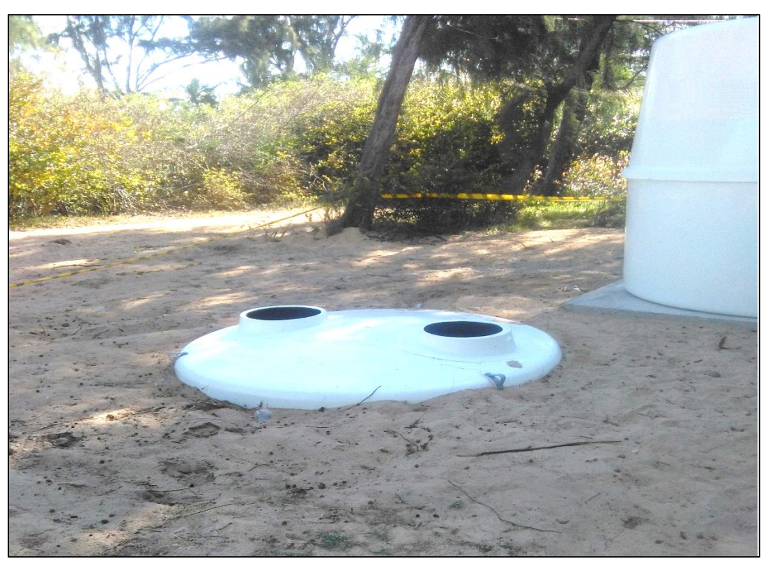
{\it Installation of septic tank at Melville public beach}