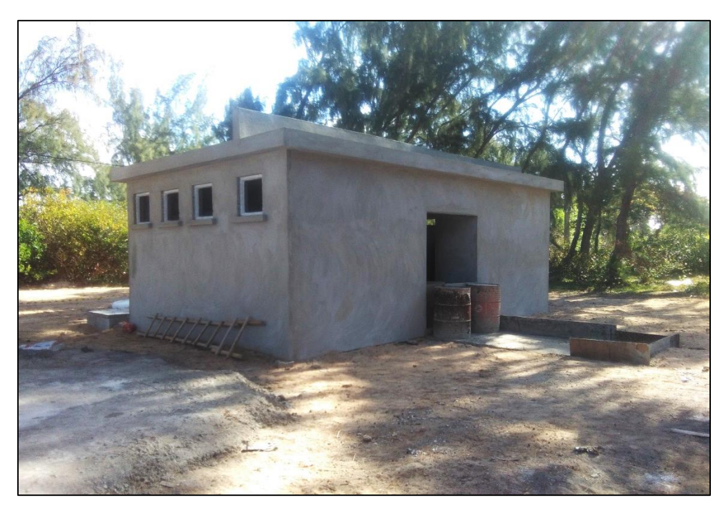
Internal and external plastering works completed

Construction of new toilet blocks at Melville public beach is ongoing and same is expected to be completed by November 2017 .