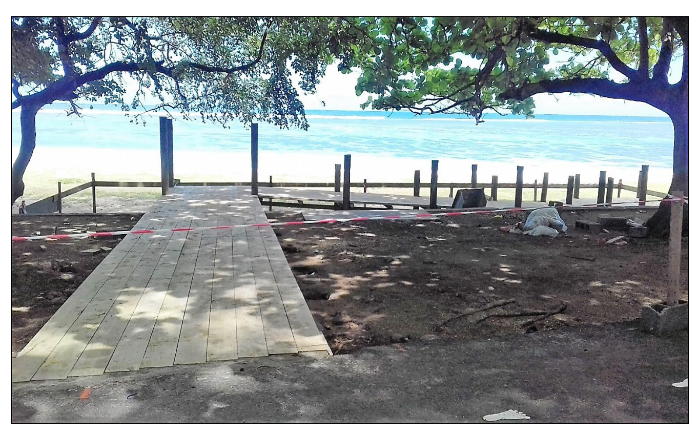
Ramp to facilitate disabled persons to have access to the beach