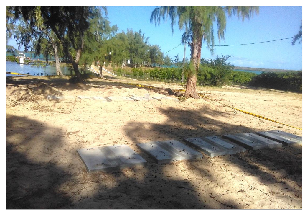
Construction of manhole covers