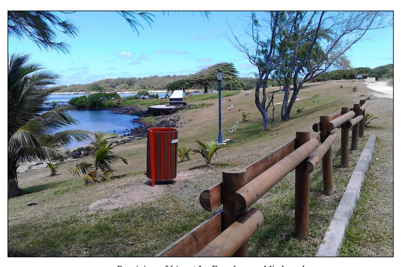
Provision of bin at Le Bouchon public beach