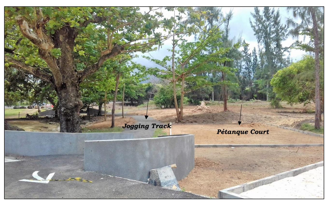
Construction of Pétanque Court and Jogging Track