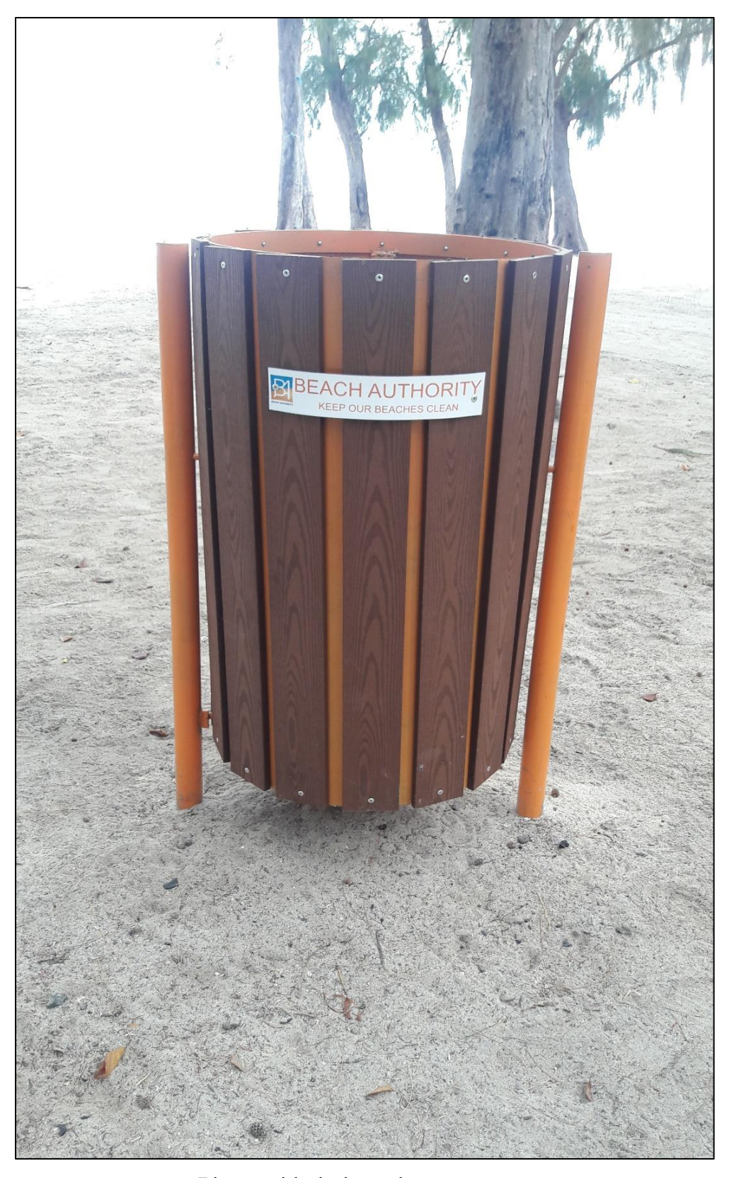
Bin provided along the western coast