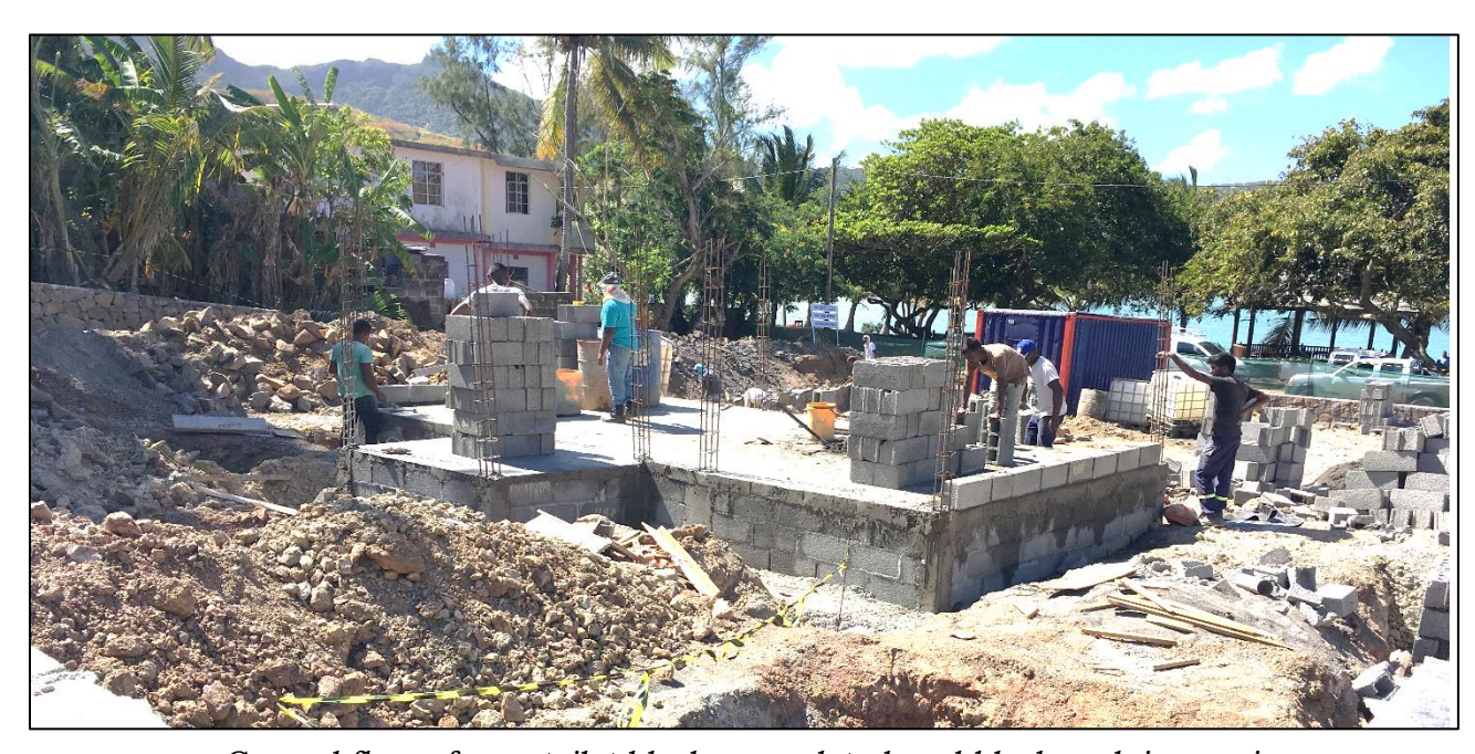
Ground floor of new toilet blocks completed and blockwork is ongoing

New toilet blocks, parking space, retaining wall, low masonry wall as well as a drainage system to evacuate rainwater are being constructed at Petit Sable public beach. The project is expected to be completed by mid November 2017 .