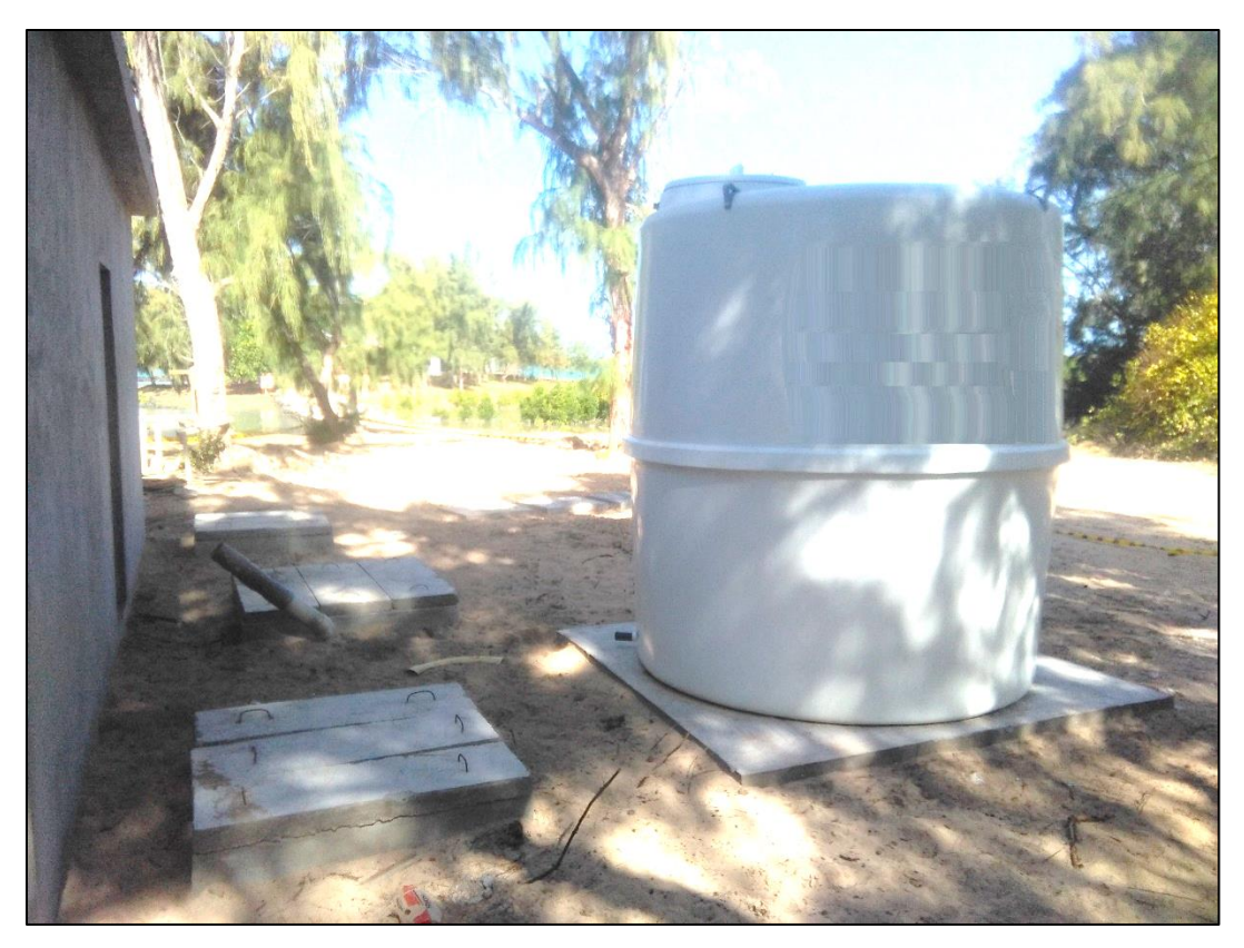
Installation of 9000 litres water tank at Melville public beach