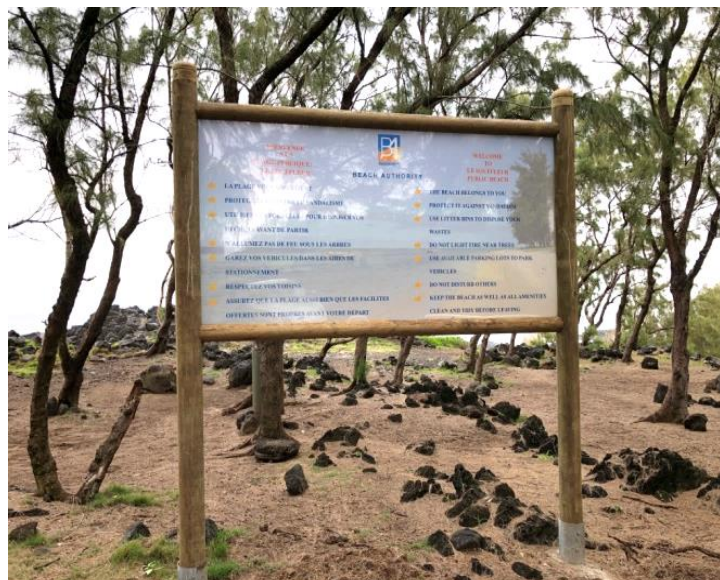
Le Souffleur public beach