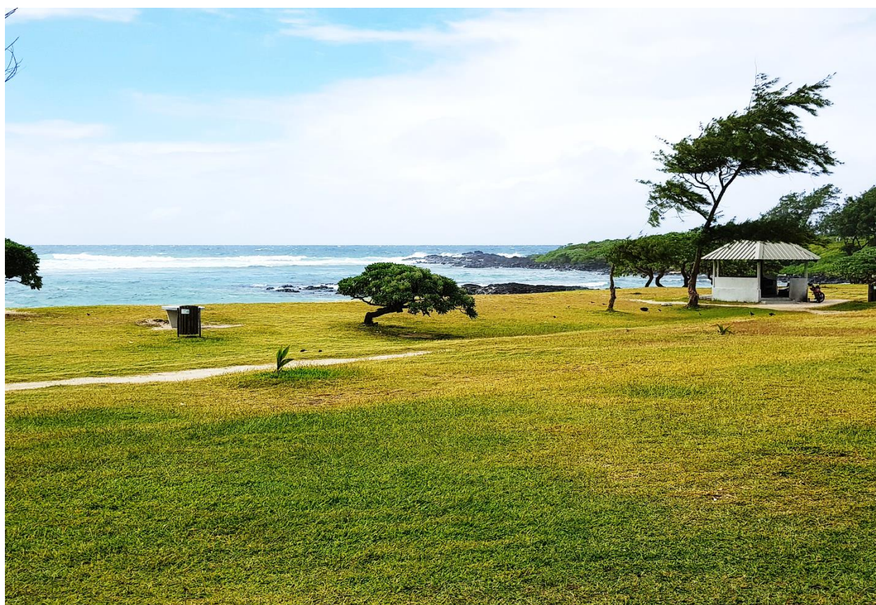
La Cambuse public beach