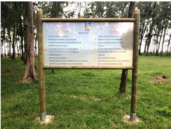
Pomponette public beach