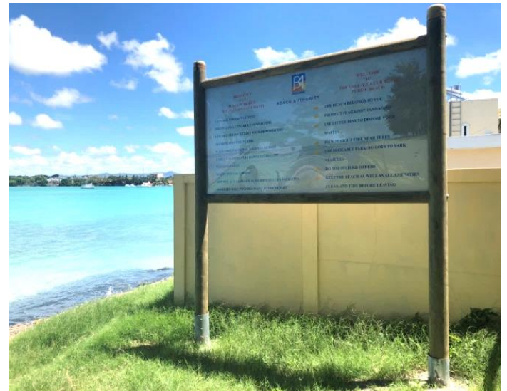
The Vale public beach (ex-club Road)