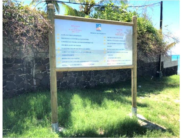
The Vale public beach