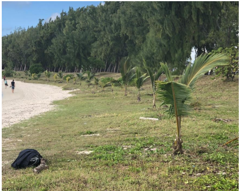
Works in Progress