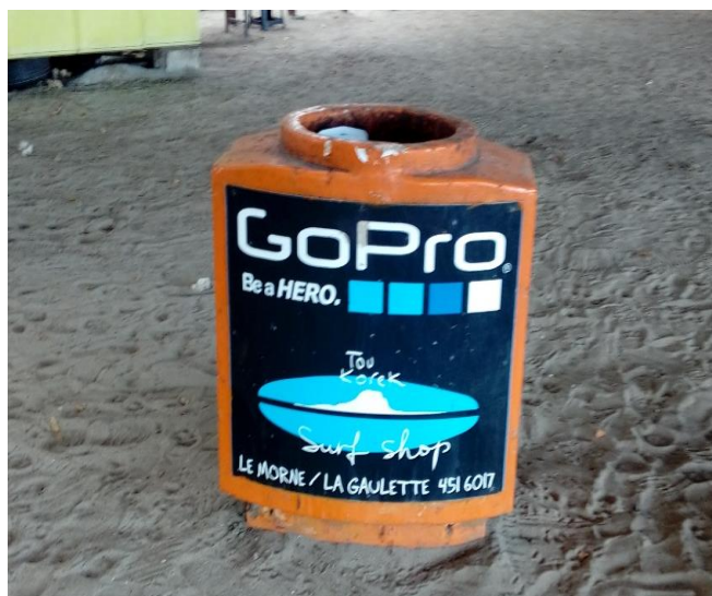
Damaged concrete bin