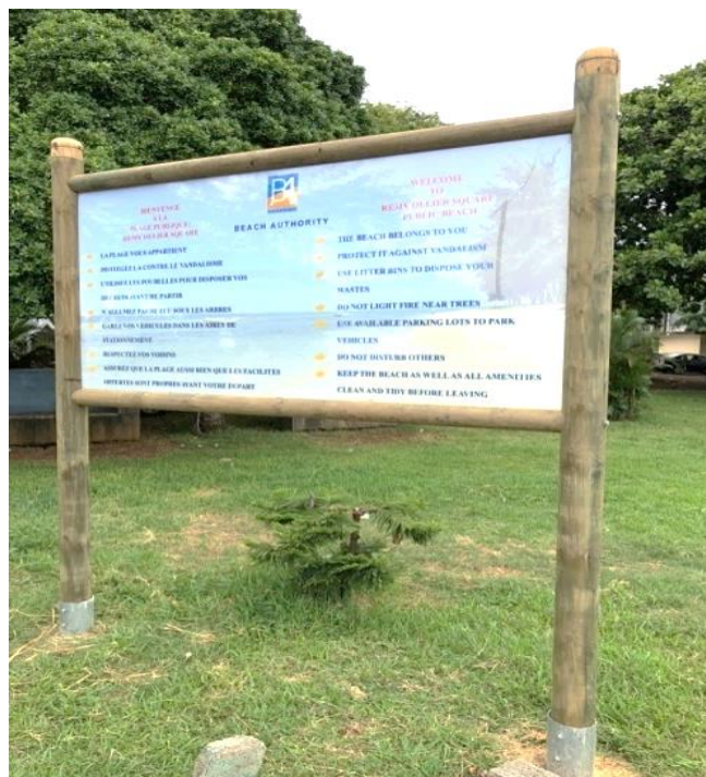
Remy Ollier Square