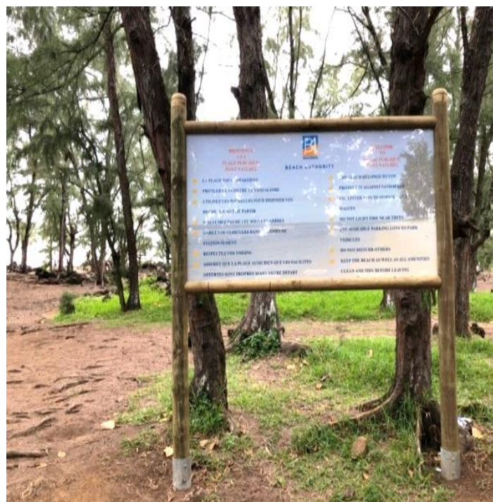
Pont Naturel public beach