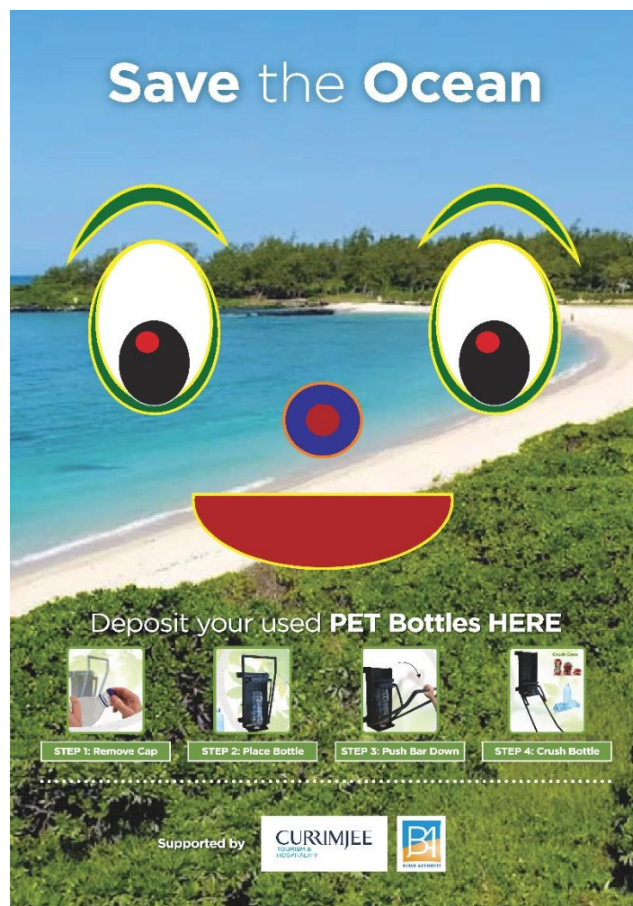
Proposed Eco Bin layout by Currimjee Foundation