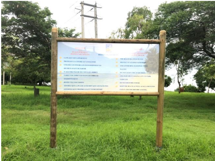
Petite Case Noyale public beach

The purpose of Informative Panels is to sensitise the beach users on measures that should be taken for a clean and green environment as well as for their safety and security. The installation of Informative Panels has been completed on several public beaches.