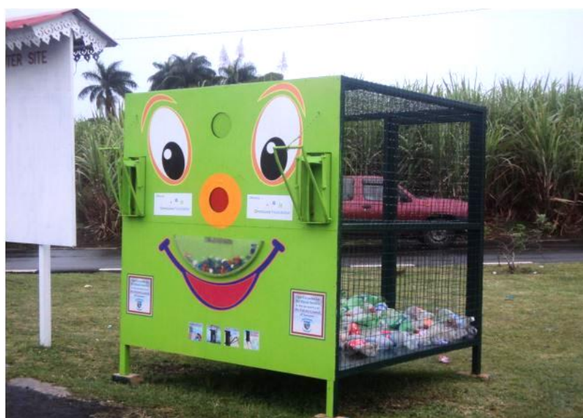
Proposed Eco Bin by Rotaract Club of Rivère du Rempart