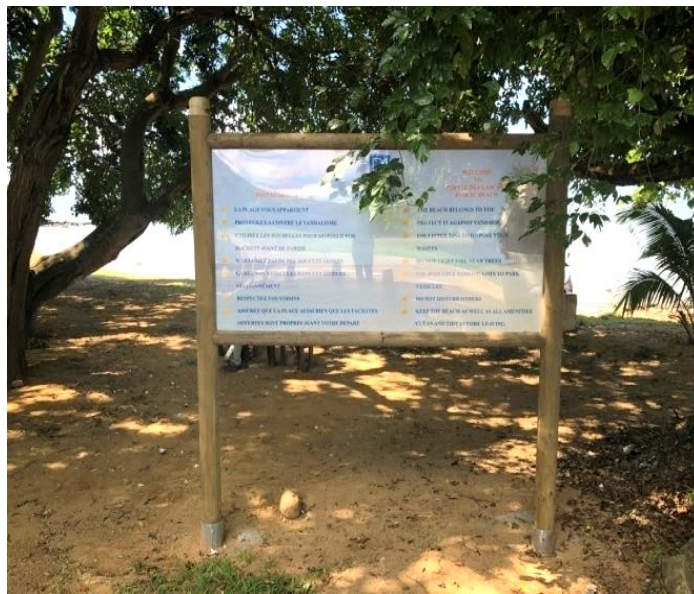
Pointe des Lascar public beach