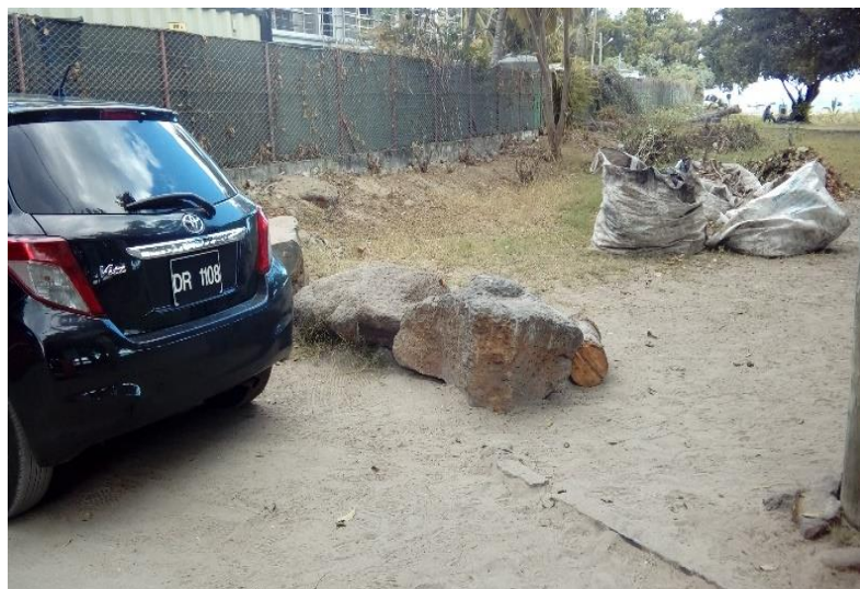
Location where pine poles need to be installed to prevent vehicle access