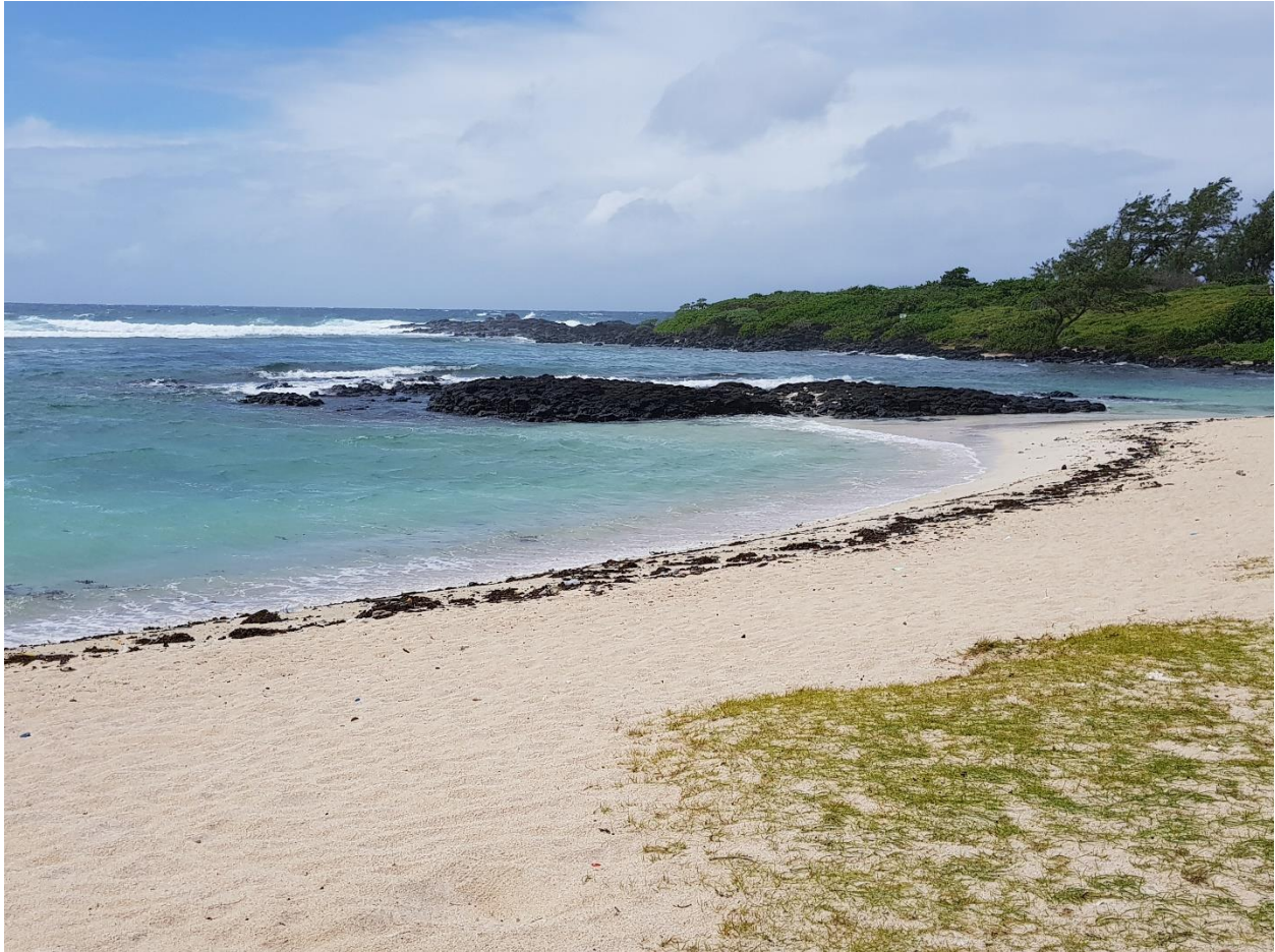
La Cambuse public beach

The Authority envisages to carry out more activities and complete several ongoing projects regarding the conservation and protection of the environment of public beaches. It will also lay more emphasis on the regulation of activities on public beaches to enhance further the security and safety of beach users.