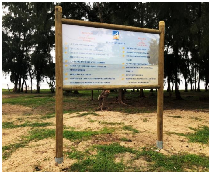
Riambel public beach