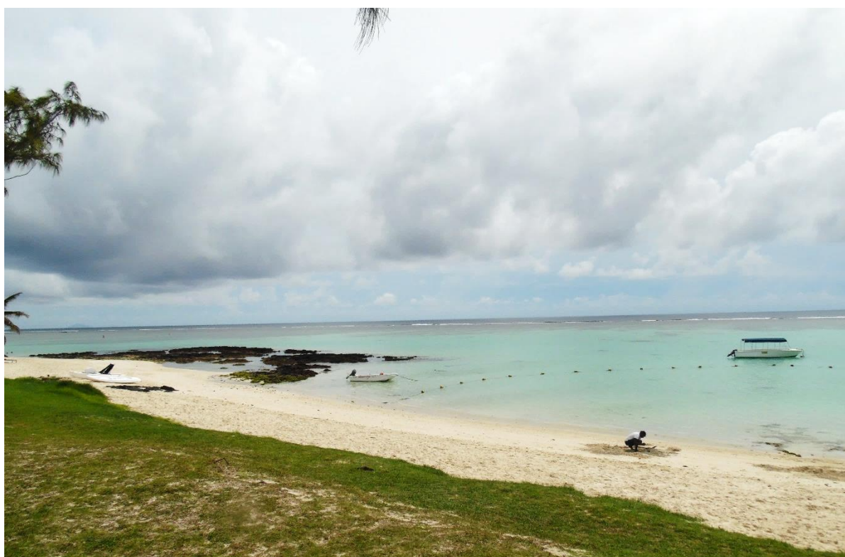
Palmar (Nr Ambre Hotel) public beach