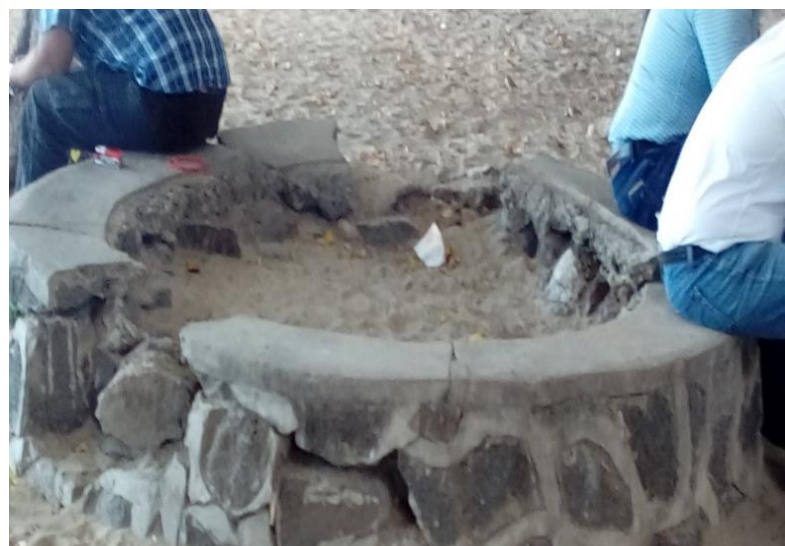
Damaged concrete stone bench