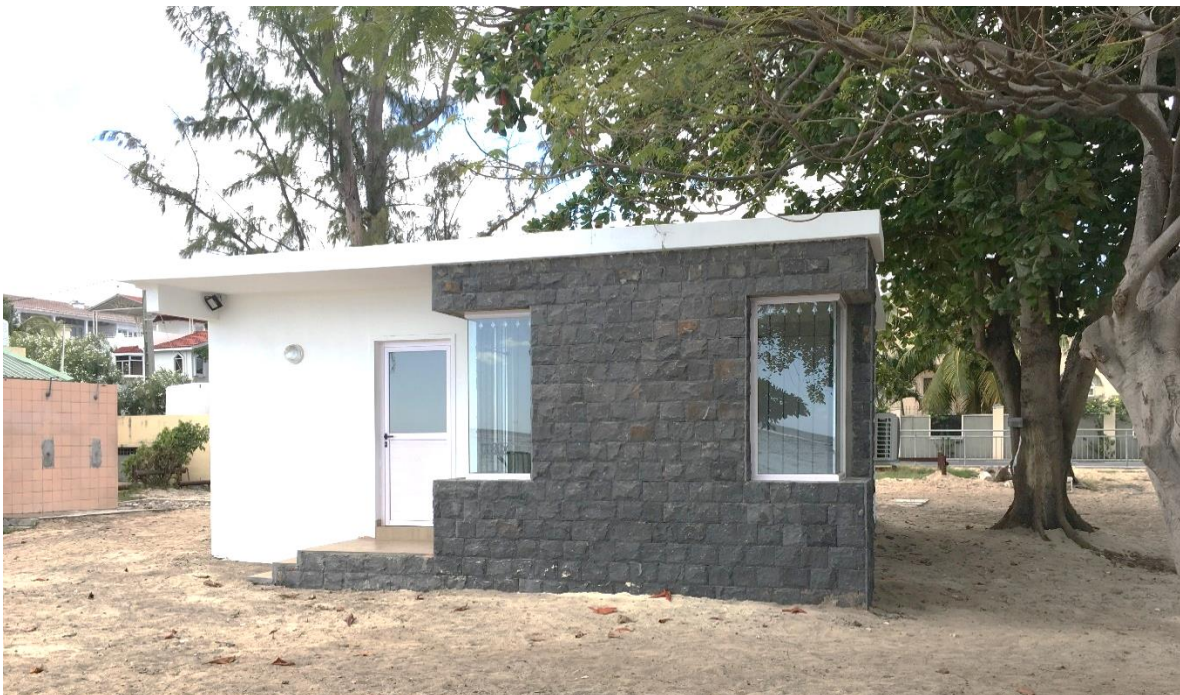
Flic en Flac sub office

The third one in the West at Flic en Flac public beach has been completed and will be operational shortly.