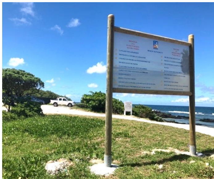
Roche Noire public beach