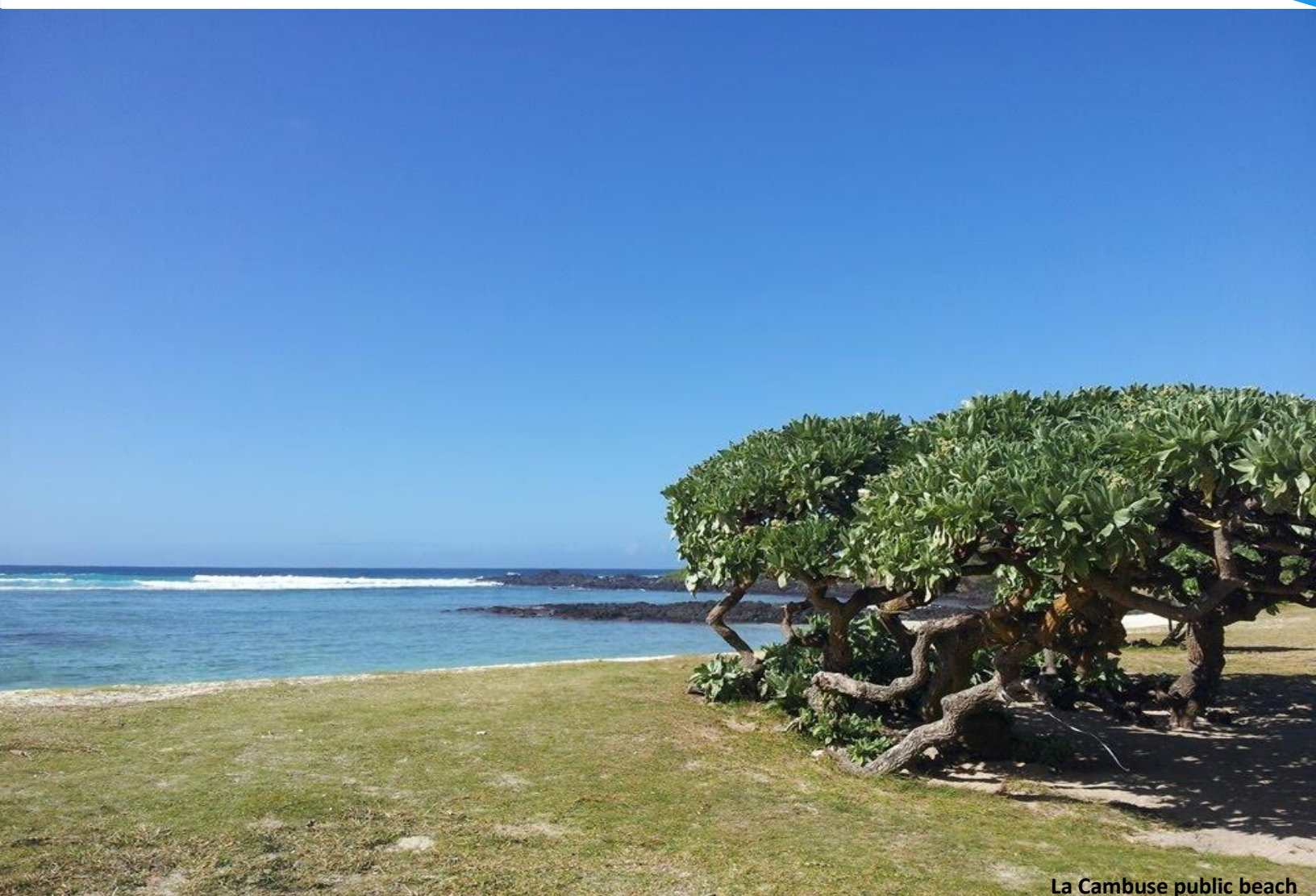
La Cambuse public beach