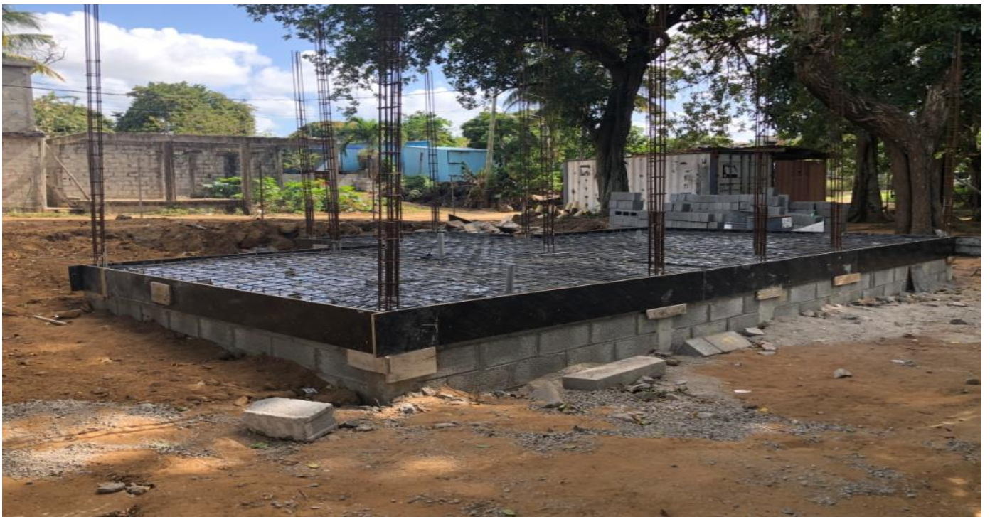
Construction in progress - Floor casting completed