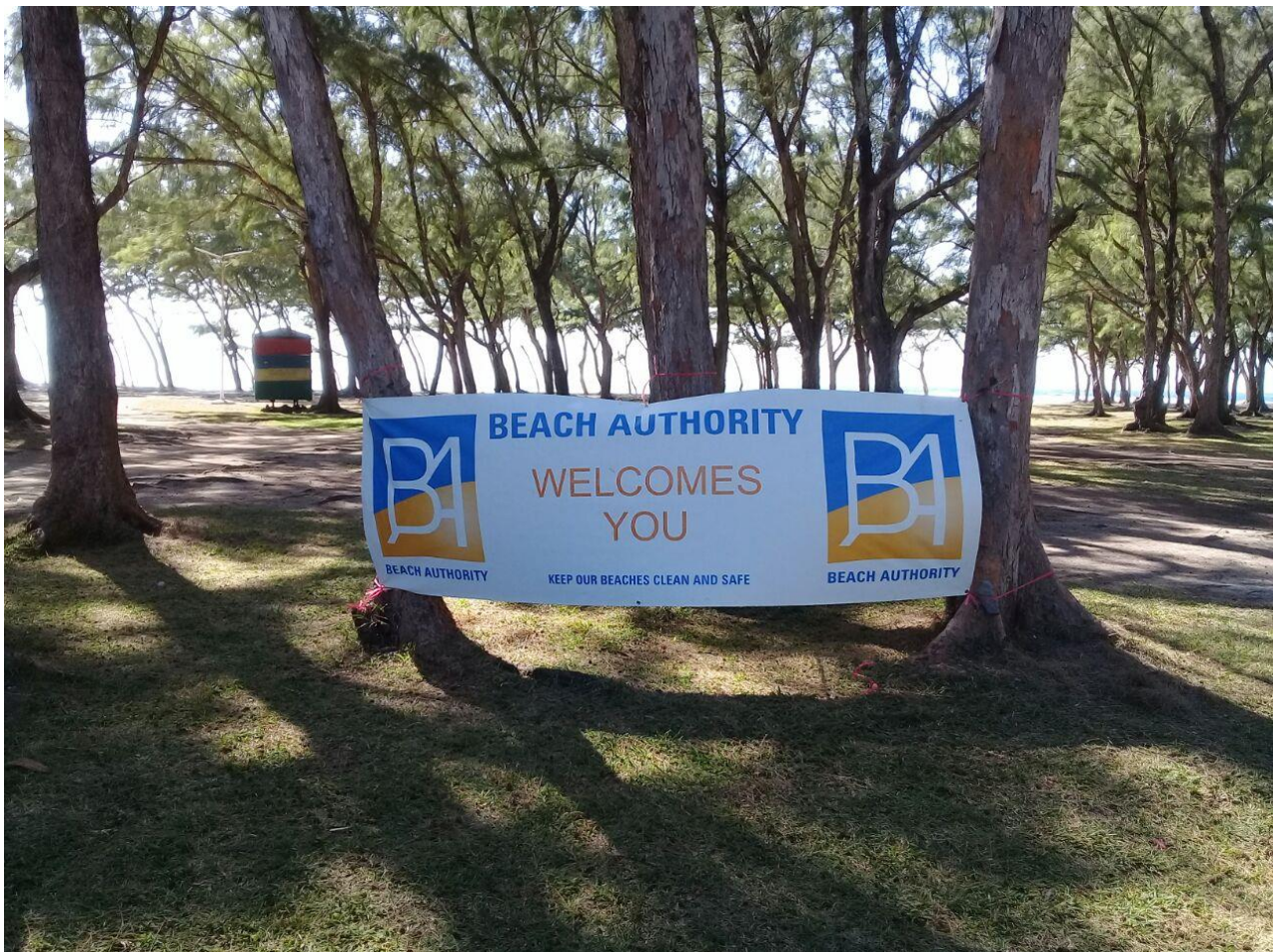
Palmar public beach