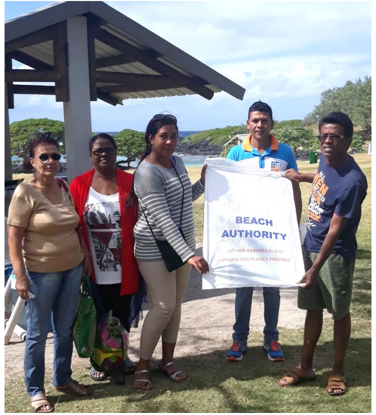
Distribution of plastic bin bags and flyers at La Cambuse public beach