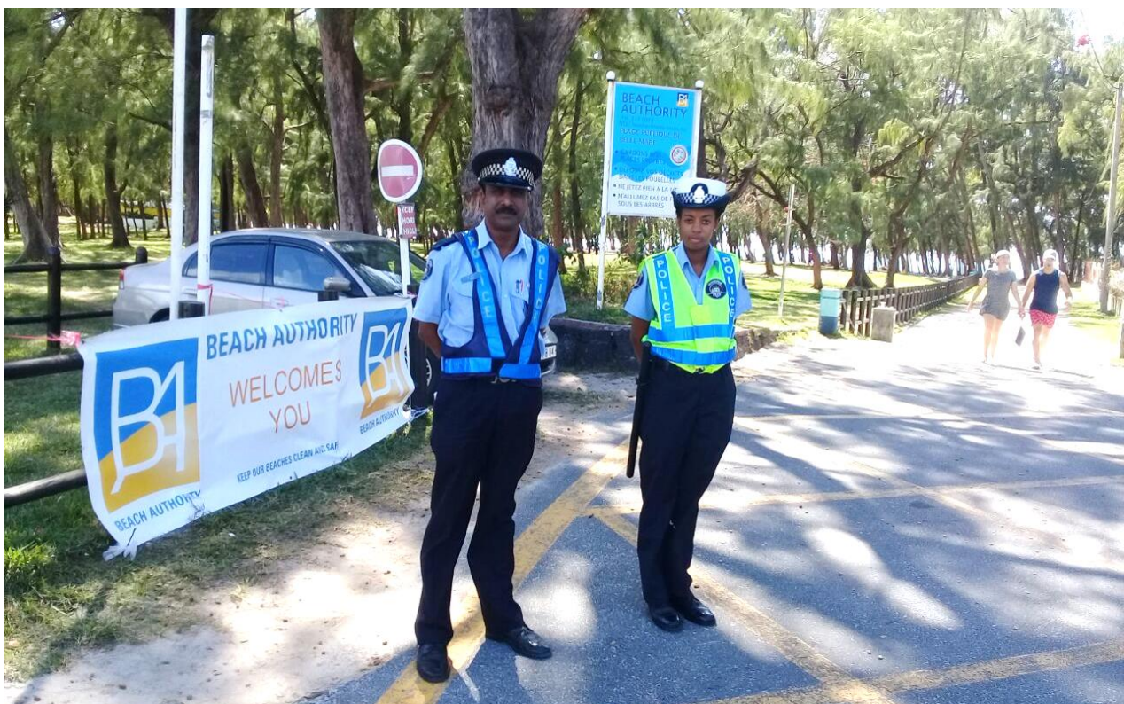
Officers of Mauritius Police Force ensuring security of beach users