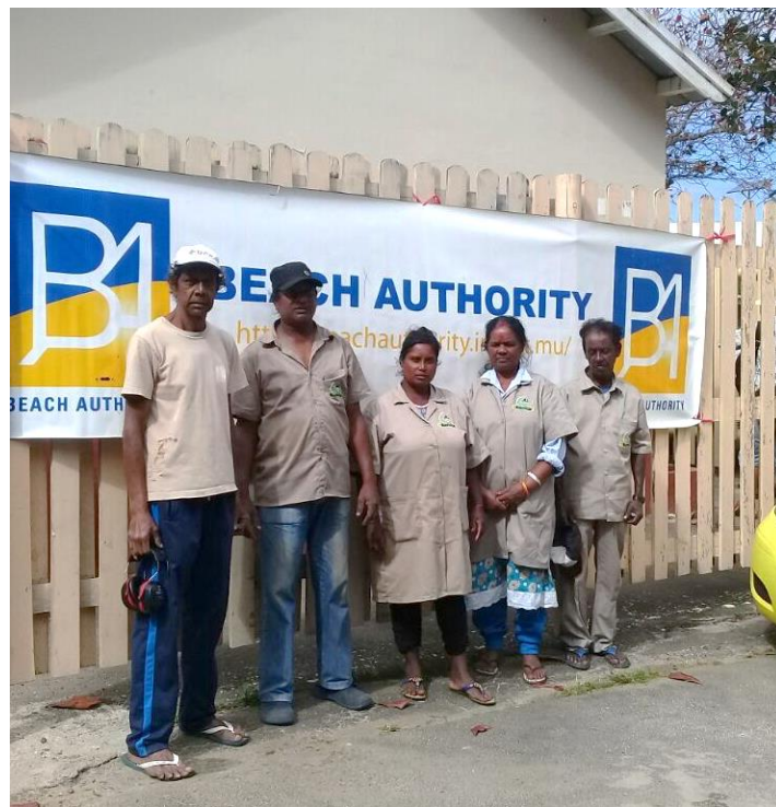
Attendants ensuring the proper cleaning of the Toilet Blocks