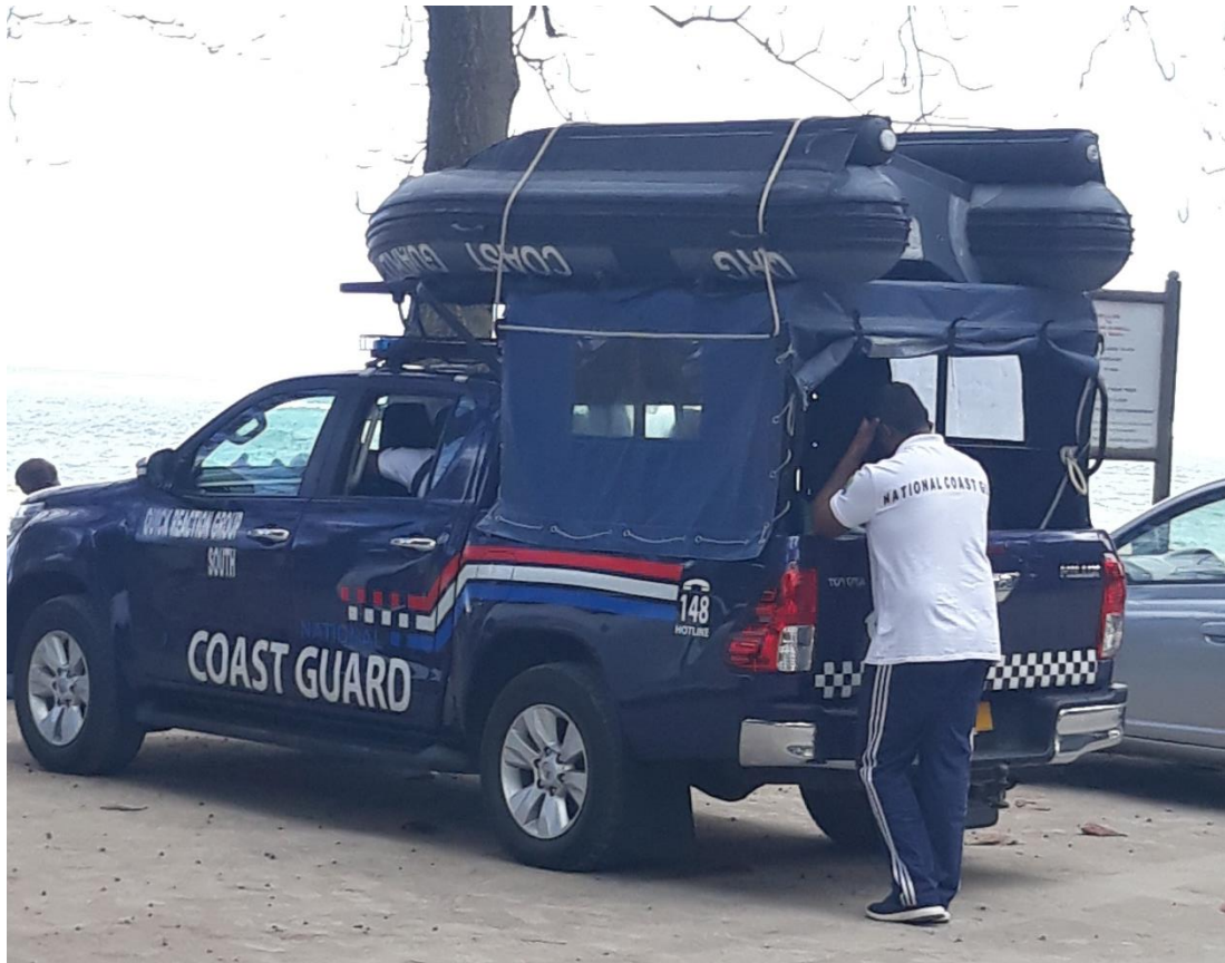
National Coast Guard's vehicle and rescue boat (standby) at Riambel public beach