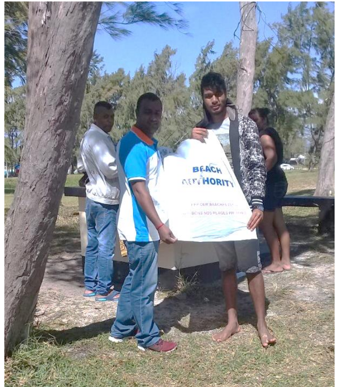
Distribution of plastic bin bags and flyers at Belle Mare public beach