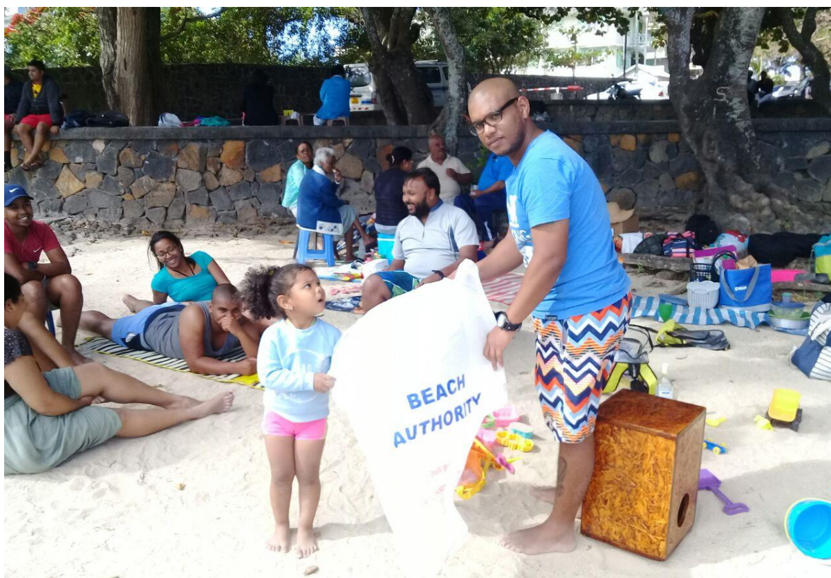
Distribution of plastic bin bags and flyers at Blue Bay public beach