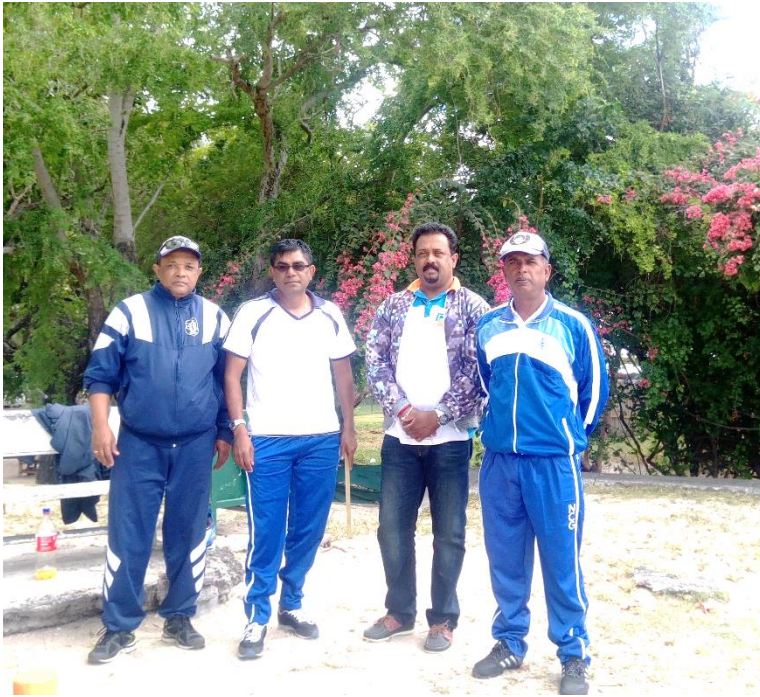
Representatives of the National Coast Guard ensuring security of beach users