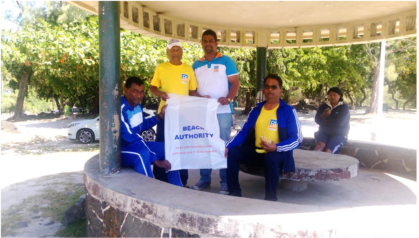
Representatives of Lifesaving Society