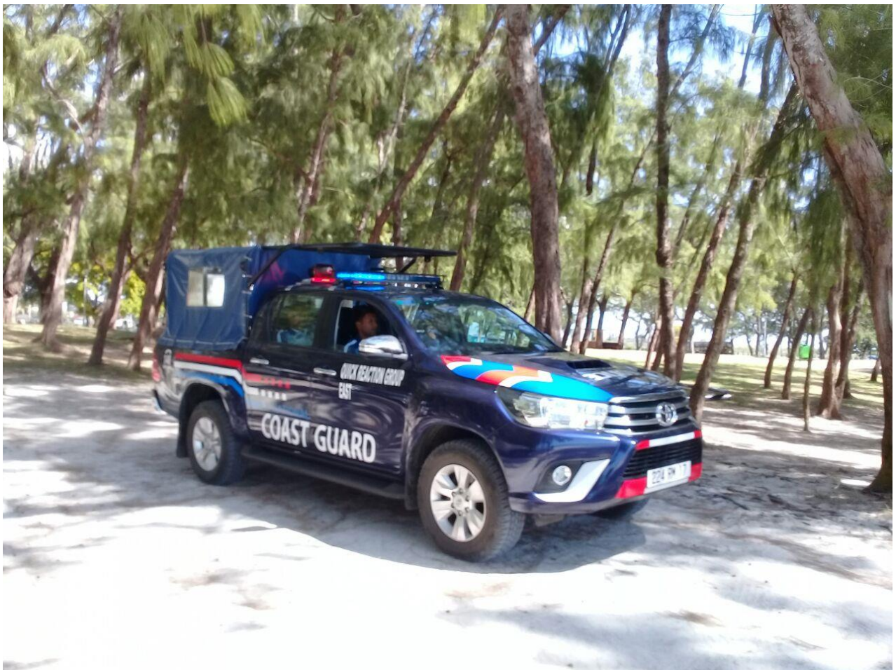
National Coast Guard's vehicle (standby) at Palmar public beach