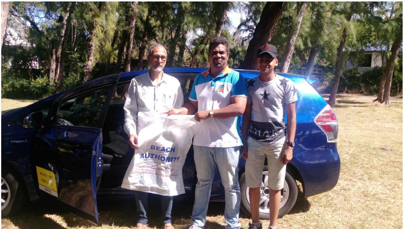
Distribution of plastic bin bags and flyers at Butte à l'Herbe public beach