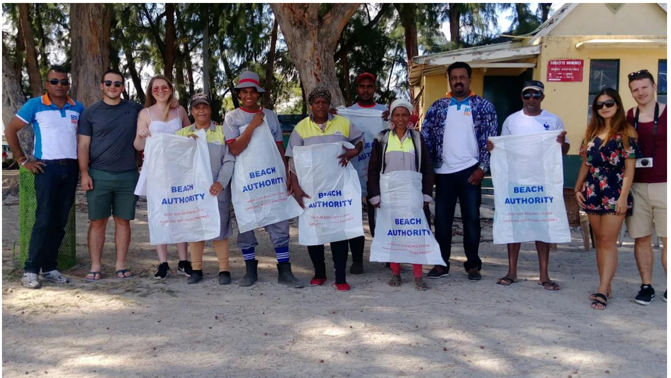
Distribution of plastic bin bags and flyers at Flic en Flac public beach