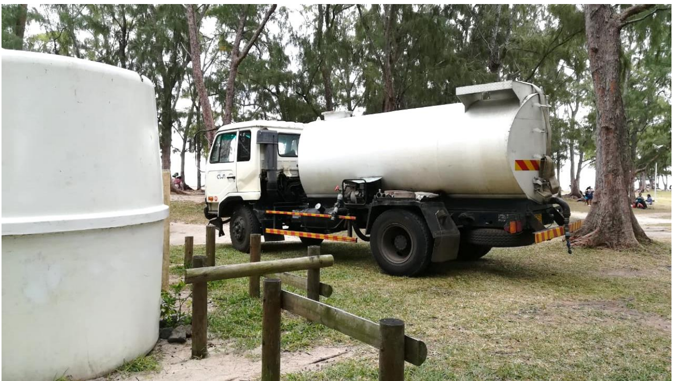
Provision of water tankers by Central Water Authority at P.G Le Morne public beach