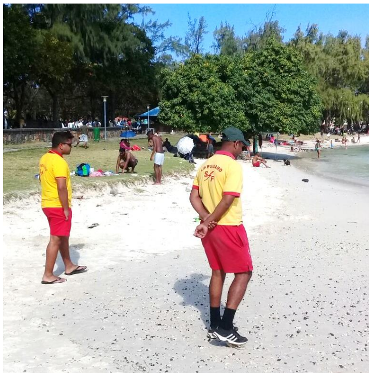
SMF Life Savers at Blue Bay public beach