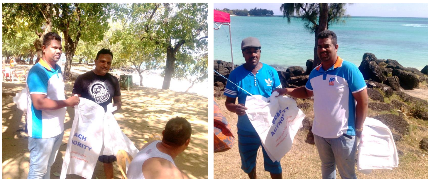
Distribution of plastic bin bags and flyers at La Cuvette public beach