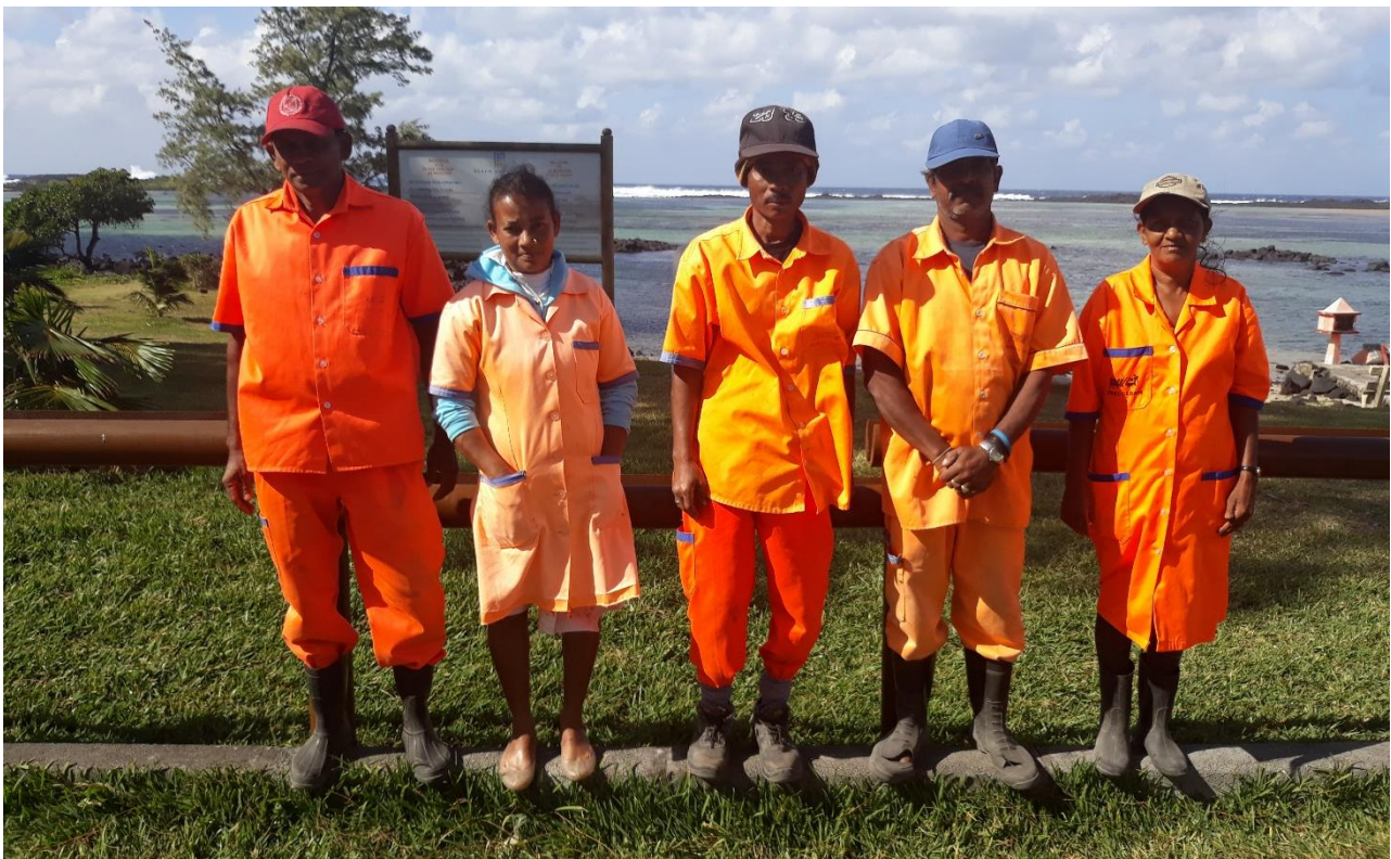
Personnel of Maxi Clean Co. Ltd. at Le Bouchon public beach