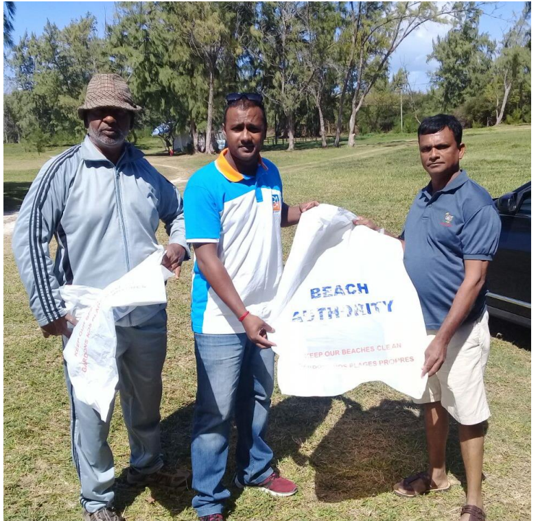
Distribution of plastic bin bags and flyers at Palmar public beach