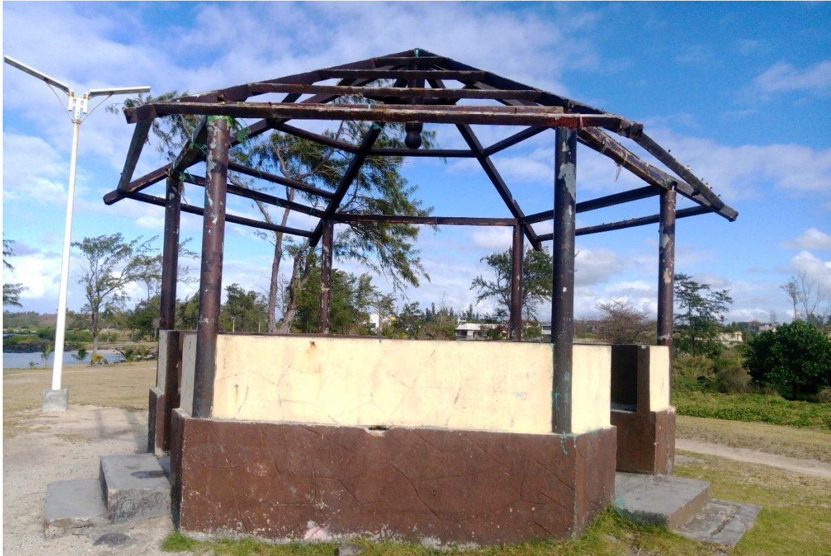
Works in progress