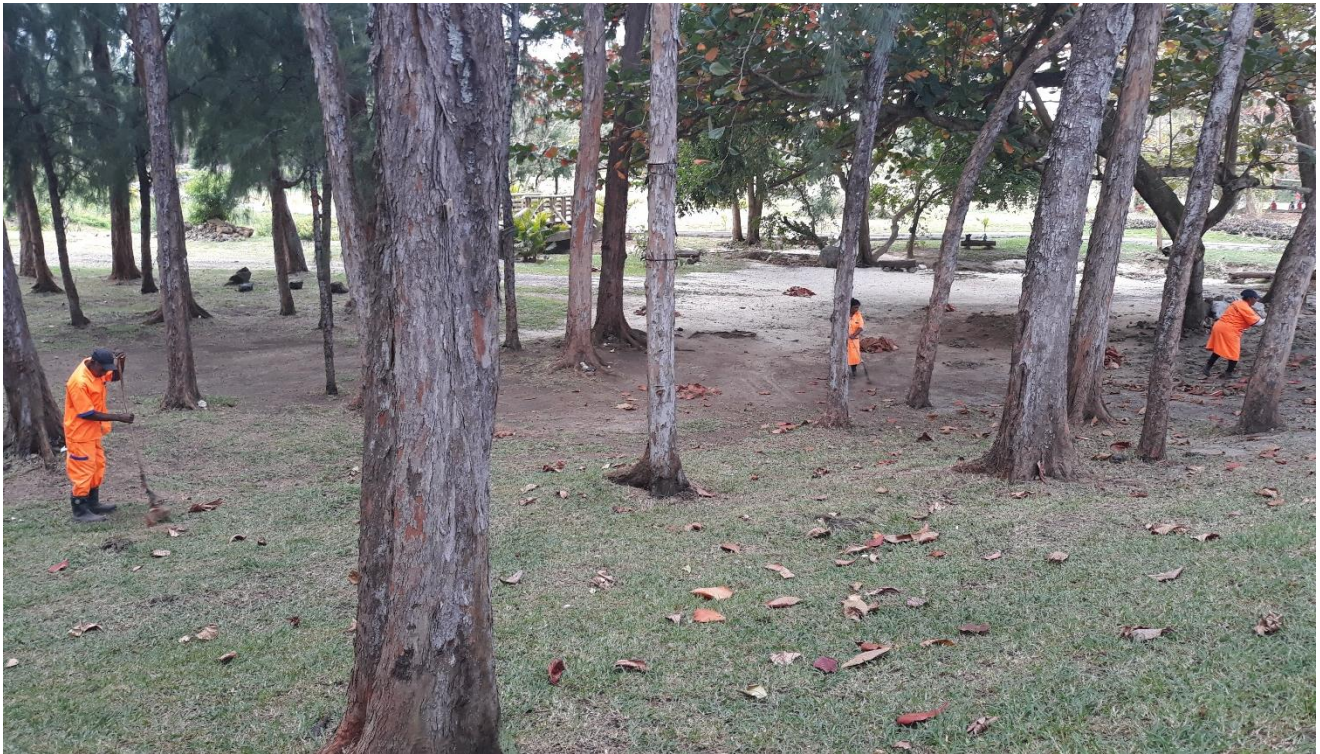
Employees of Maxi Clean Co Ltd ensuring the proper cleaning of St. Felix public beach