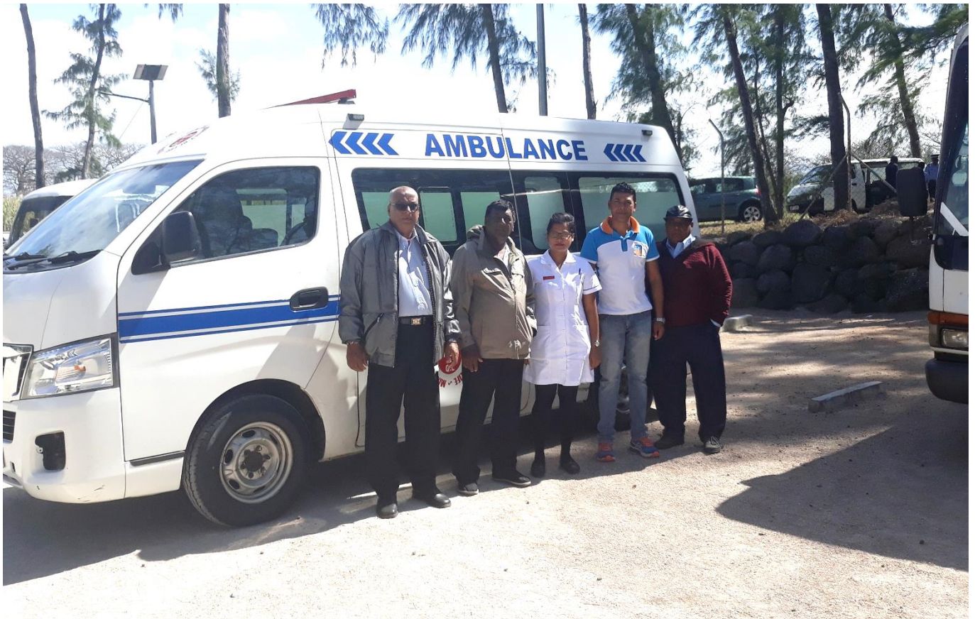
Representatives of Ministry of Health and Quality of Life – Provision of ambulance