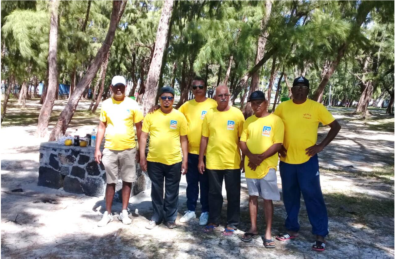
Life savers of Flacq Swimming Association