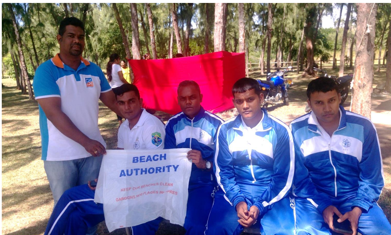
Distribution of plastic bin bags and flyers at Grand Gaube public beach