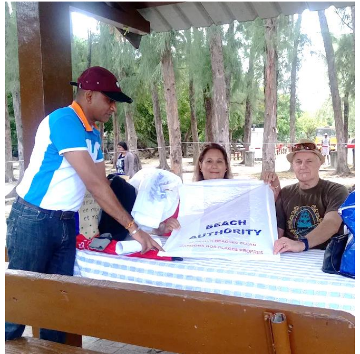
Distribution of plastic bin bags and flyers at Flic en Flac public beach