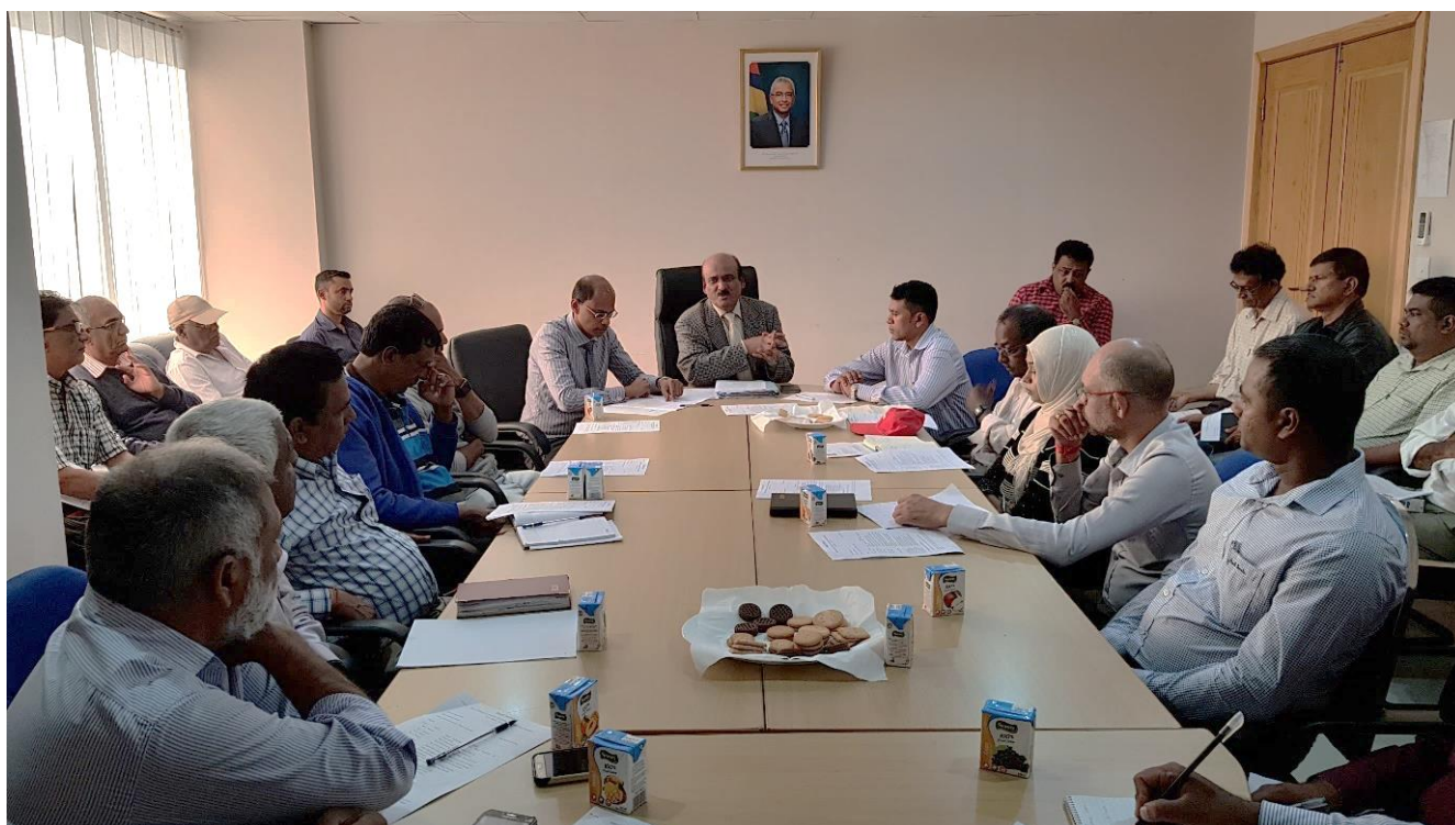
Meeting held at the seat of the Authority in the context of Assumption Day