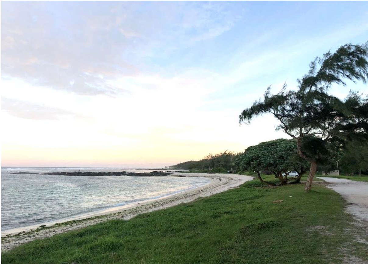
Palmar public beach

The Authority envisages to carry out more activities and complete several ongoing projects regarding the protection and conservation of the public beaches in the near future. Mauritius may be a small country, but together we can make a big difference by bringing meaningful changes.