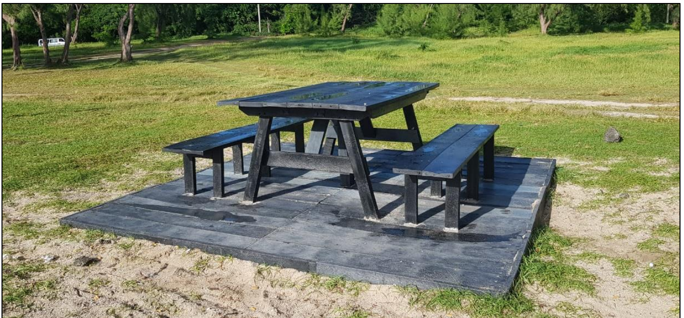
Palmar public beach (completed)