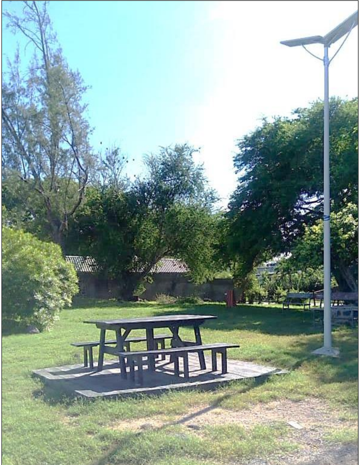
P. G. Anna public beach (completed)