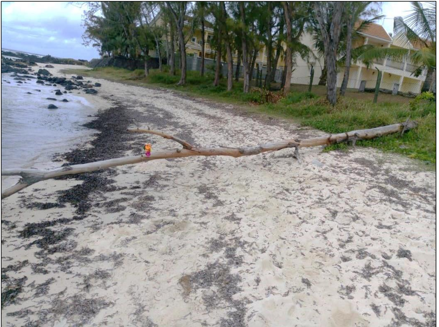
Fallen filao tree and accumulated seaweeds at Palmar public beach (near Surcouf Hotel)

It was observed that no major damages were noted to our beach amenities (bins, benches, fireplaces, lighting systems) and the associated infrastructures with the exception of some fallen trees and accumulated seaweeds/debris on certain public beaches such as Palmar near Surcouf Hotel, Grande Rivière Sud Est (Camp des Pêcheurs).