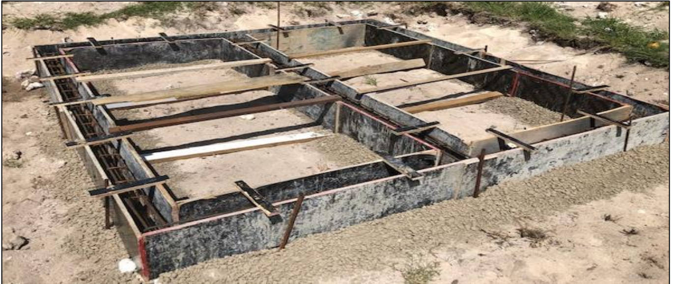
Palmar public beach (work in progress)

The supply and installation of fifty (50) picnic tables on twenty-one (21) public beaches are ongoing. The picnic tables are made of 100% recycled plastic materials which are durable and attractive as sitting areas. The benefit of recycled plastic picnic tables are that they do not rot, warp, splinter or crack. The picnic tables can accommodate 4 to 6 persons at a time. During the month of February, 2019, such picnic tables have been installed at Palmar and P. G. Anna public beaches.