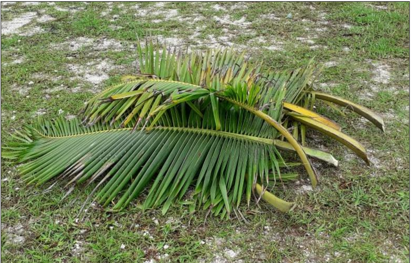
Cut branches are found lying on the public beach

As at date, no other such cases have been reported.