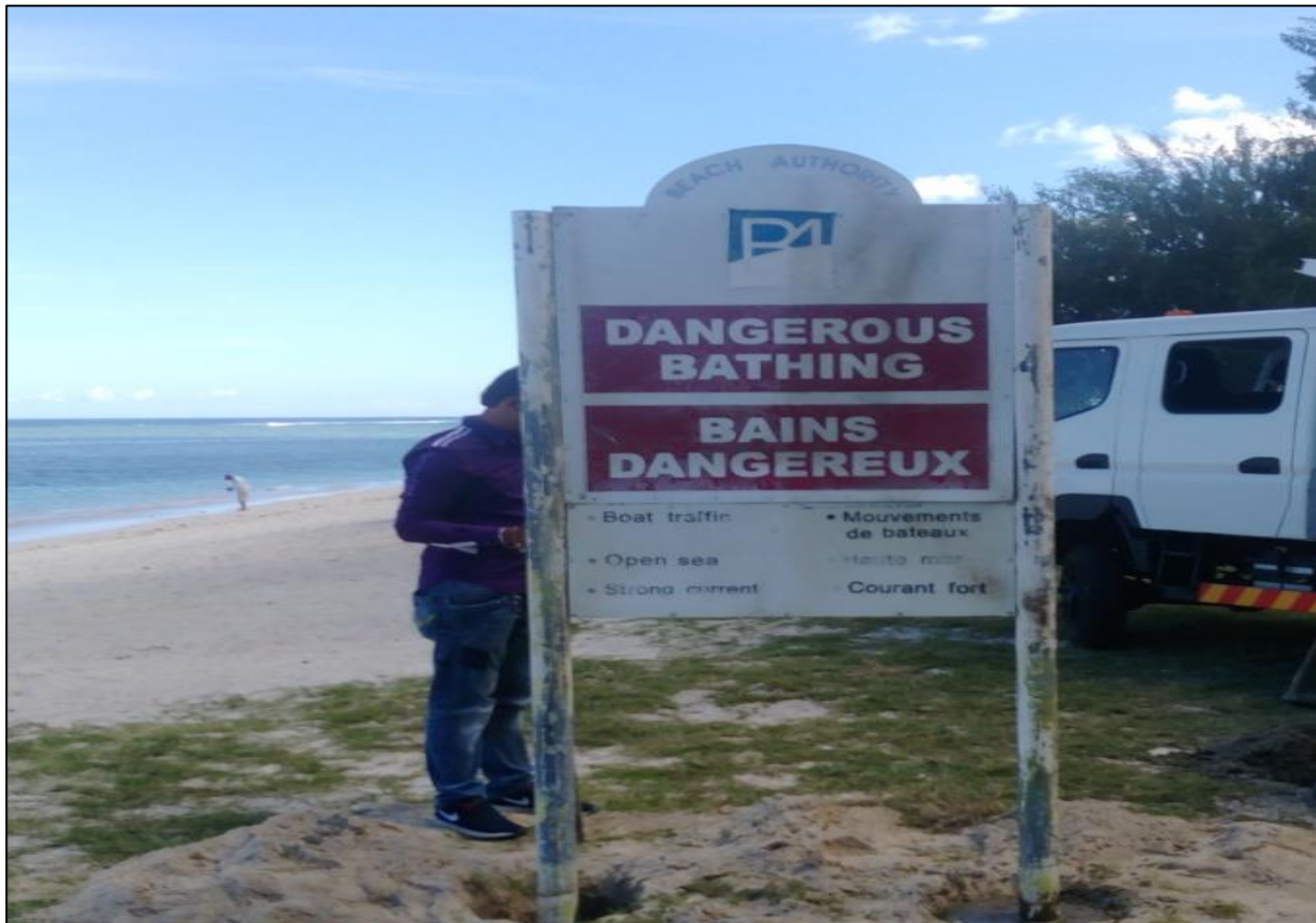
(work in progress)