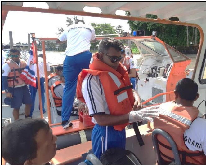
Departure to Flat Island through NCG patrol boat from Grand Baie public beach (near NCG)

About forty (40) bags of wastes, comprising mainly of plastic bottles/bags, dry leaves and leftovers were collected.