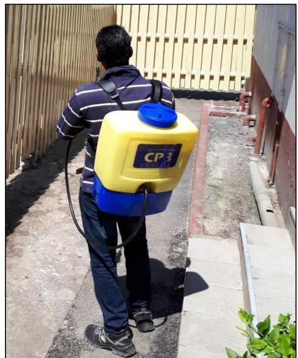
Spraying of pesticides by Handy Worker of the Beach Authority