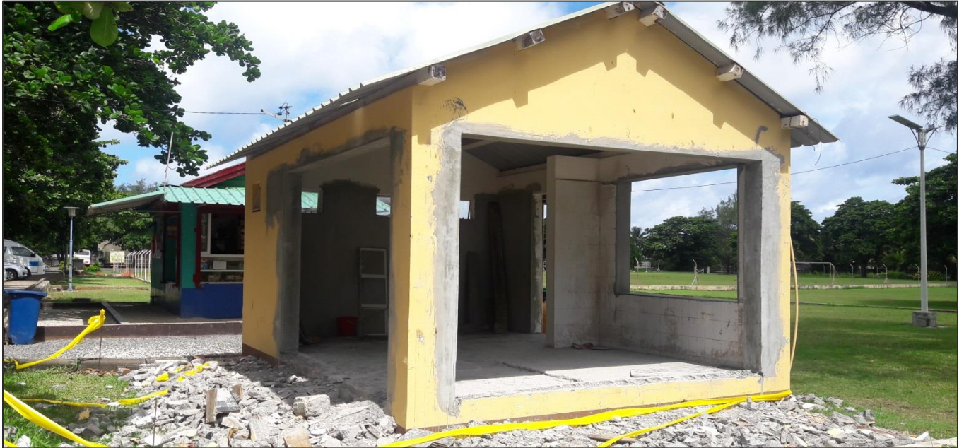
Provision of openings