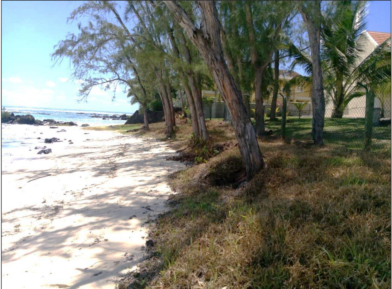
Palmar public beach (near Surcouf Hotel) after the passage of cyclone "Gelena"

The personnel of the Beach Authority did its utmost best to ensure that all the affected beaches are cleaned immediately. The relevant scavenging contractors and the Field Services Unit of the Parent Ministry who are responsible for the day to day cleaning and maintenance of public beaches were requested to deploy additional resources for the removal and carting away of all debris and wastes.