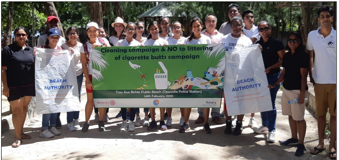
Photo souvenir – participants involved in the cleaning and sensitization campaign