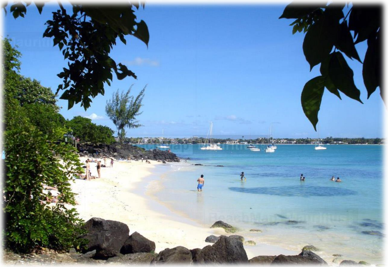
La Cuvette public beach