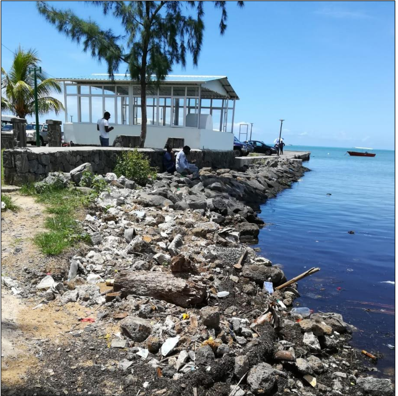
Accumulated seaweeds/debris at Grande Rivière Sud Est public beach (Camp des Pêcheurs)