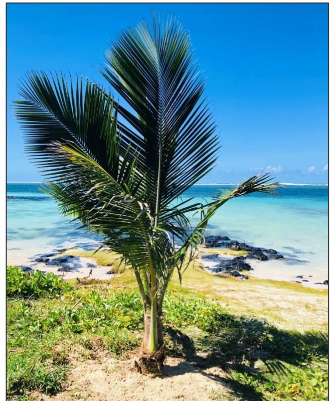
(work in progress)