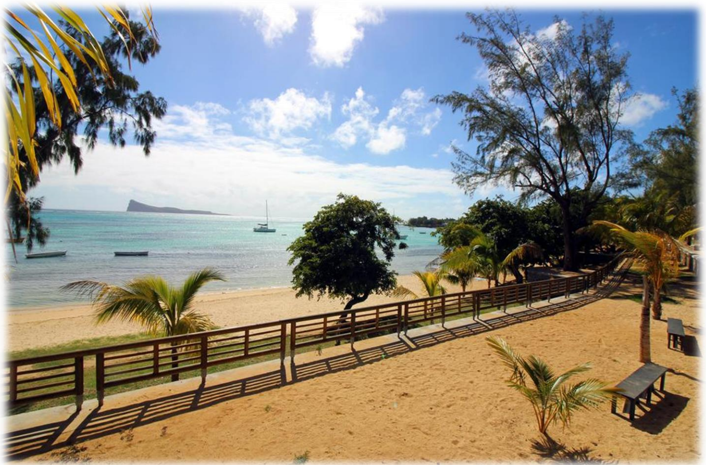
Bain Boeuf public beach

Moreover, the Beach Authority will continue in its quest for excellence to provide appropriate and adequate amenities and facilities on public beaches as well as to carry out regular clean up and sensitisation campaigns.