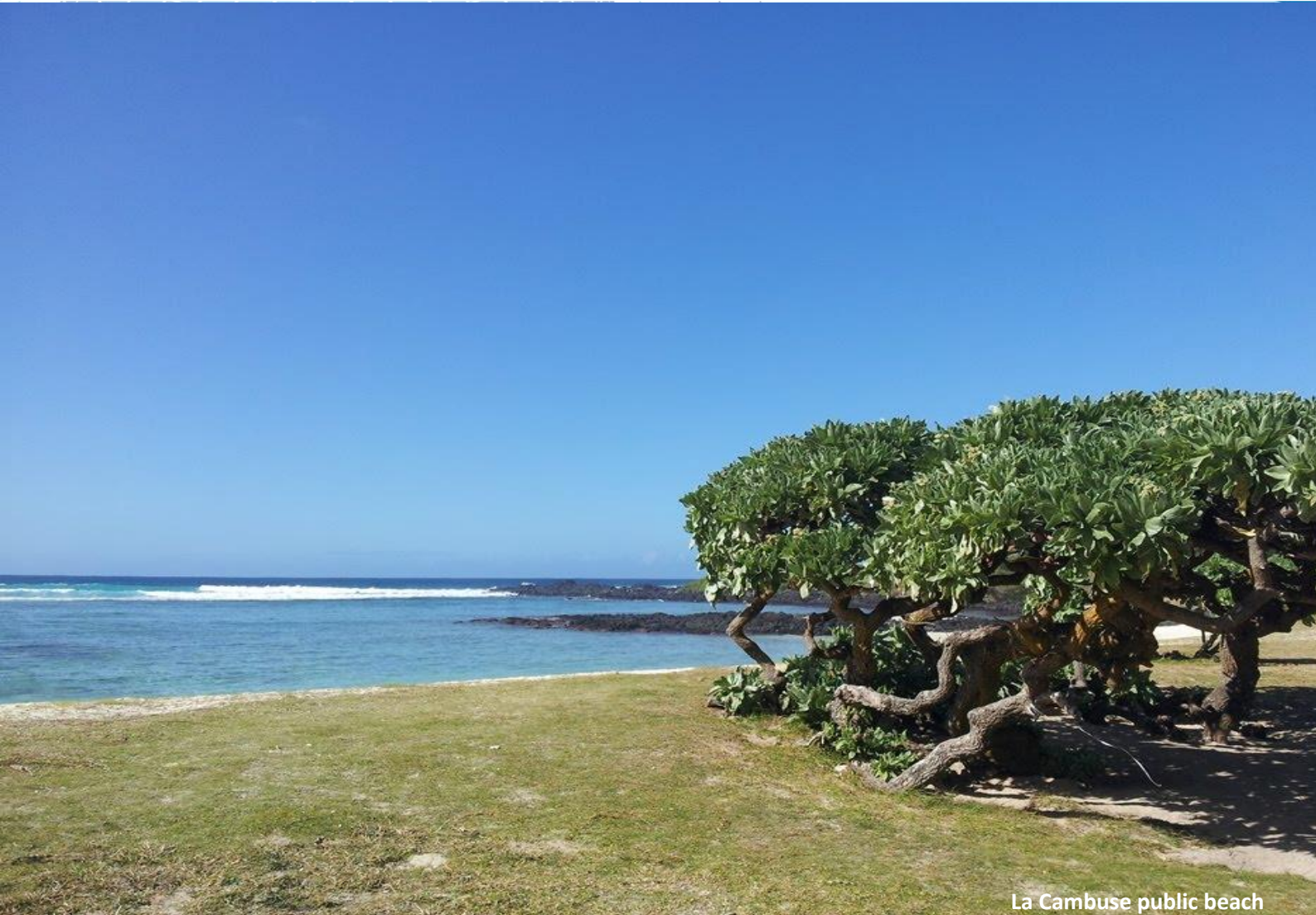
La Cambuse public beach