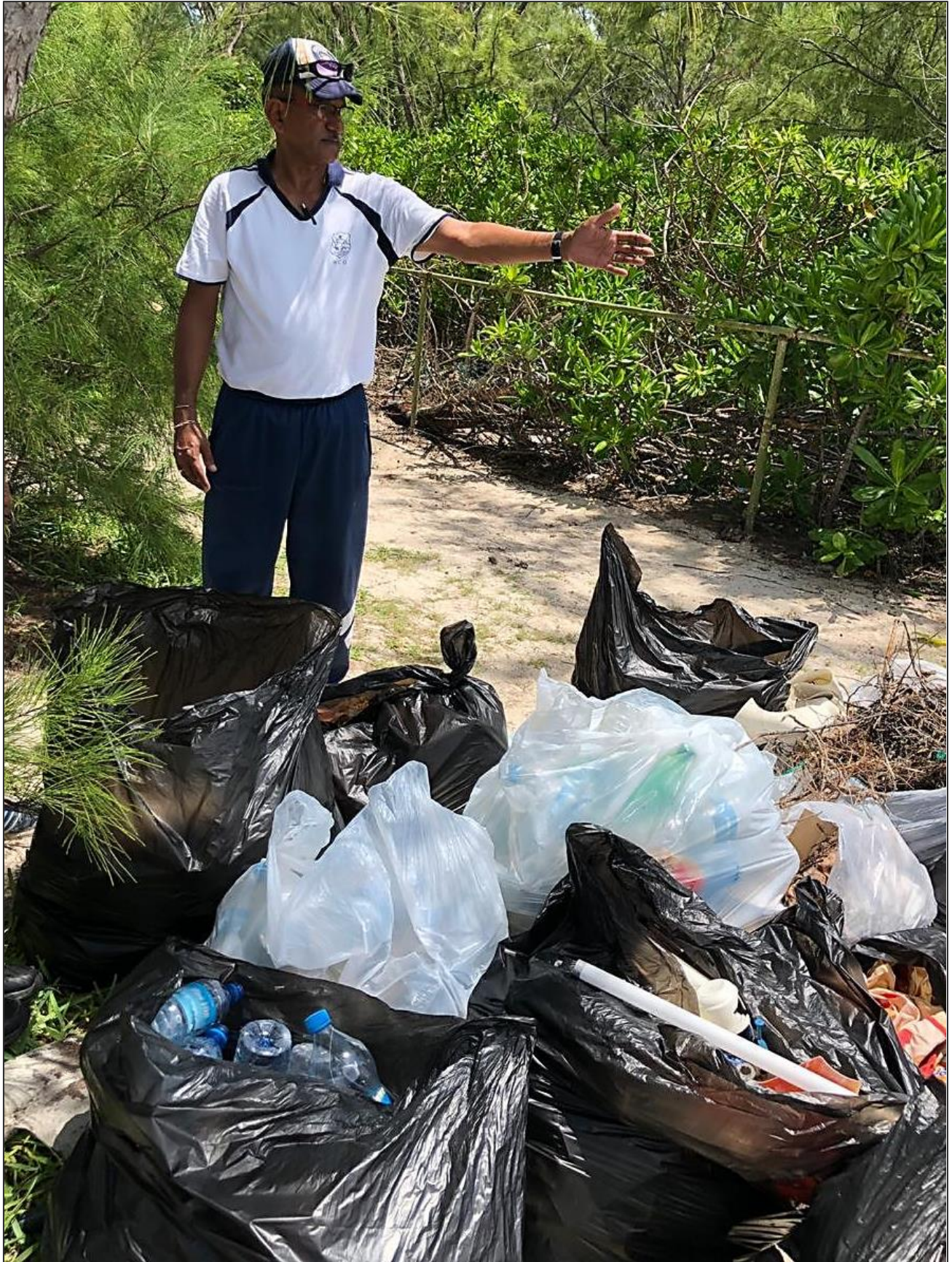
Wastes collected at Flat Island