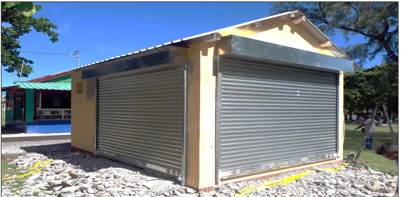
Installation of galvanized roller shutters