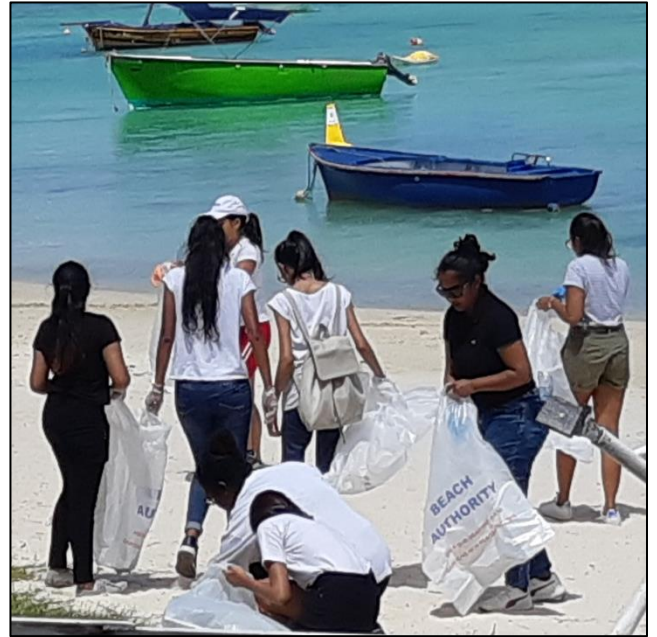
Cleaning of public beach