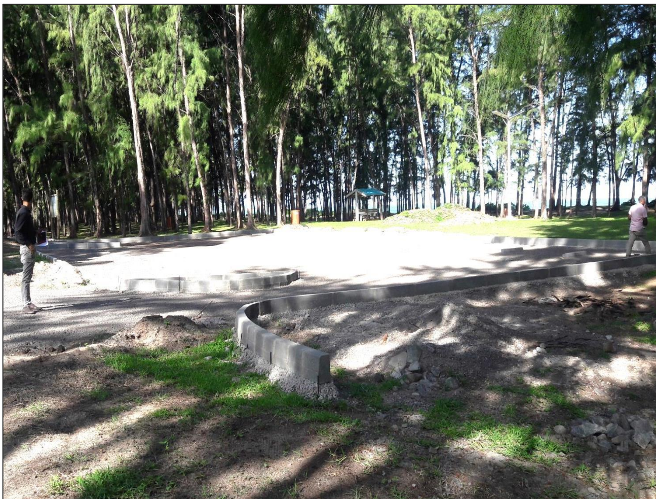
Works in progress