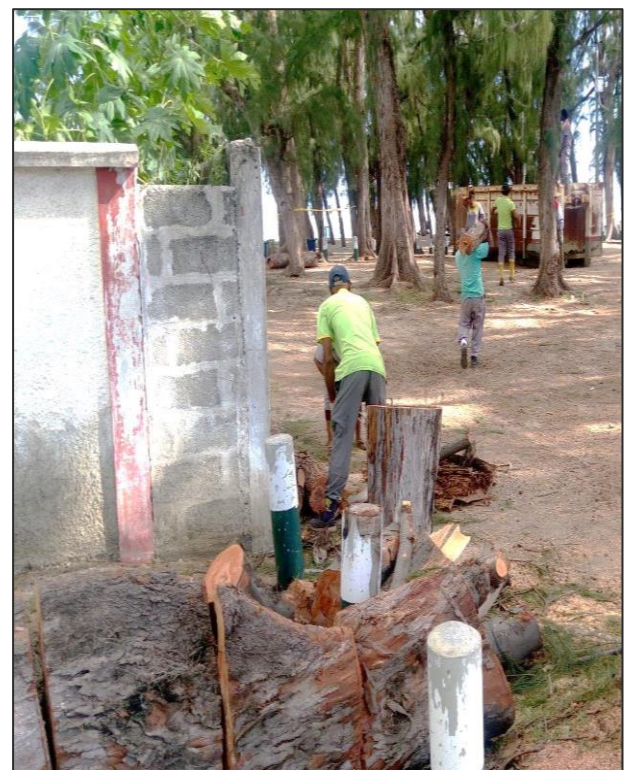
Works in progress