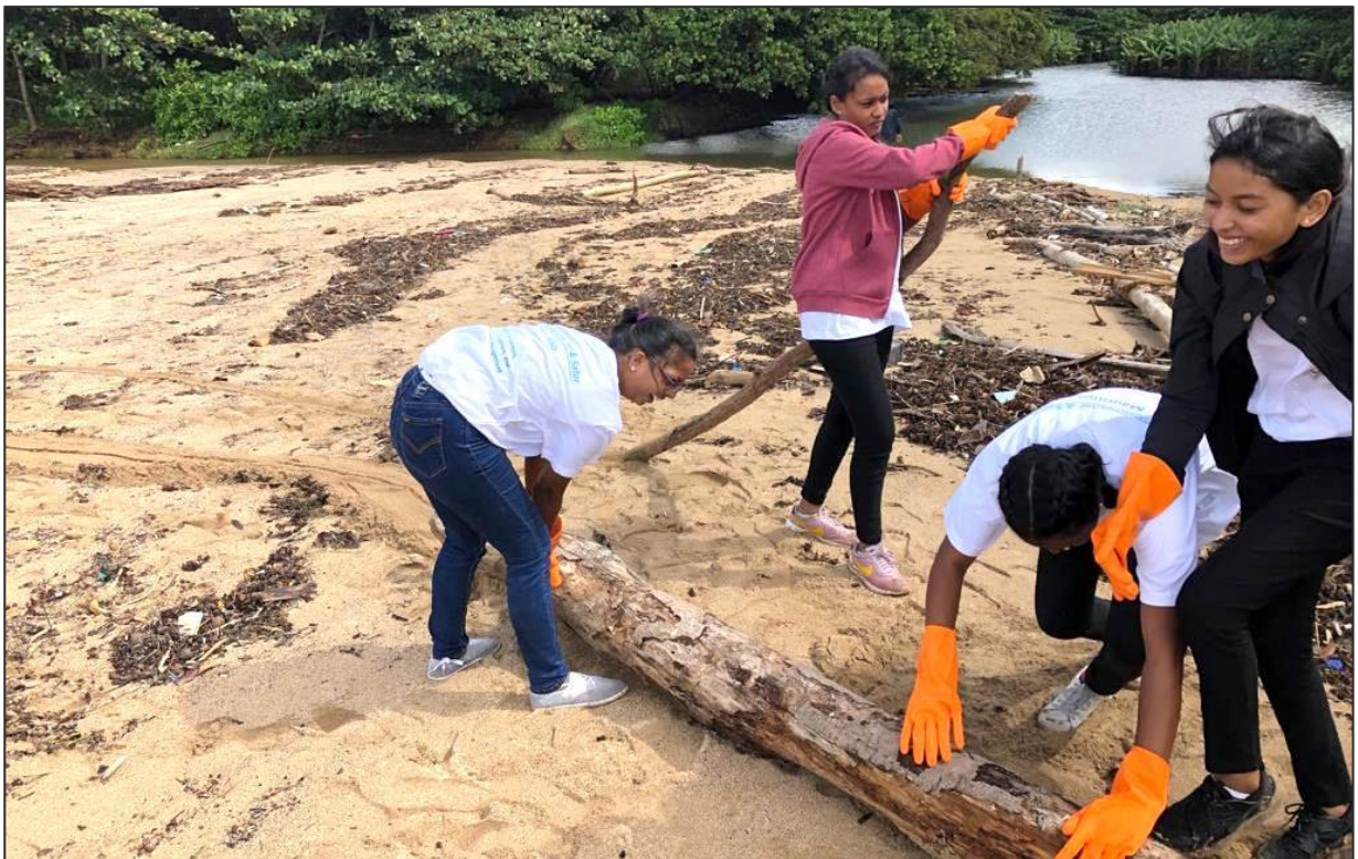
Cleaning of Rivière des Galets public beach