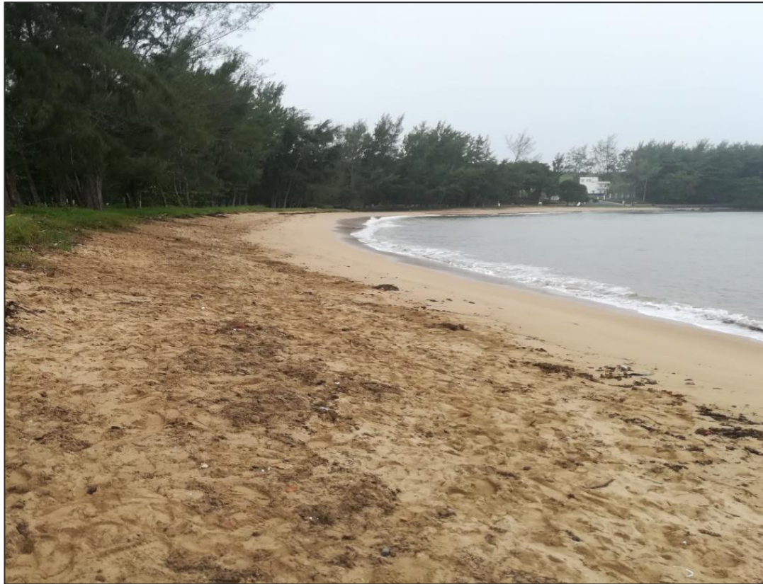
Rivière des Galets public beach after clean-up campaign