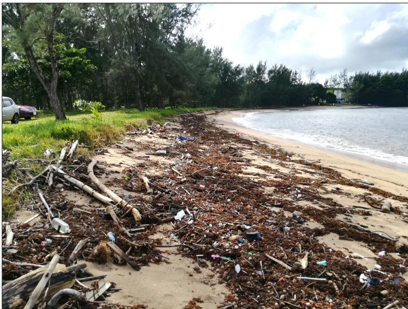
Rivière des Galets public beach before clean-up campaign

About one hundred and thirty (130) bags of wastes, comprising mainly of plastic bottles, debris and sea wastes were collected and carted away.