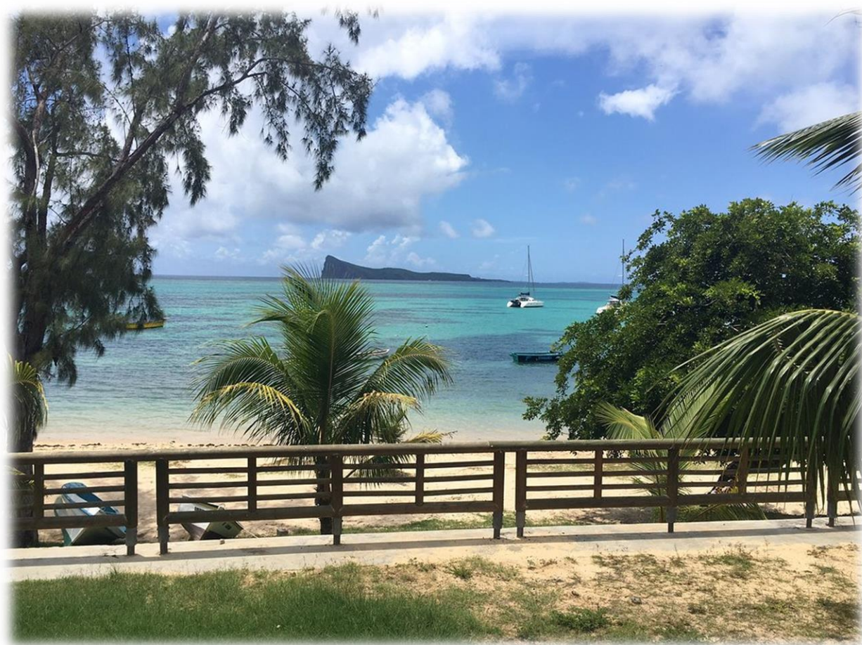
Bain Boeuf public beach

The Beach Authority also aims at sensitising beach users and the public about environmental issues and thus engaging in unison to create an enjoyable place for one and all.