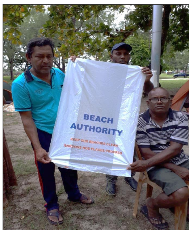
Distribution of plastic bin bags to beach users at Belle Mare public beach