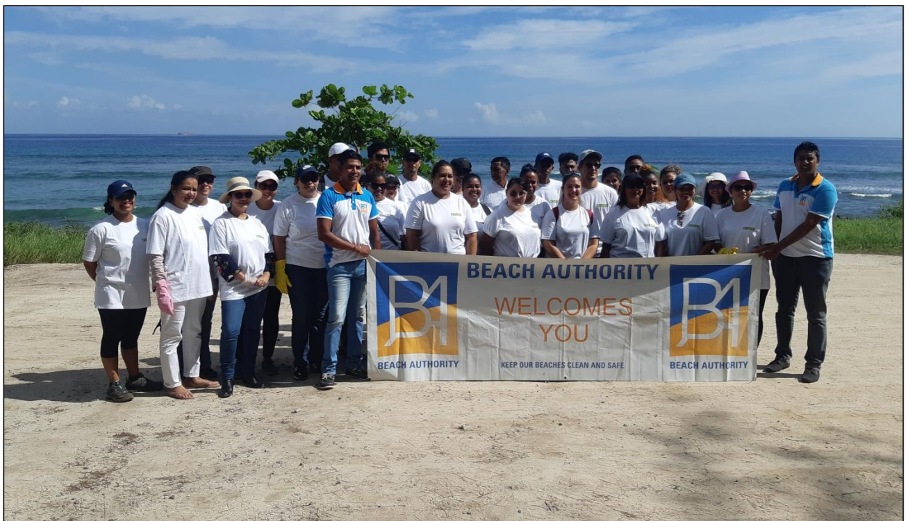
Photo souvenir – participants involved in the cleaning campaign at Pointe aux Piments public beach (near Cemetery)