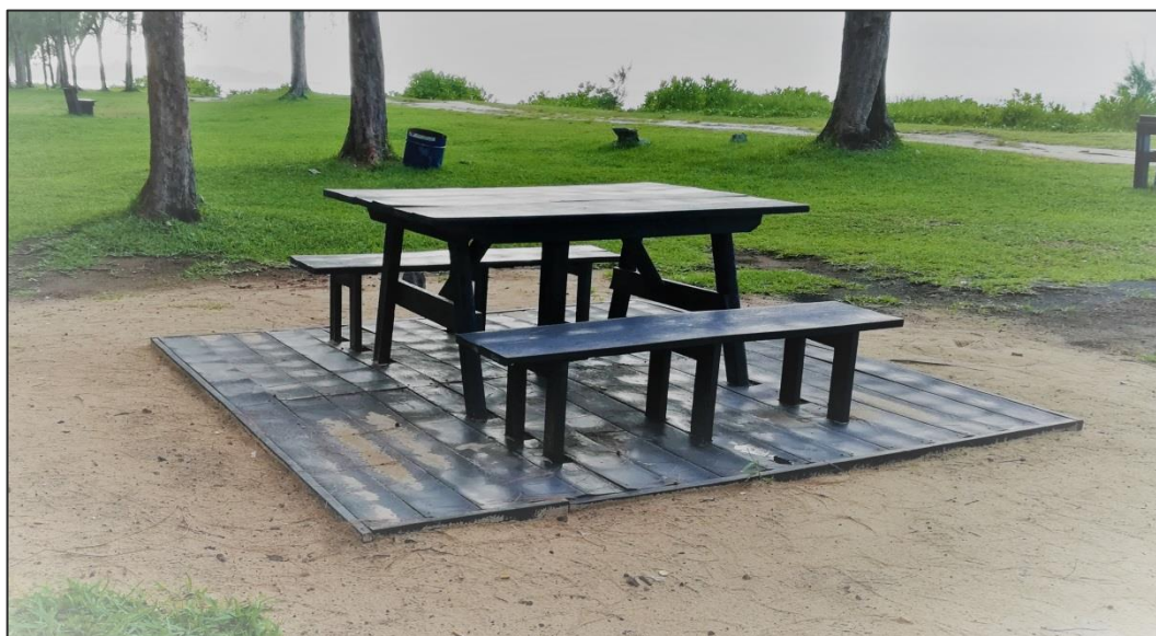
Picnic table (with recycle plastics) at Pomponette public beach

The installation of four (4) picnic tables, eight (8) litter bins and two (2) mini-kiosks have been completed in May, 2019 .