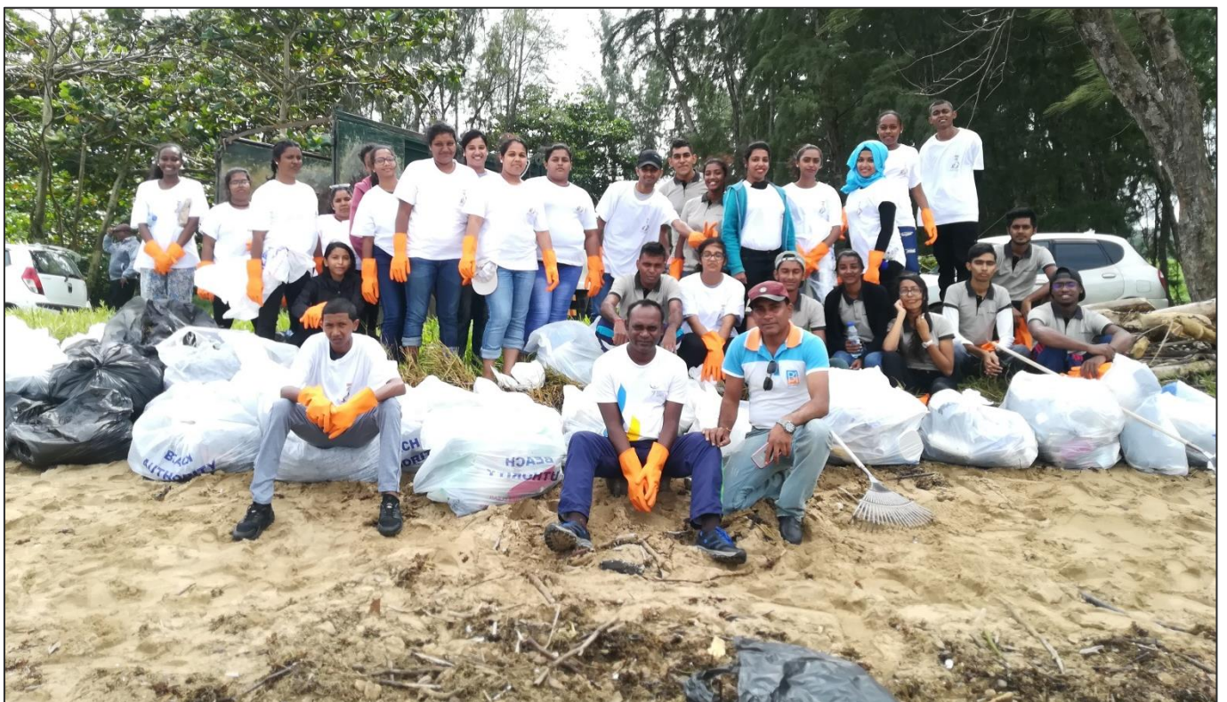
Photo souvenir – participants involved in the clean-up campaign at Rivière des Galets public beach