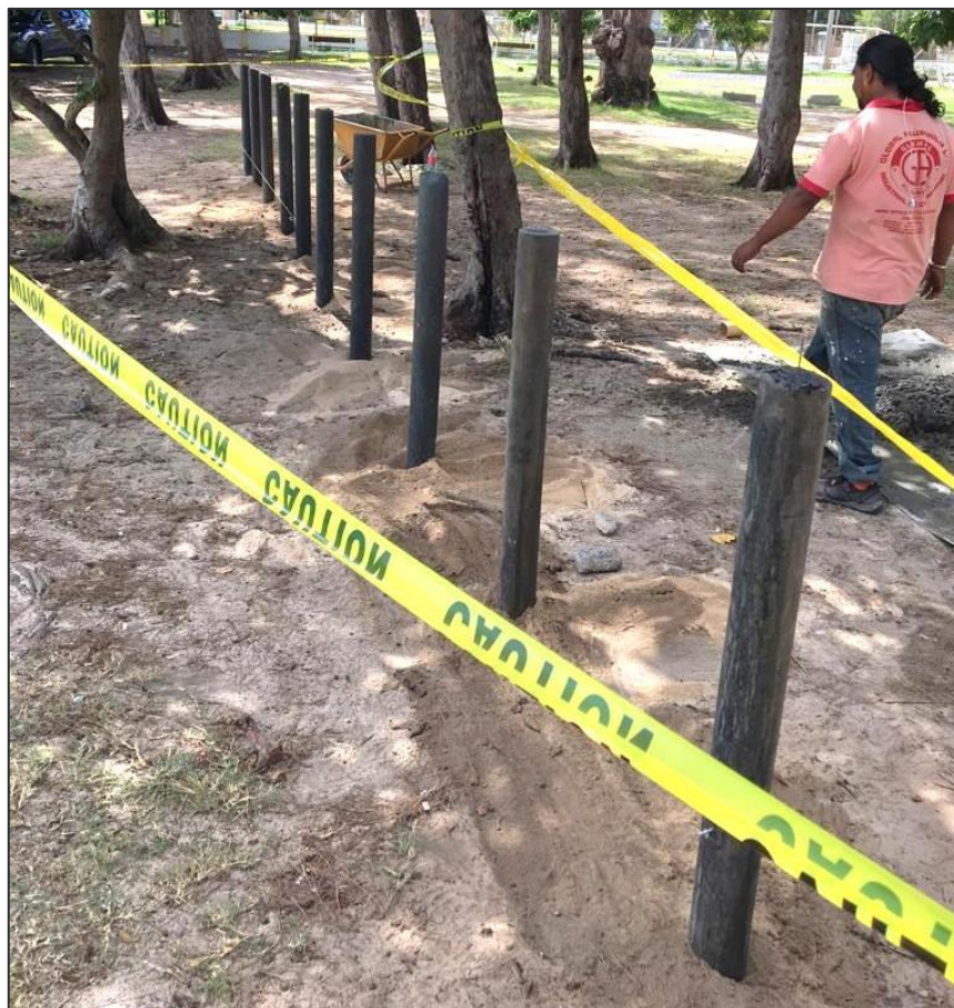
Fixing of plastic composite bollards at Flic en Flac public beach (Works in progress)