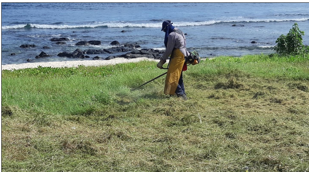
Mowing of grass at Pointe aux Piments public beach (near Cemetery) (work in progress)