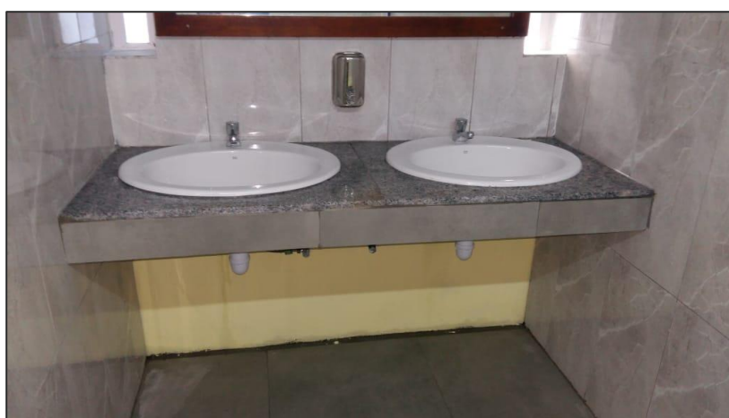
Supply & fixing of new wash basin at La Cuvette public beach