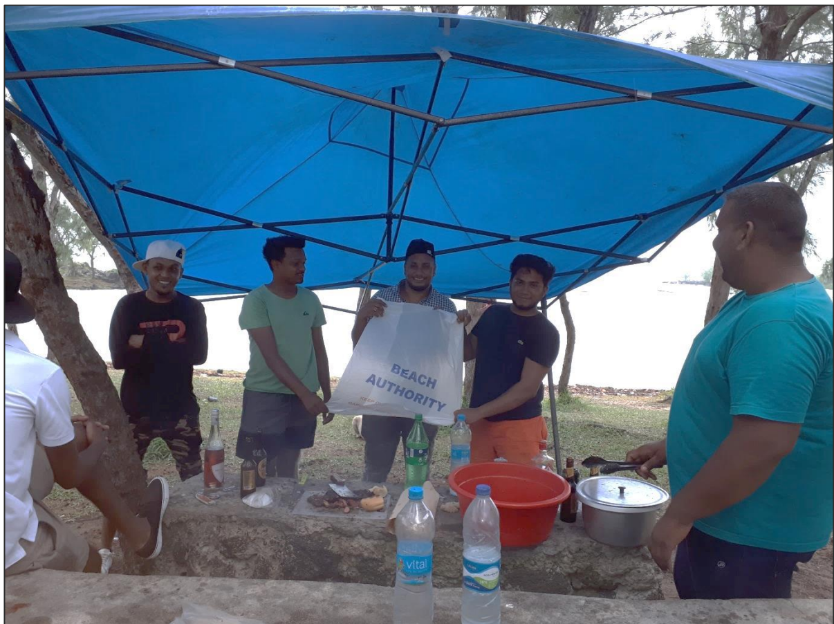
Distribution of plastic bin bags to beach users at Melville public beach