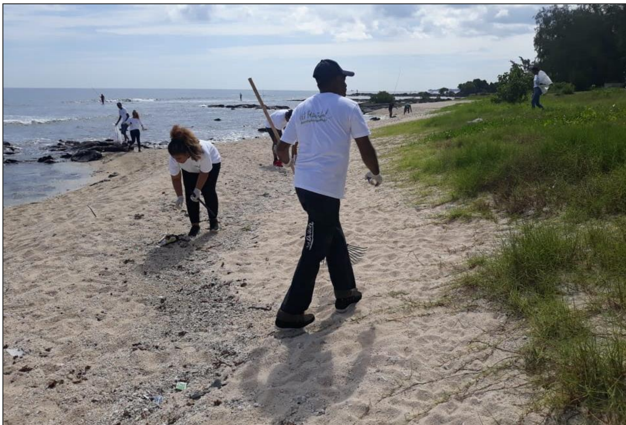
Cleaning of shoreline at Pointe aux Piments public beach (near Cemetery)