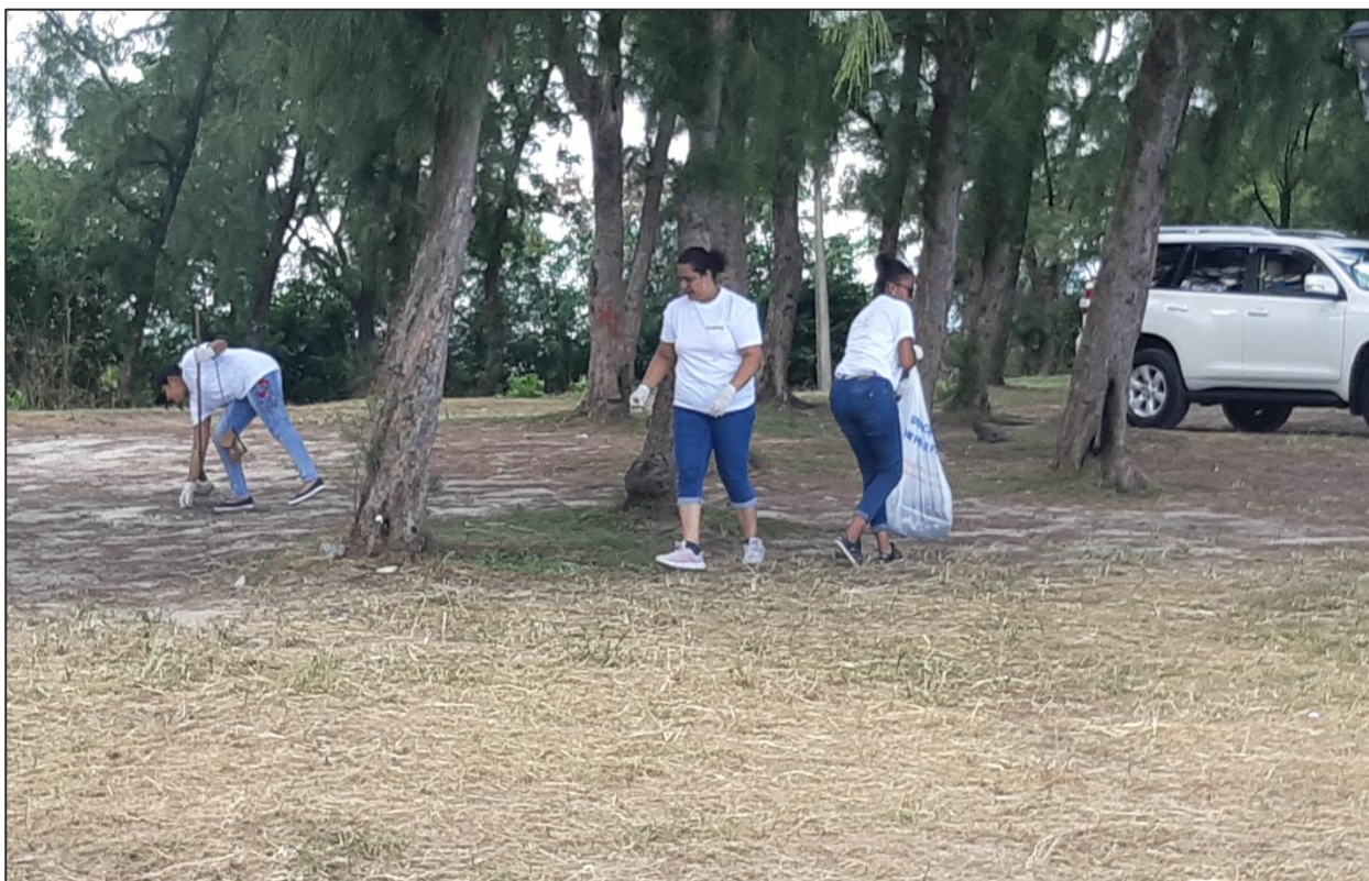
Cleaning of Pointe aux Piments public beach (near Cemetery)