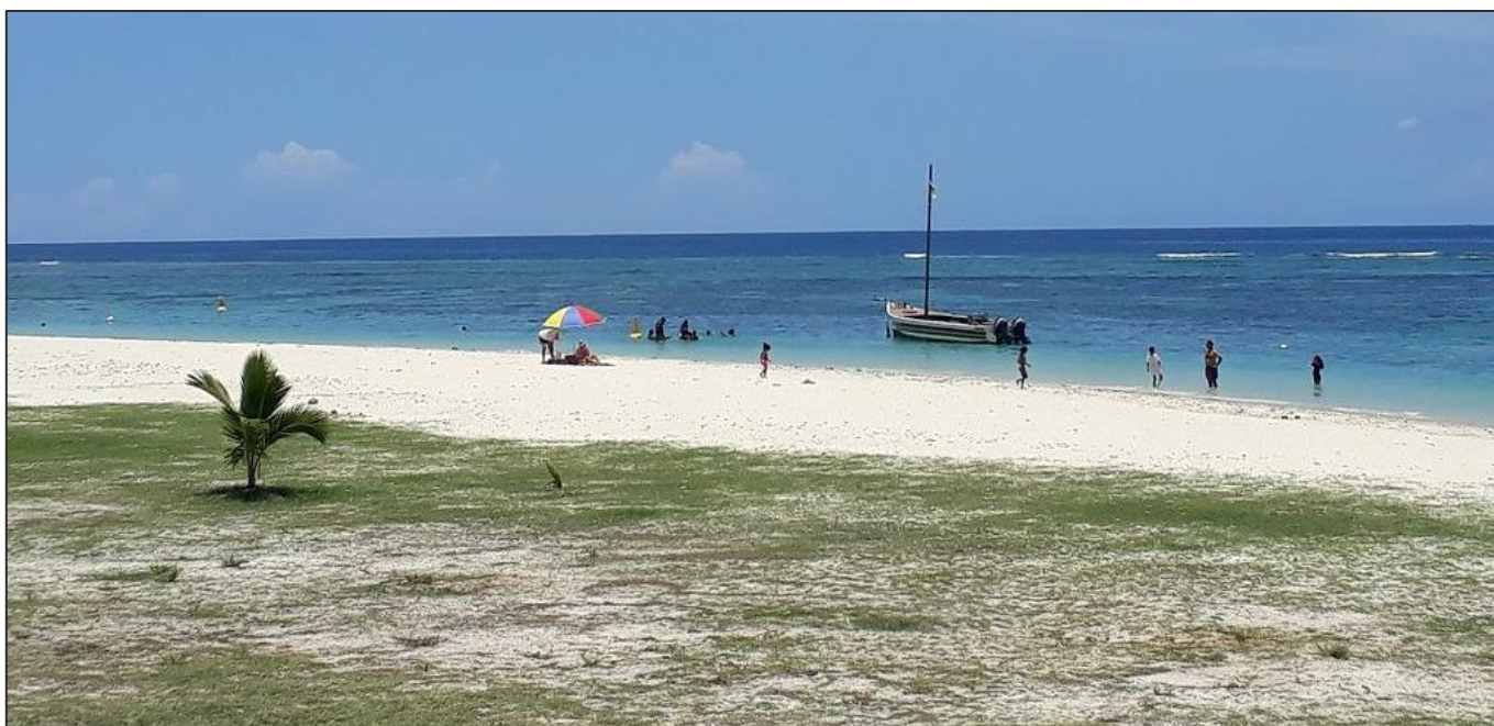
Flic en Flac public beach