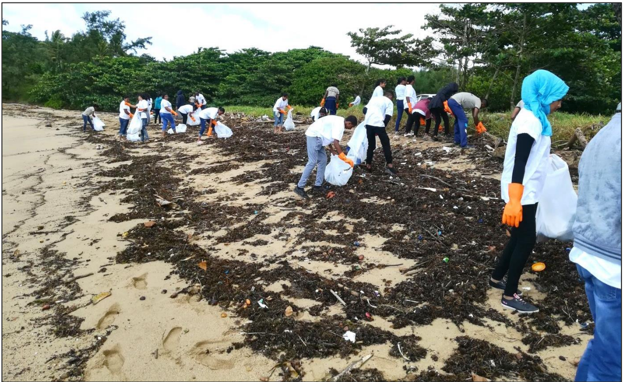
Cleaning of shoreline at Rivière des Galets public beach