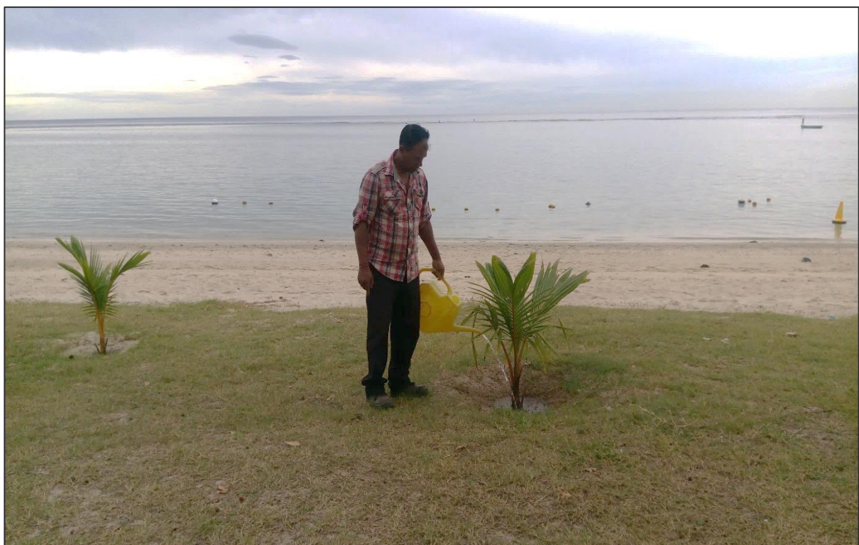
Watering of coconut plants at Flic en Flac public beach by a General Worker of the Beach Authority