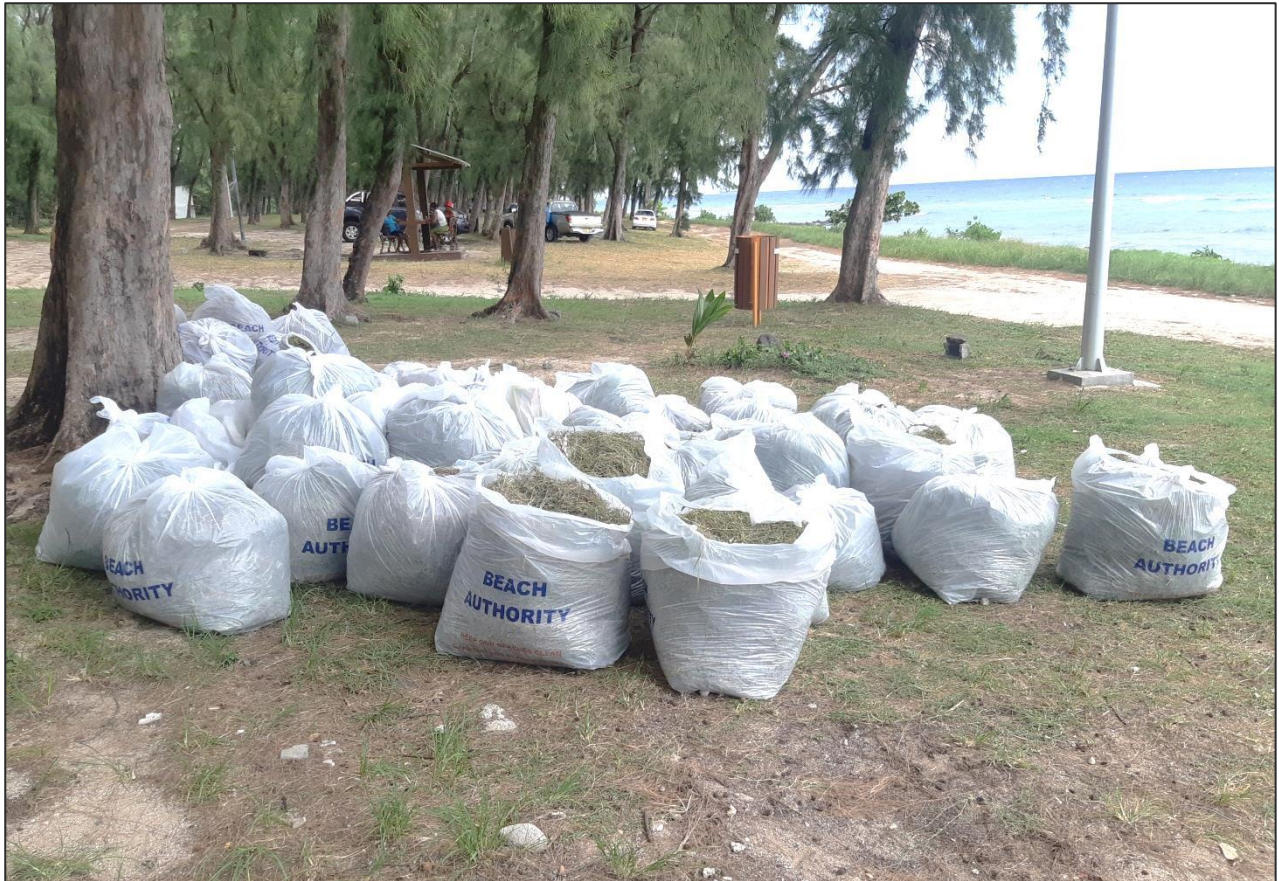
Wastes collected at Pointe aux Piments public beach (near Cemetery)