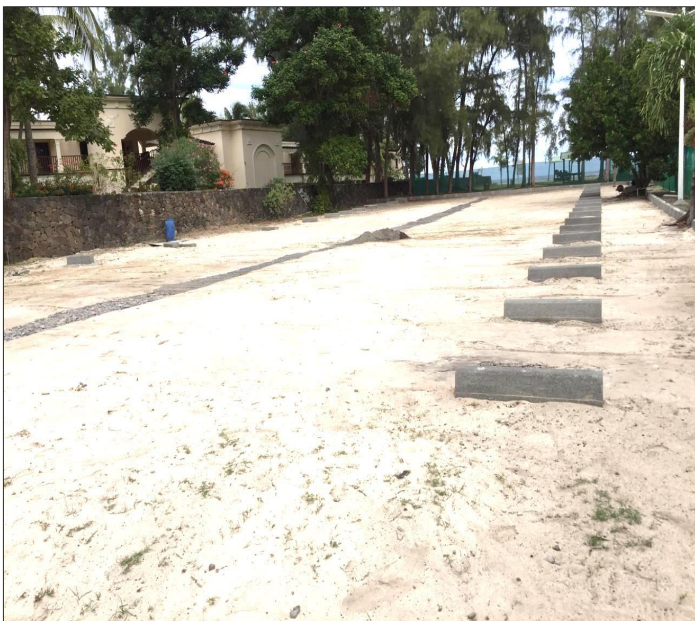
Construction of parking area at Wolmar public beach (Works in progress)

The constructions of parking areas at Wolmar and Palmar public beaches are ongoing and works are expected to be completed by July, 2019 .