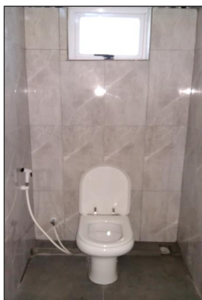
Supply & fixing of new Water Closet at La Cuvette public beach