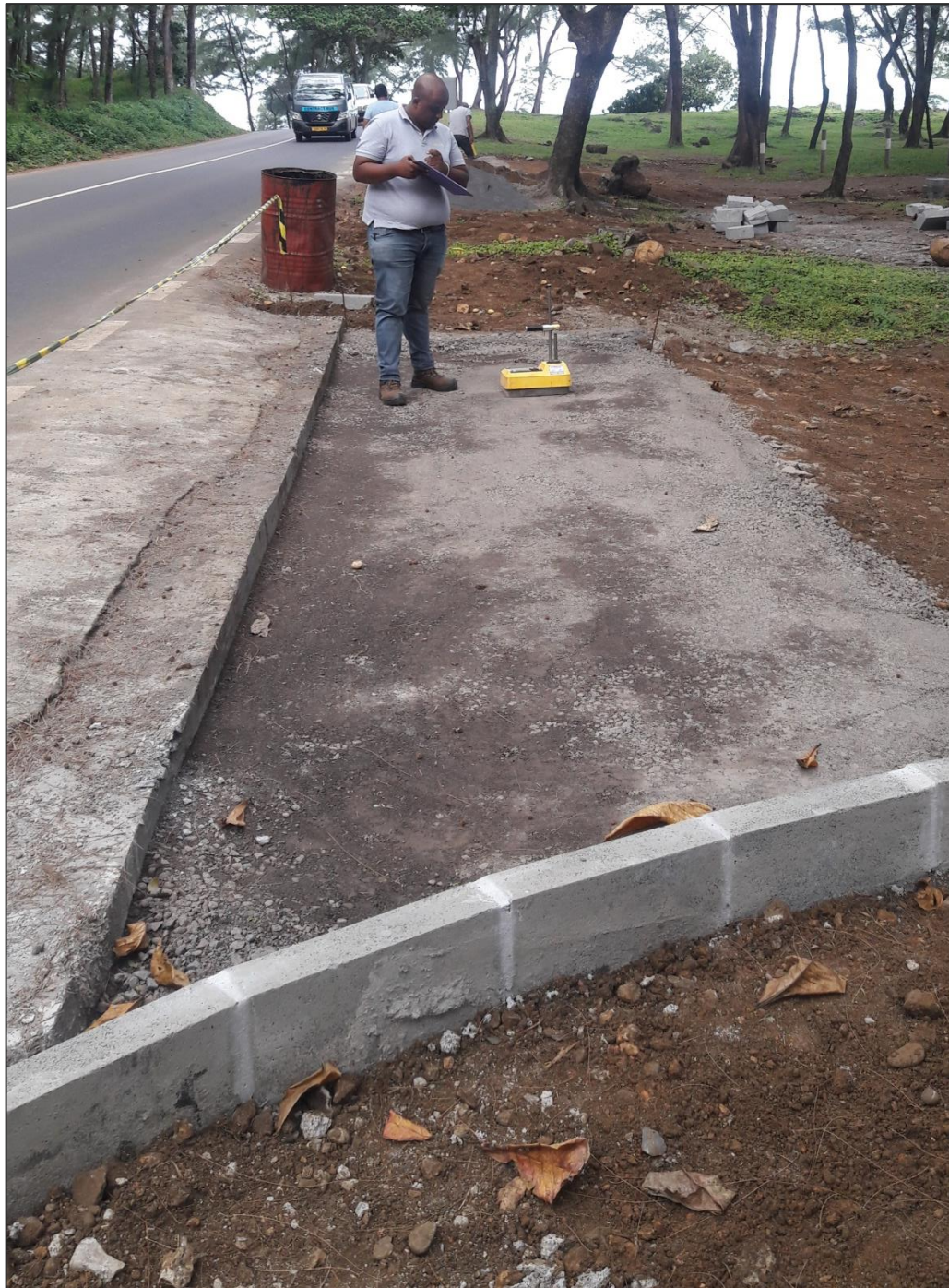
Upgrading of access at Rivière des Galets public beach (Works in progress)

The Authority has embarked on a project to upgrade access on public beaches. After Mont Choisy and Le Goulet public beaches, the access at Rivière des Galets public beach is being upgraded to facilitate movements of beach users. The works are expected to be completed by mid-June, 2019.