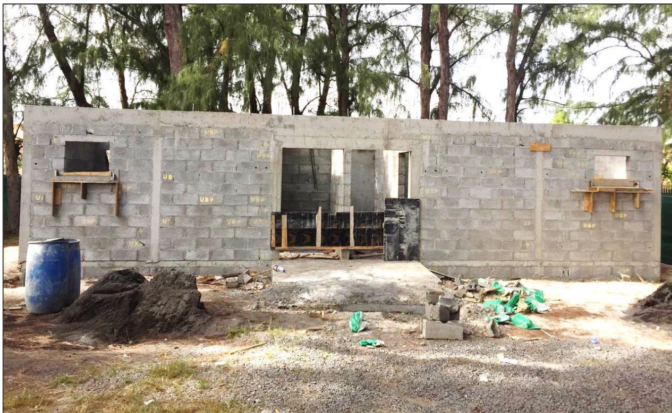
Construction of new toilet blocks at Flic en Flac public beach (near Ex- Mer de Chine) Laying of block walls in progress

The Authority has embarked on the construction of a new toilet block at Flic en Flac public beach (near ex-Mer de Chine) with a view to provide better facilities to beach users. The works are ongoing and are expected to be completed by July, 2019 .