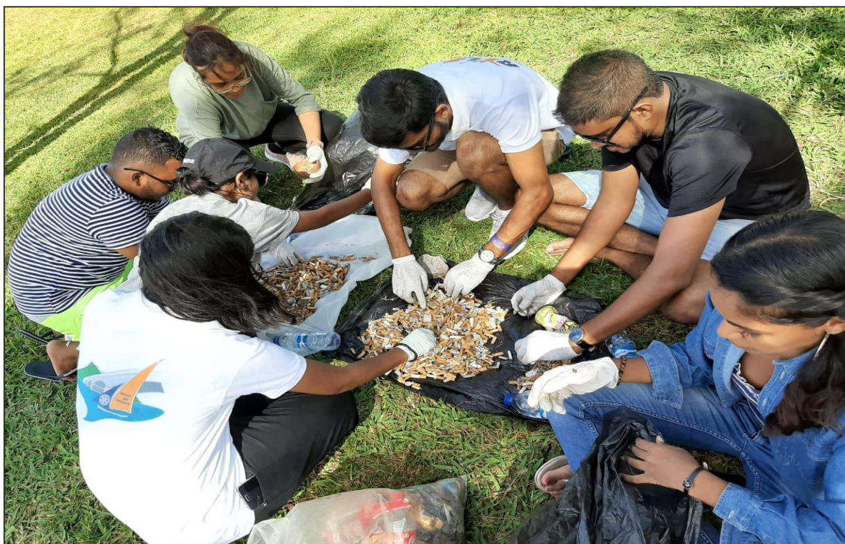
Counting of cigarette butts by members of Mahebourg Rotaract Club at Le Bouchon public beach