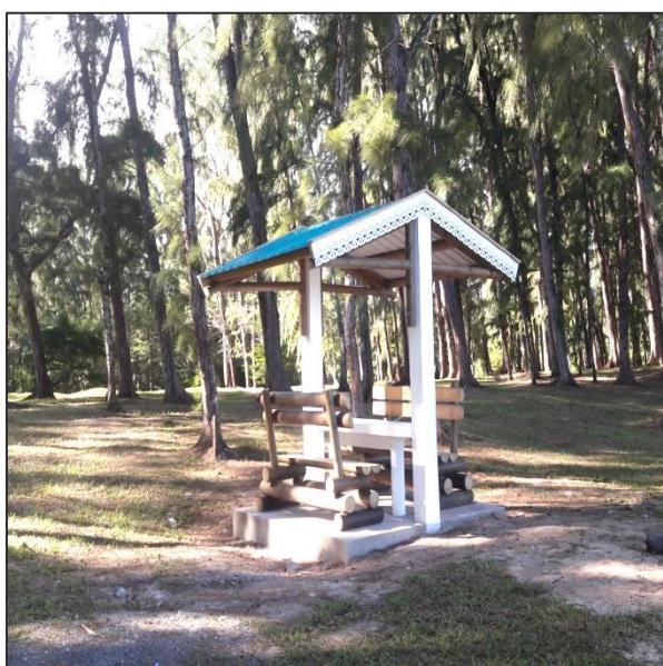
Mini-kiosk at Pomponette public beach