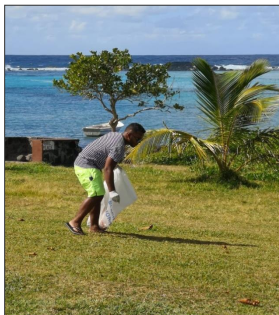
Collection of cigarette butts at Le Bouchon public beach