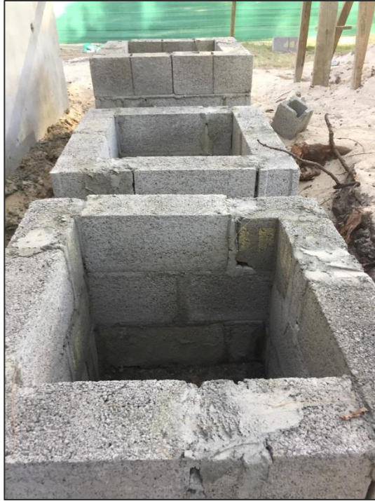
Construction of manholes (Works in progress)

The Authority has embarked on the construction of a new toilet block at Flic en Flac public beach (near ex-Mer de Chine) with a view to provide better facilities to beach users. The works are ongoing and are expected to be completed by July, 2019 .