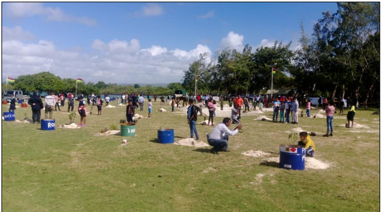
World Environmental Day celebration at Bras d'Eau public beach (Tree plantation)