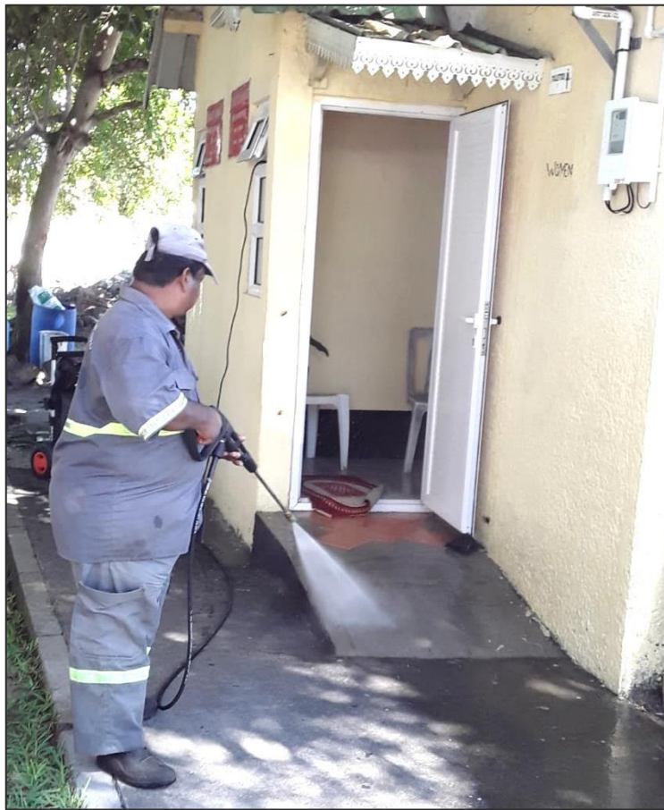
Pressure cleaning at Trou d'Eau Douce public beach