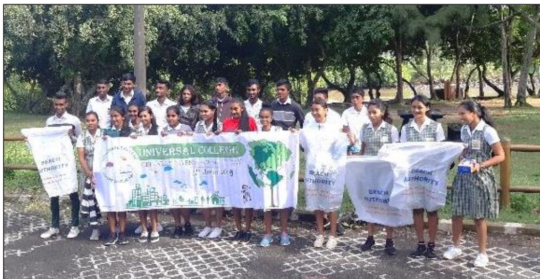
Photo souvenir – participants in the clean-up campaign at Von Moltke public beach in the context of celebration of World Ocean Day