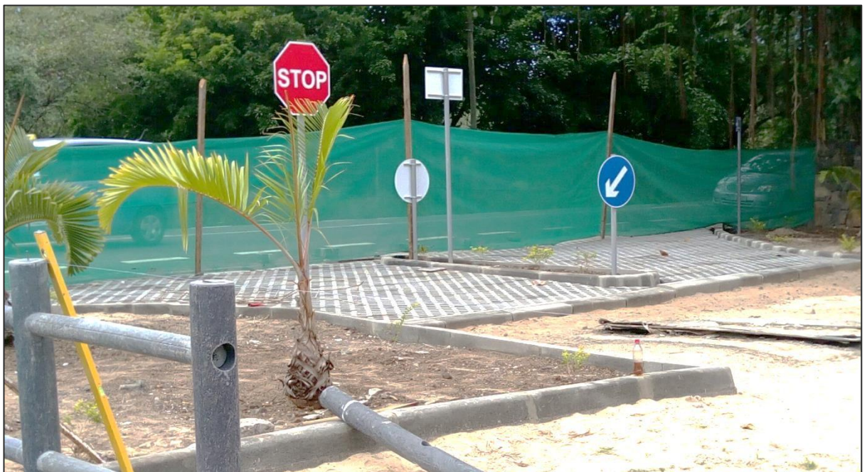
Construction of parking area at Wolmar public beach (Works in progress)

The constructions of parking areas at Wolmar and Palmar public beaches are ongoing and works are expected to be completed by July, 2019