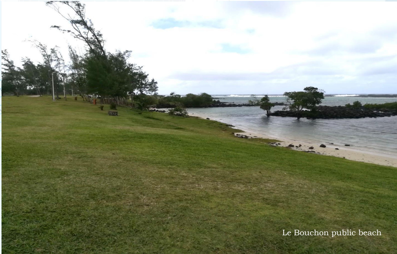
Le Bouchon public beach