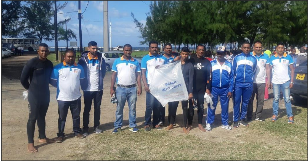
Personnel of Beach Authority & National Coast Guard ready for cleaning of La Prairie public beach