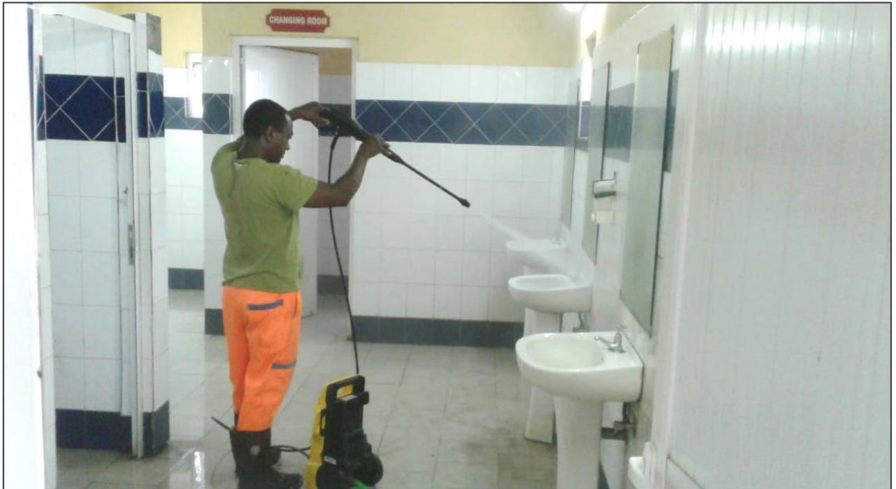
Pressure cleaning inside toilet blocks at Mont Choisy public beach