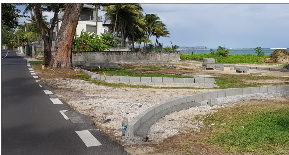
Fixing of kerbs at the main entrance of parking area at Riambel public beach (Works in progress)