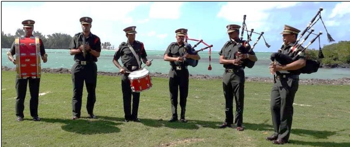
Musical performance by Police Band (Special Mobile Force) at Bras d'Eau public beach