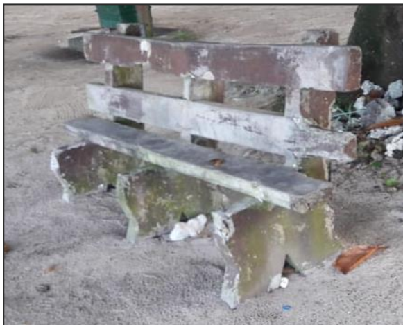
Saint Felix public beach (Before)