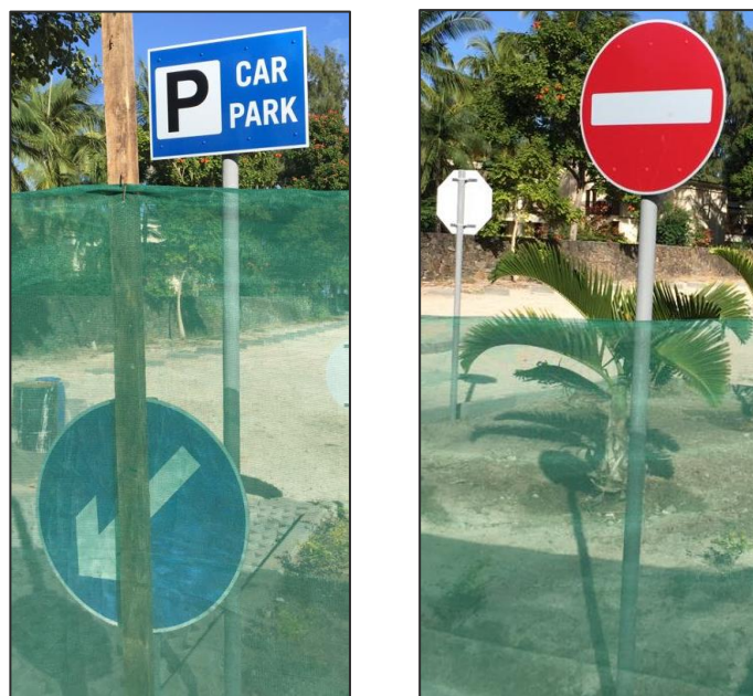
Construction of parking area at Wolmar public beach - Fixing of traffic signs (Works in progress)