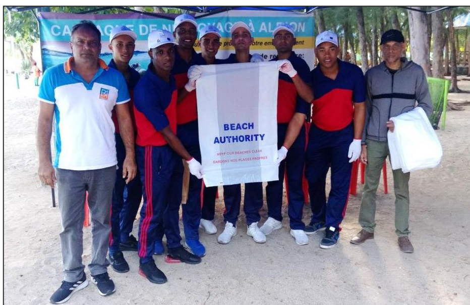
Distribution of plastic bin bags to beach users at Albion public beach