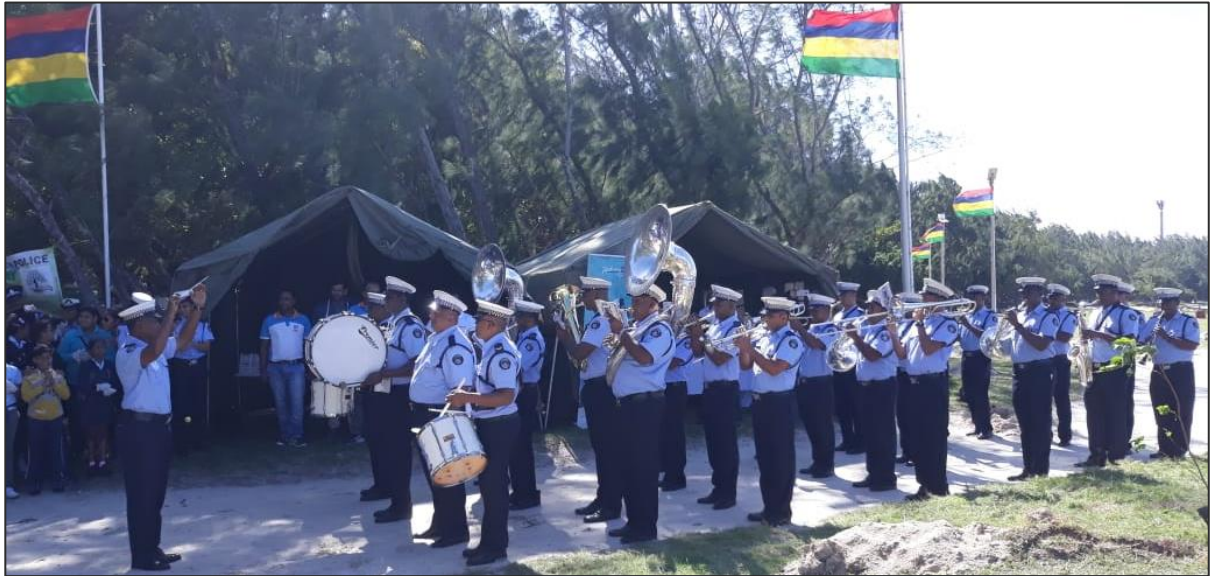
Musical performance by Police Band at Bras d'Eau public beach