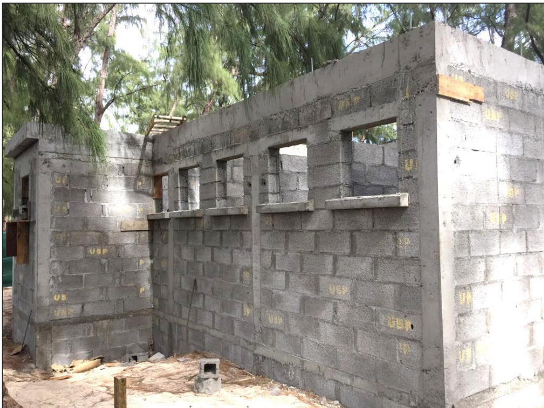
Construction of three window cills (Works in progress)