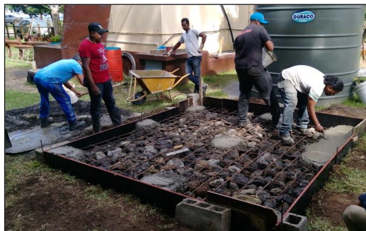
Works in progress