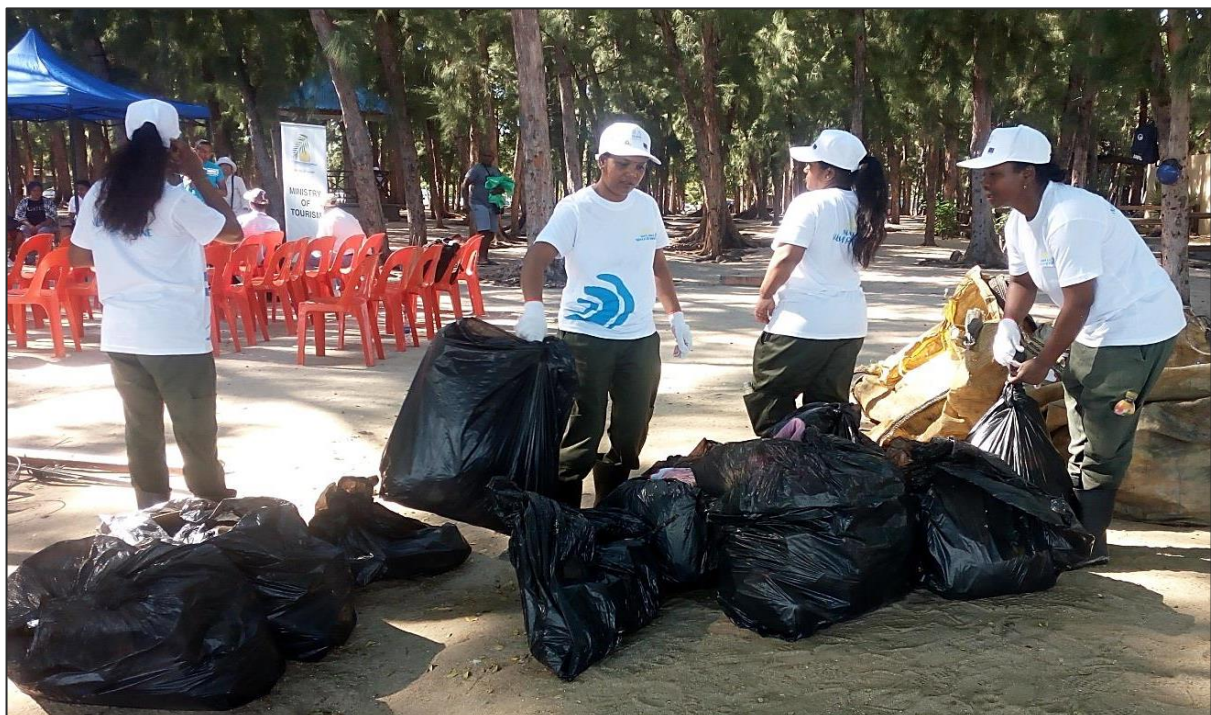
Wastes collected at Albion public beach