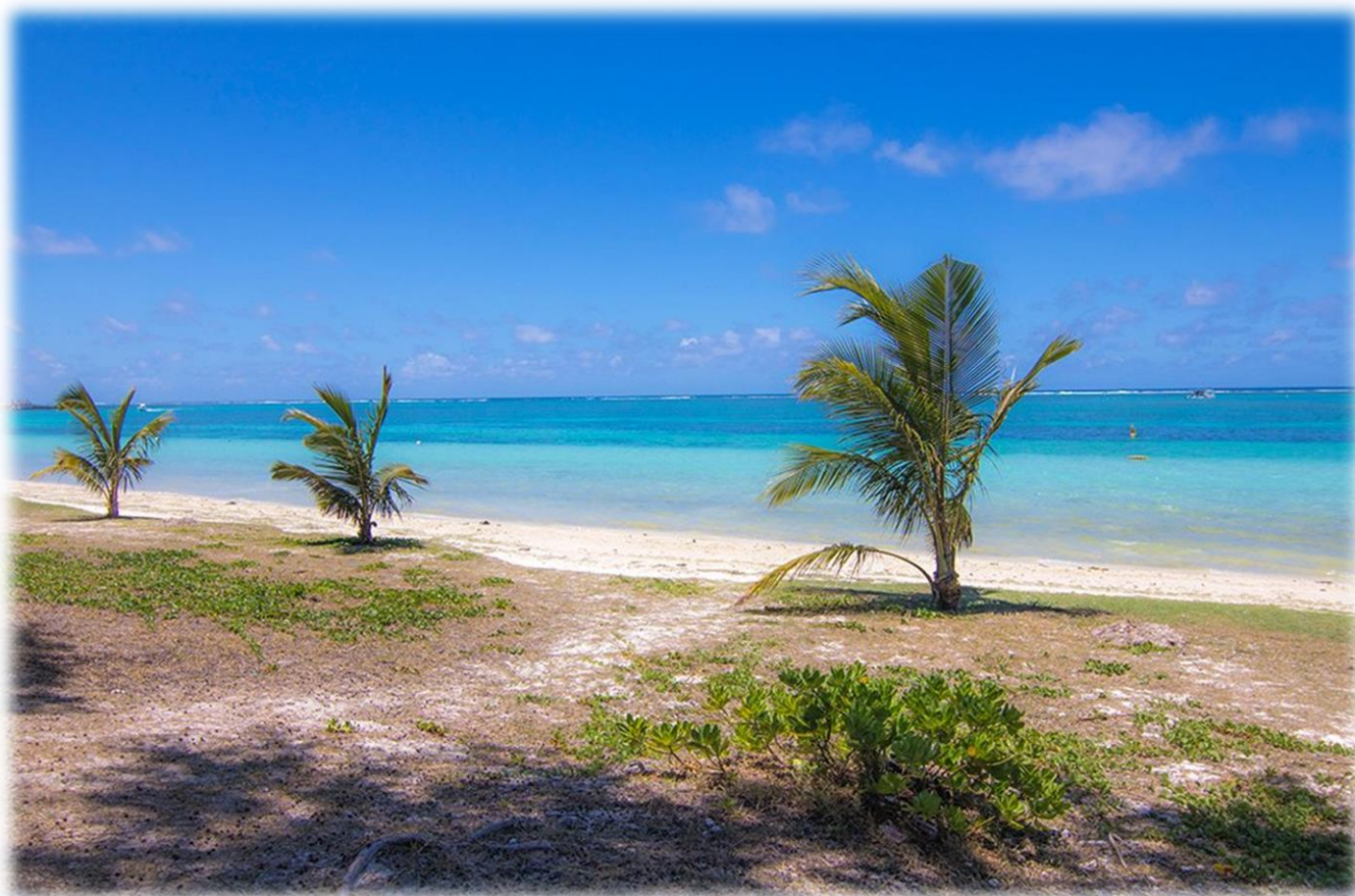
Belle Mare public beach

We have achieved a lot in such a short time, however, there is still a long way to go.