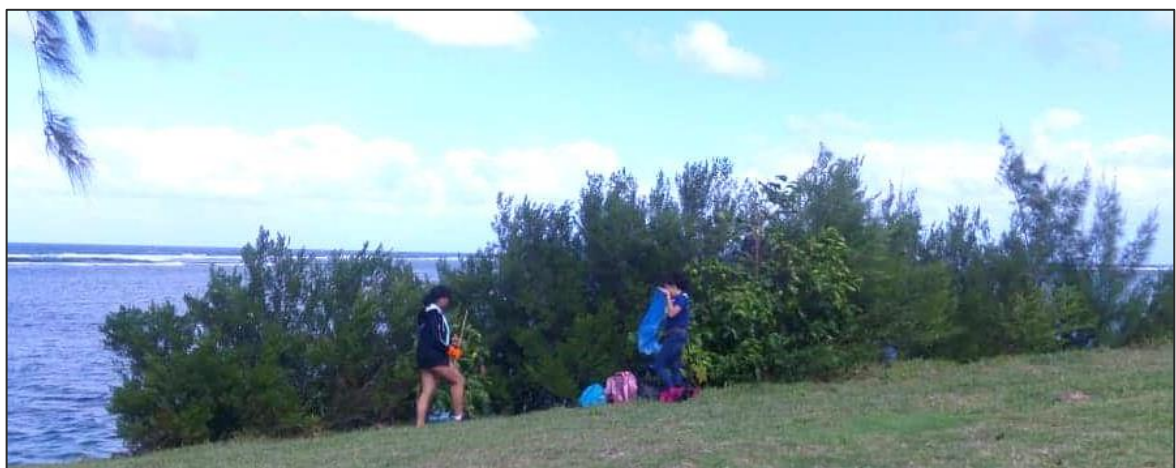
Cleaning of La Prairie public beach by members of Mauritius Girl Guides Association