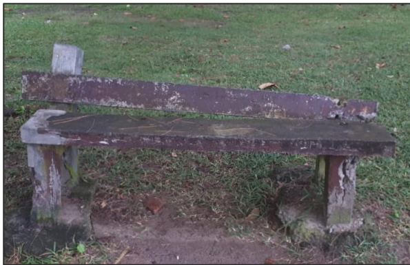
Baie du Cap public beach (Before)