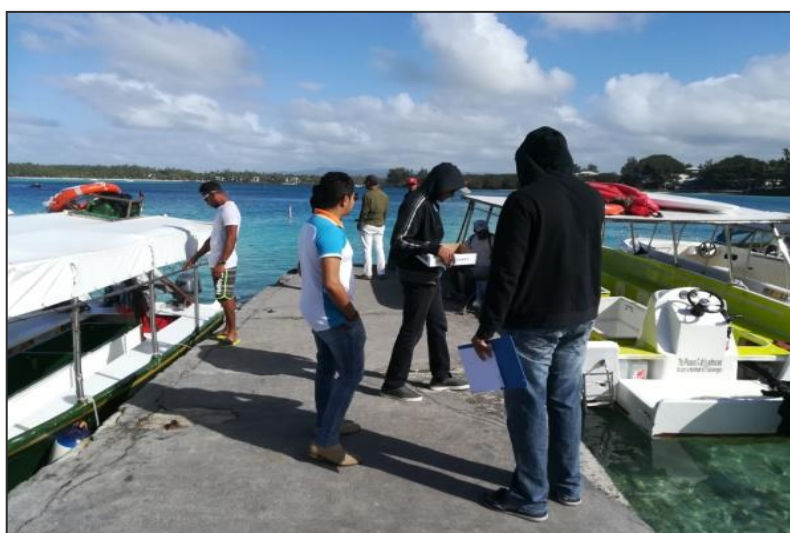
Officer of the Beach Authority guiding visitors to pleasure crafts for embarkation to Blue Bay Marine Park