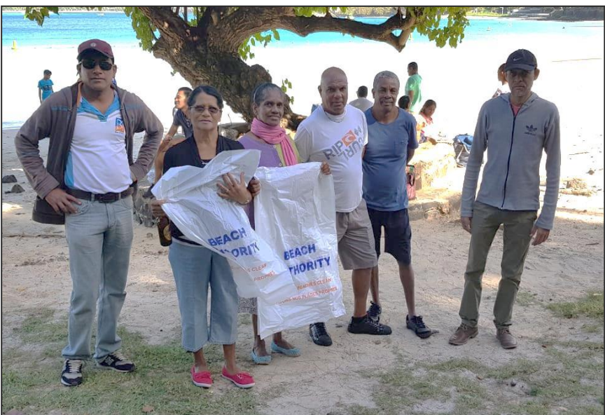
Distribution of plastic bin bags to beach users