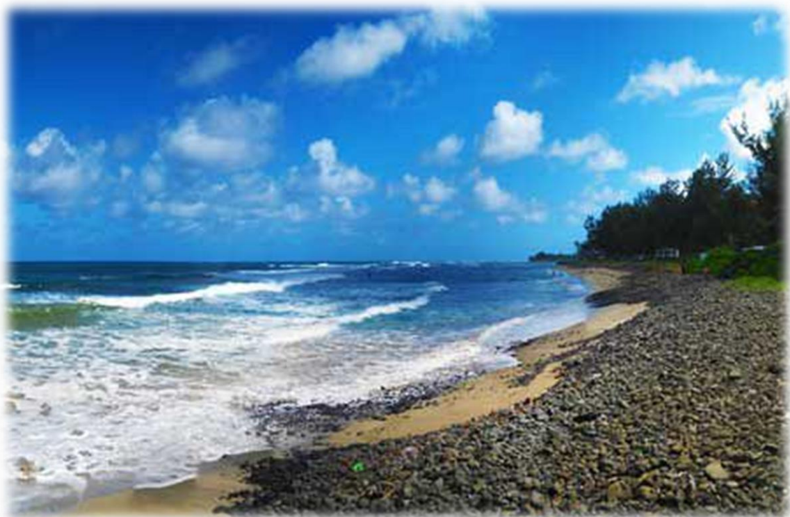
Rivière des Galets public beach