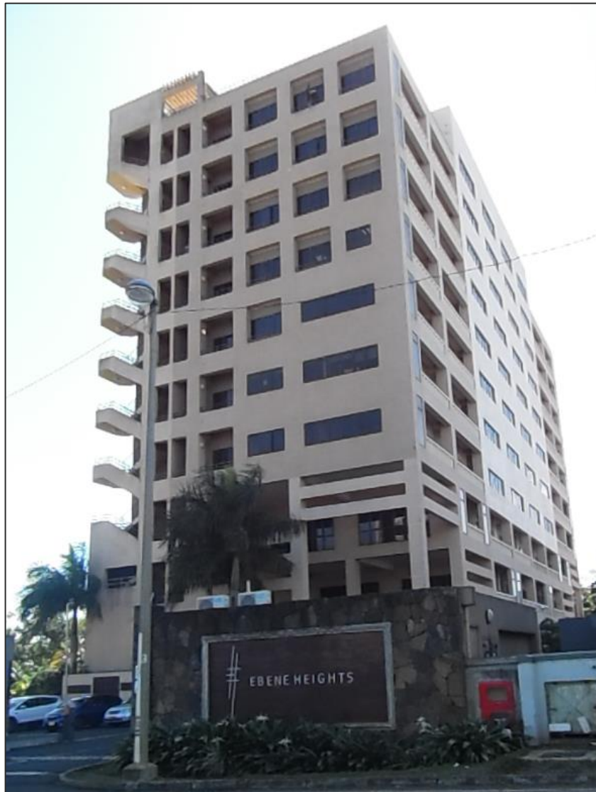
Ebène Heights Building, Ebène

Email Address : beachauthority@intnet.mu