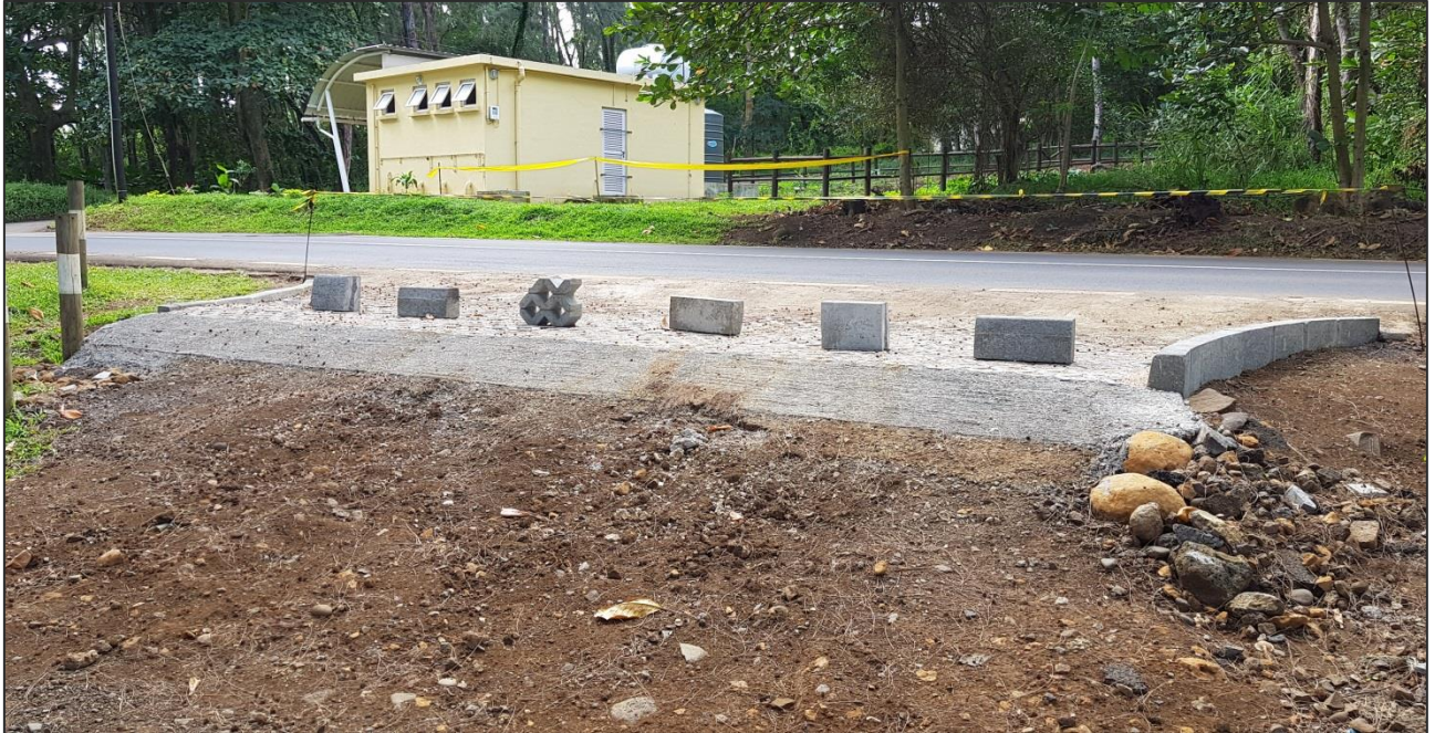
Upgrading of access at Rivière des Galets public beach (Works in progress)

The Authority has embarked on a project to upgrade access on public beaches. After Mont Choisy and Le Goulet public beaches, the access at Rivière des Galets public beach is being upgraded to facilitate movements of beach users. The works are expected to be completed by early July, 2019 .