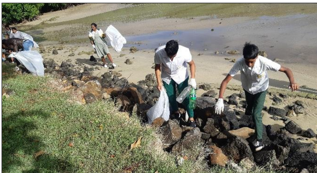
Cleaning of shoreline at Von Moltke public beach by students of Universal College

About forty seven (47) bags of wastes, comprising mainly of plastic bottles and bags as well as left overs were collected and carted away.