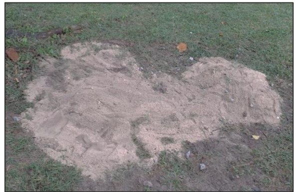
Baie du Cap public beach (After)