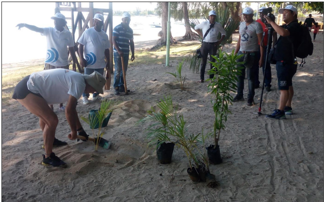
Planting of endemic tree by Hon. A. Aliphon Parliament Private Secretary (PPS) responsible for constituency number 14 in the presence of Hon. A. K. Gayan, Minister of Tourism, other stakeholders and members of the press