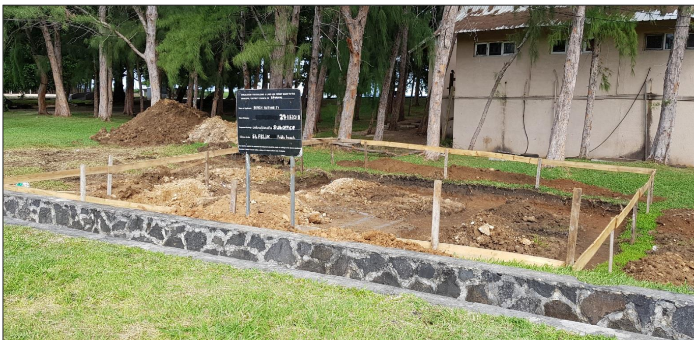
Construction of new sub office at Saint Felix public beach (Strip footing works ongoing)

In quest for excellence and with a view to cope with the continuous changing environment, to enhance the quality of our beaches as well as to ensure a good service delivery, three sub offices have already been set up in the three geographical zones around the island namely Pereybère (North), Belle Mare (East) and Flic en Flac (West) public beaches and are fully operational. A fourth sub office is presently under construction at Saint Felix (South) public beach and works are expected to be completed by August, 2019 .