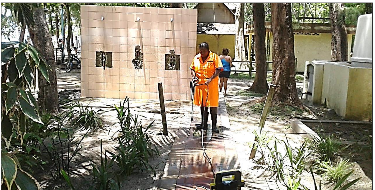
Pressure cleaning around the open shower at Mont Choisy public beach