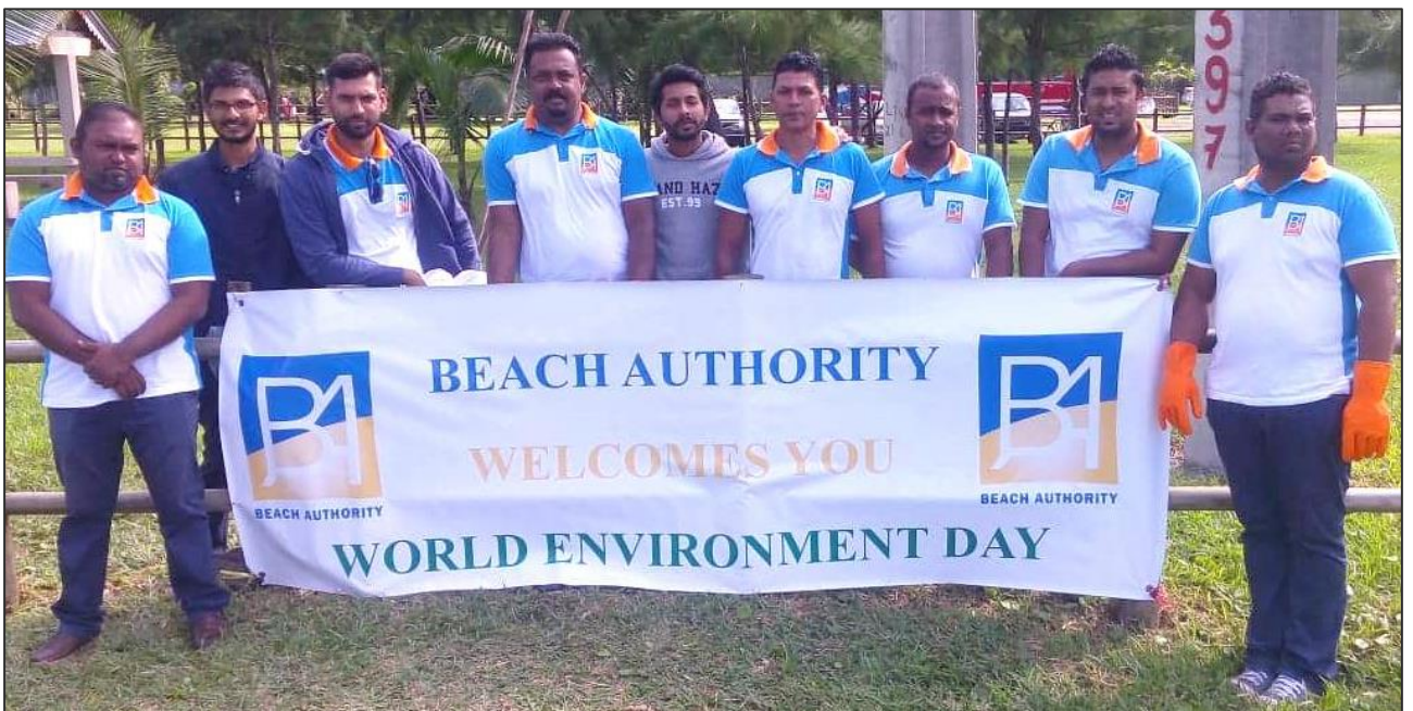
Beach Authority banner placed at La Prairie public beach in the context of World Environmental Day 2019