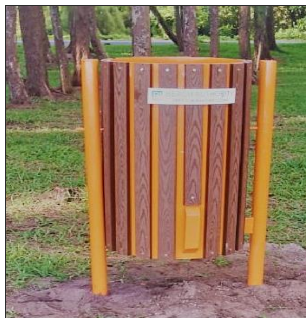
Mini-kiosk and litter bin at Pomponette public beach