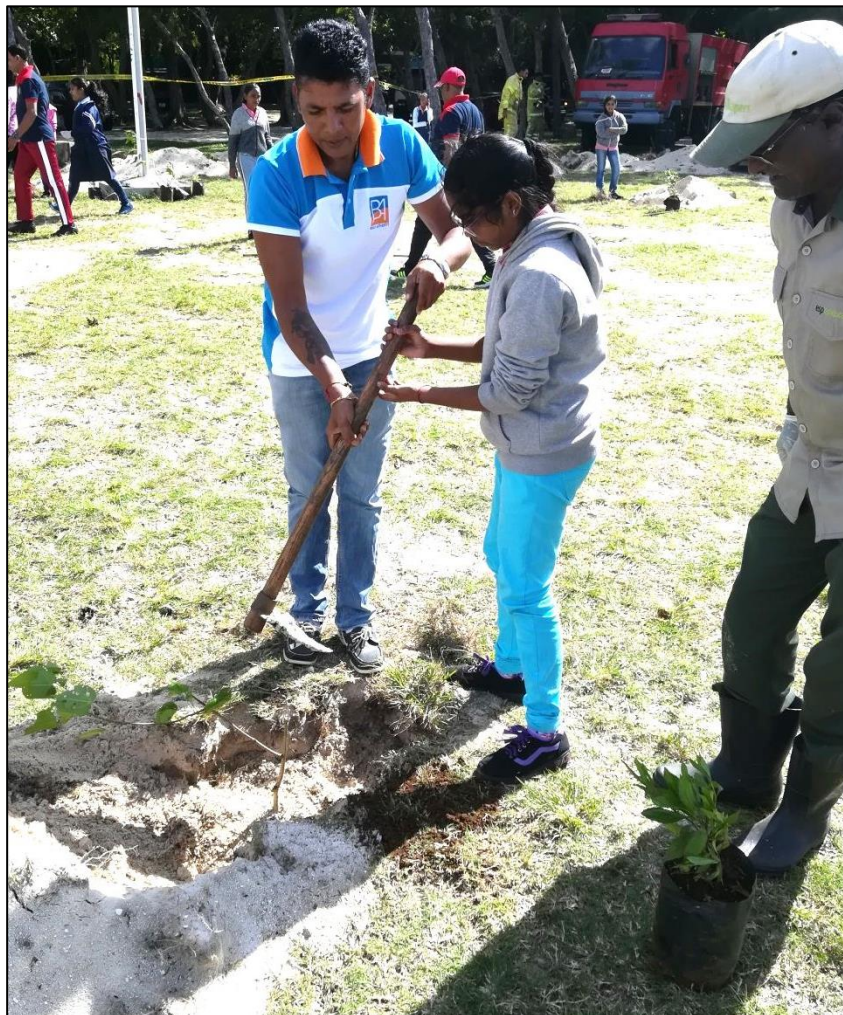
Tree plantation by Officers of the Beach Authority and primary school students at Bras d'Eau public beach