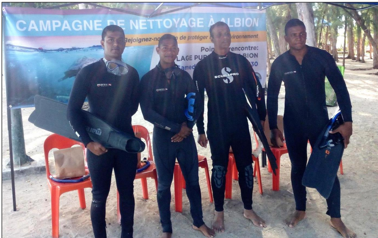
Divers of National Coast Guard, Scuba Diving Association & Mauritius Fire and Rescue Service mobilised for cleaning of lagoon at Albion public beach