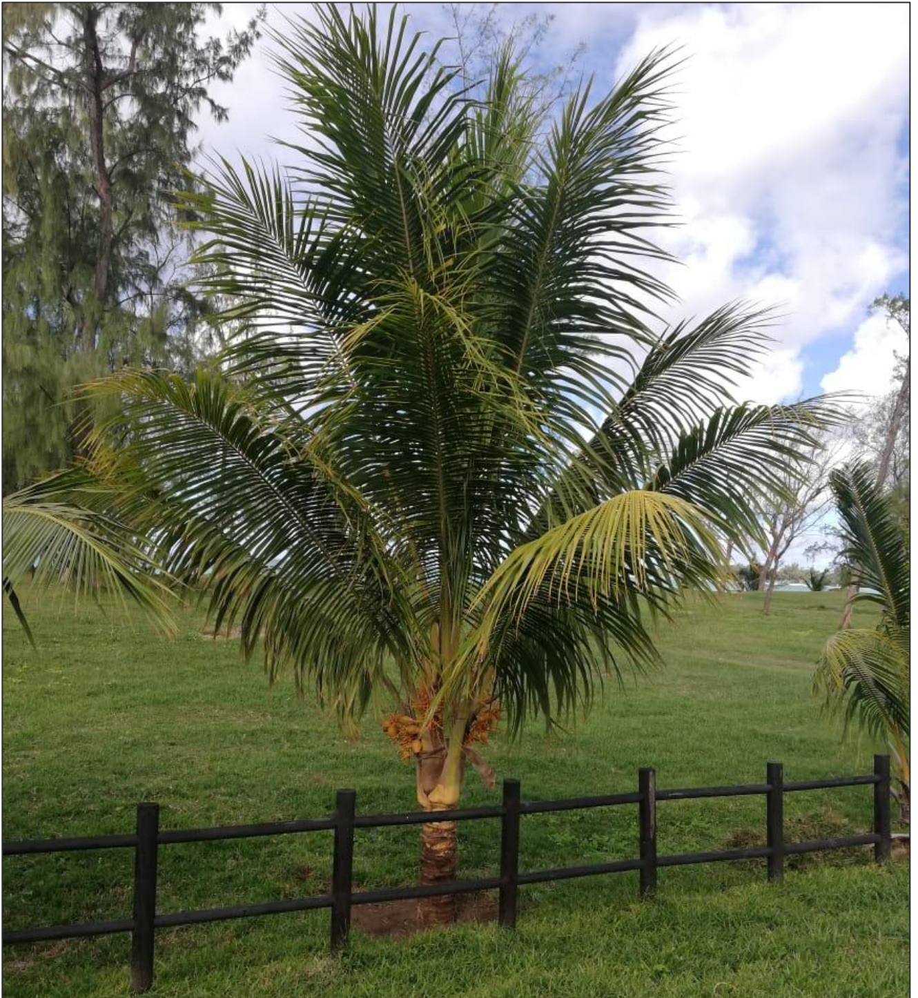
Coconut tree planted in 2015 at Belle Mare Public Beach has started to blossom.