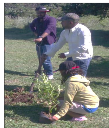
Planting of endemic trees at Le Bouchon public beach by members of Mahebourg Espoir Education Centre