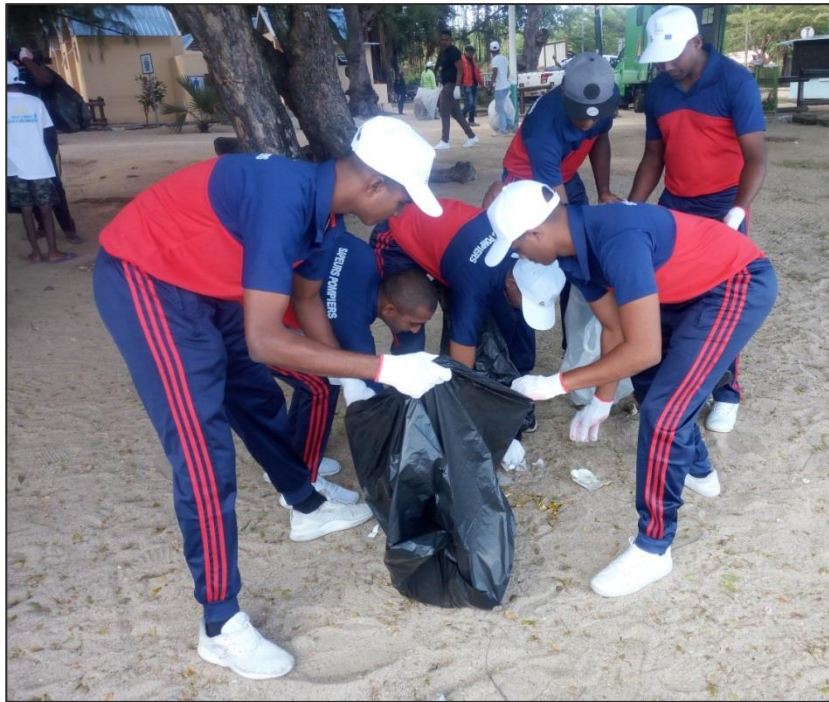
Cleaning of shoreline at Albion public beach by Personnel of Mauritius Fire & Rescue Service