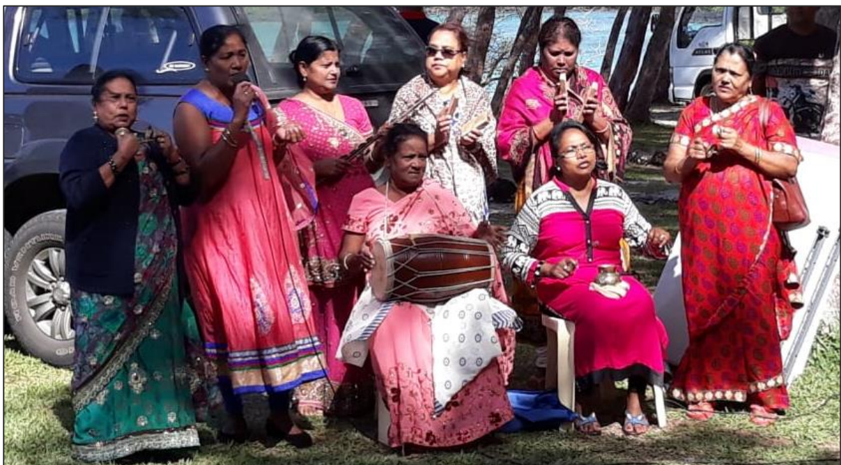
Musical performance by members of Poste de Flacq Elderly Group at Bras d'Eau public beach