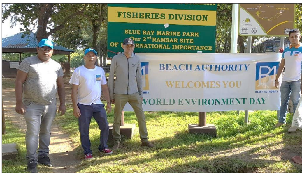
Beach Authority banner placed at Blue Bay public beach in the context of celebration of World Environment Day 2019

Sensitisation campaign was also carried out by the Beach Authority at Blue Bay public beach with a view to create awareness about the pleasure and benefits the public can derive from an unpolluted and pristine beach environment. Plastic bin bags and flyers were distributed to beach users.