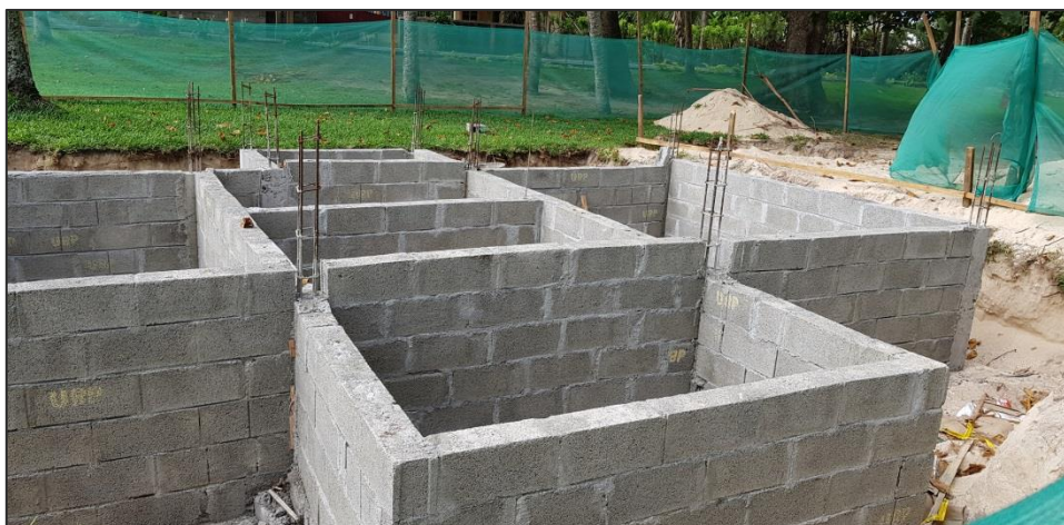
Foundation works for construction of new toilet blocks at Riambel public beach (Works in progress)