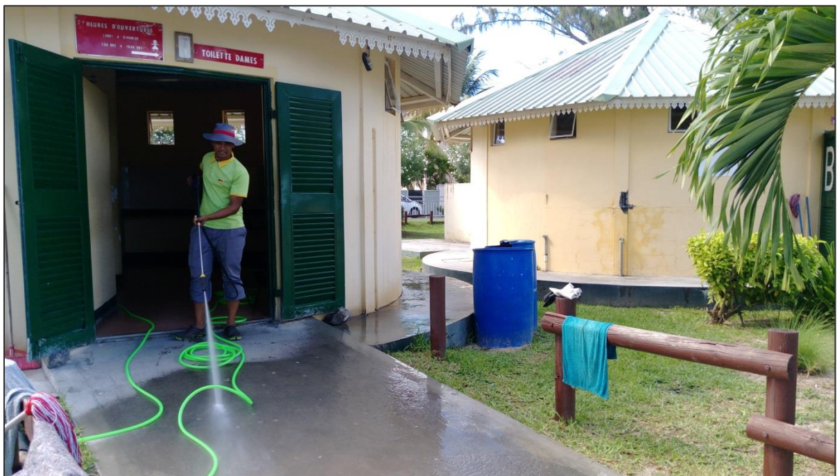
Pressure cleaning at Flic en Flac public beach