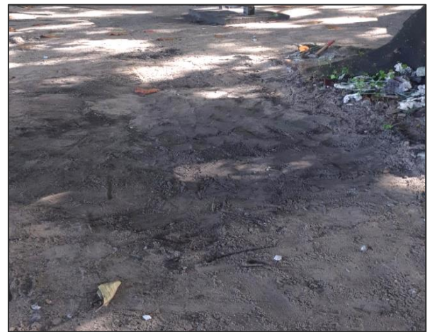
Saint Felix public beach (After)