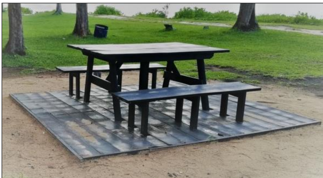
Picnic table (with recycle plastics) at Pomponette public beach

The Beach Authority has embarked on a programme to seek the assistance of stakeholders to embellish public beaches. In this context, Laurelton Diamonds Ltd, through its Corporate Social Responsibility (CSR) scheme, has contributed in the embellishment of the environment of Mauritius by supporting the Beach Authority in upgrading the Pomponette public beach with basic amenities. The installation of four (4) picnic tables, eight (8) litter bins and two (2) mini-kiosks have been completed.