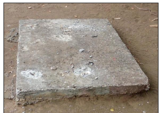
Removal of damaged bench at Sable Noir public beach After