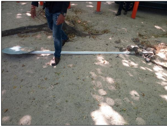
Repair of uprooted panel at Pointe aux Sables public beach Before