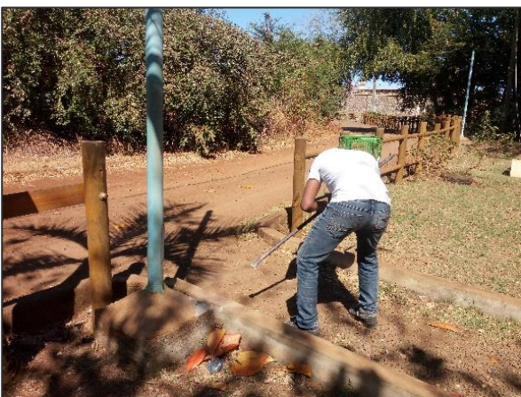
Removal of unused lamp post at Pointe aux Sables public beach Before