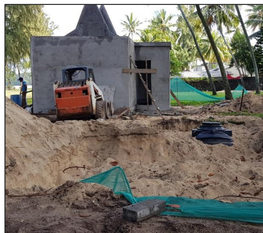
Excavation works for provision of leaching field for toilet block at Riambel public beach (Work in progress)