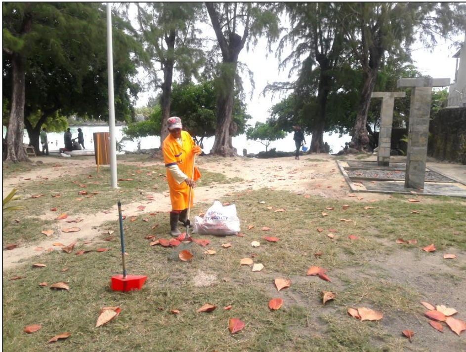
Cleaning of Pereybère public beach