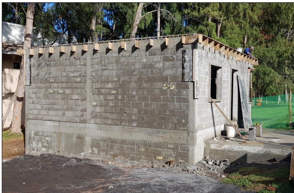
Preparation of formwork for casting of slabs (Work in progress)