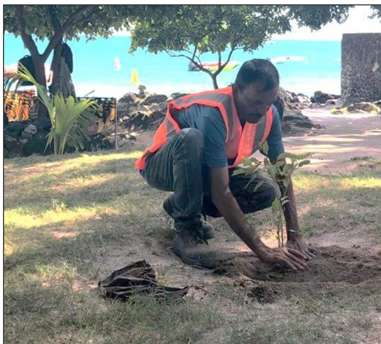
Tree plantation by General Worker of Beach Authority at Pereybère public beach