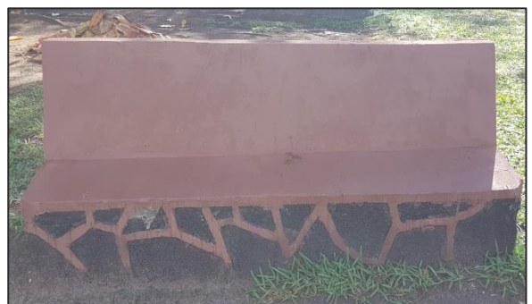
Painting of concrete bench After