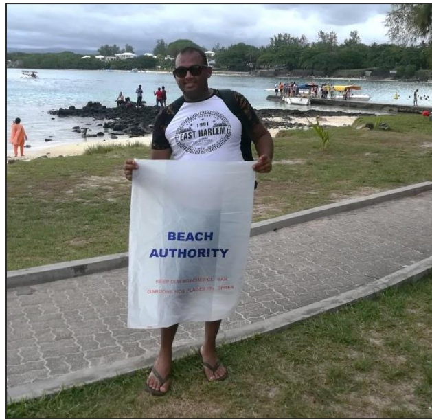
Distribution of plastic bin bags to beach users at Blue Bay public beach