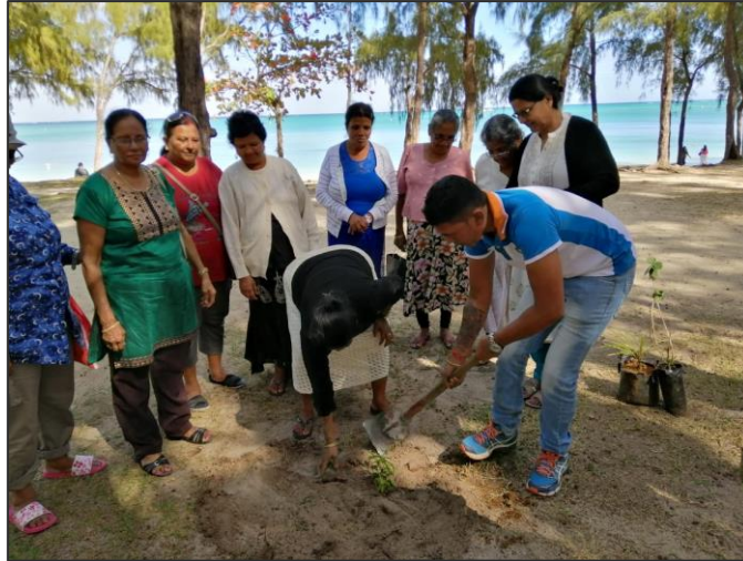
Tree plantation at Mont Choisy public beach