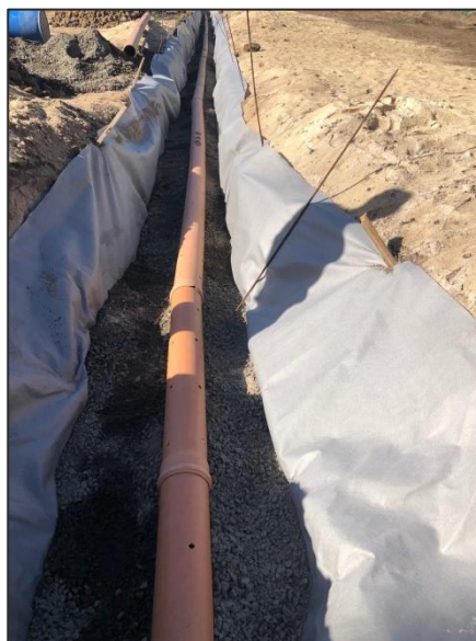
Provision of french drains for new parking area at Palmar public beach (Work in progress)

After the completion of parking area at Wolmar public beach in July, 2019, another parking project is ongoing at Palmar public beach since June, 2019. The work is expected to be completed by end of September, 2019 .