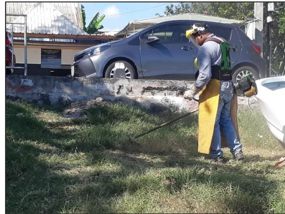
Mowing of grass at Grand Baie public beach (near NCG)