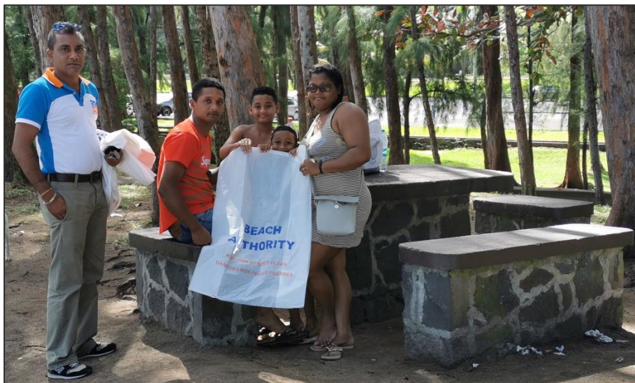
Distribution of plastic bin bags to beach users at Saint Felix public beach