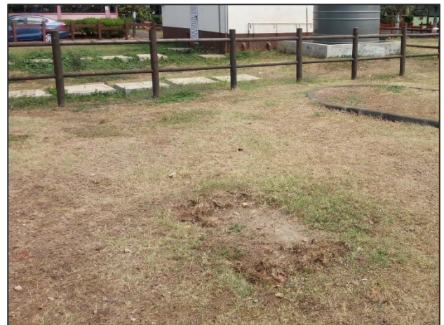
Removal of damaged bench at Pointe aux Sables public beach (near Fisheries Training Centre) After