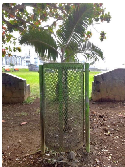
Painting of bin Before