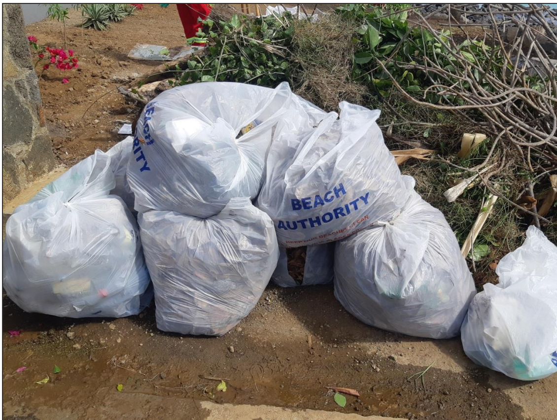
Waste collected at Grand Baie public beach (Lot 3)