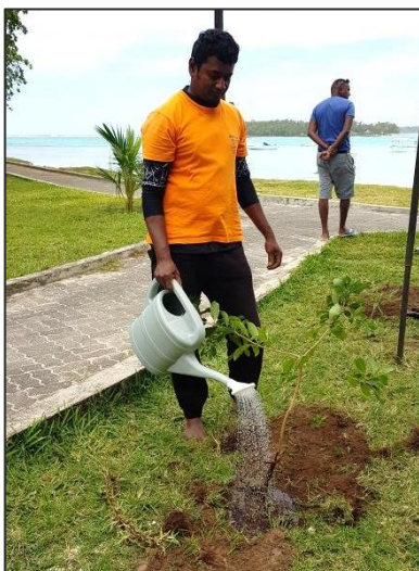
Tree plantation by beach users at Blue Bay public beach