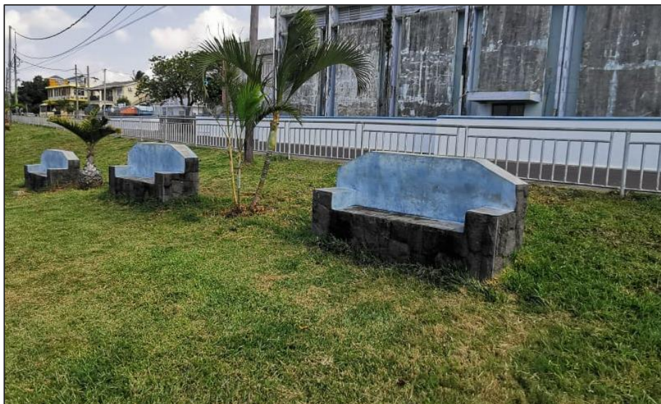
Painting of concrete benches - before