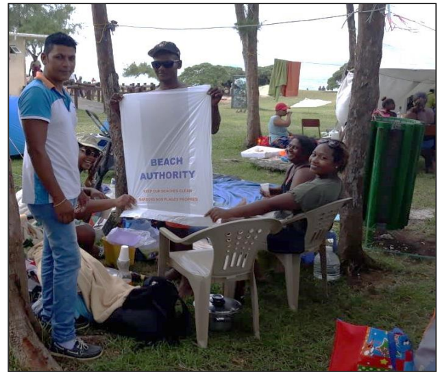
Distribution of plastic bin bags to beach users at La Cambuse public beach