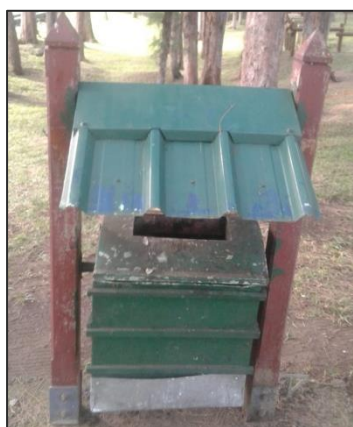
Saint Felix public beach Before