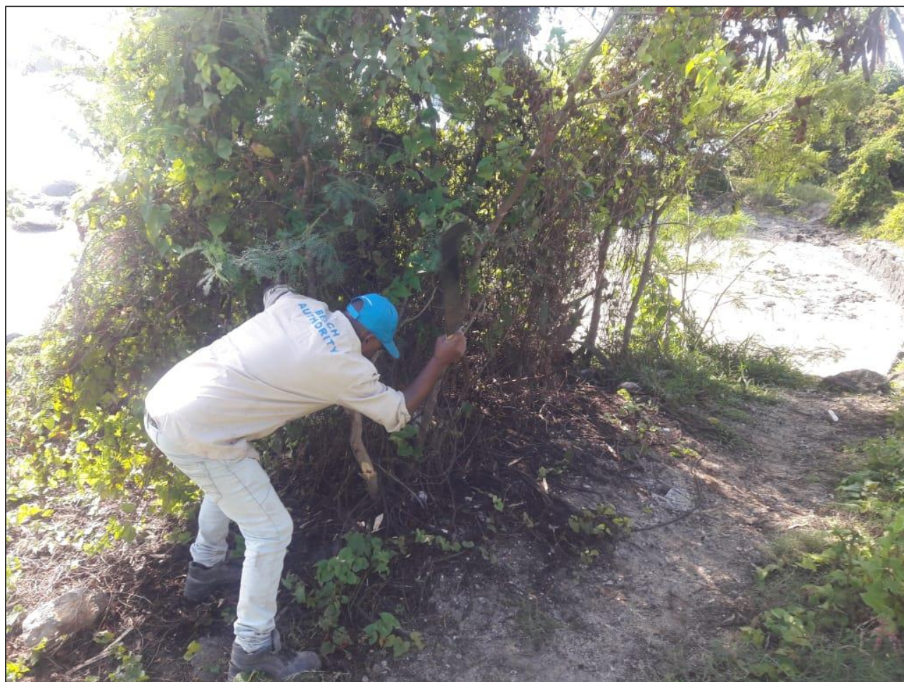
Clearing of grass and bushes at Grand Baie public beach (Lot 3) by personnel of the Beach Authority Work in progress