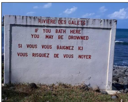
Rivière des Galets public beach Before