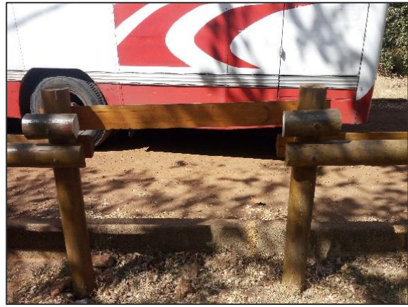
Reinstatement of damaged wooden parapet at Pointe aux Sables public beach After