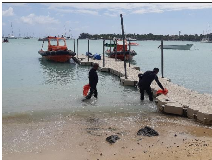
Cleaning of lagoon by Divers from National Coast Guard at Grand Baie public beach (near NCG)