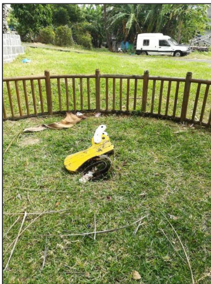
Removal of damaged equipment in children's playground at Petit Sable public beach - before