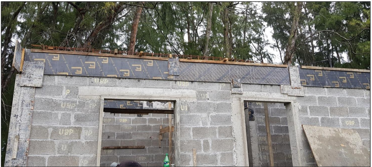
Casting of beam - (Work completed)

In quest for excellence and with a view to cope with the continuous changing environment, to enhance the quality of our beaches as well as to ensure a good service delivery, three sub offices have already been set up in the three geographical zones around the island namely Pereybère (North), Belle Mare (East) and Flic en Flac (West) public beaches and are now fully operational. A fourth sub office is presently under construction at Saint Felix (South) public beach as from June, 2019 and works are expected to be completed by end of September, 2019 .