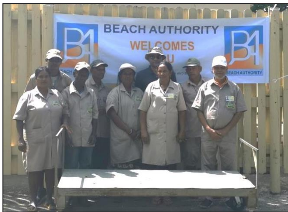
Personnel of Mauriclean mobilised for cleaning of Blue Bay public beach