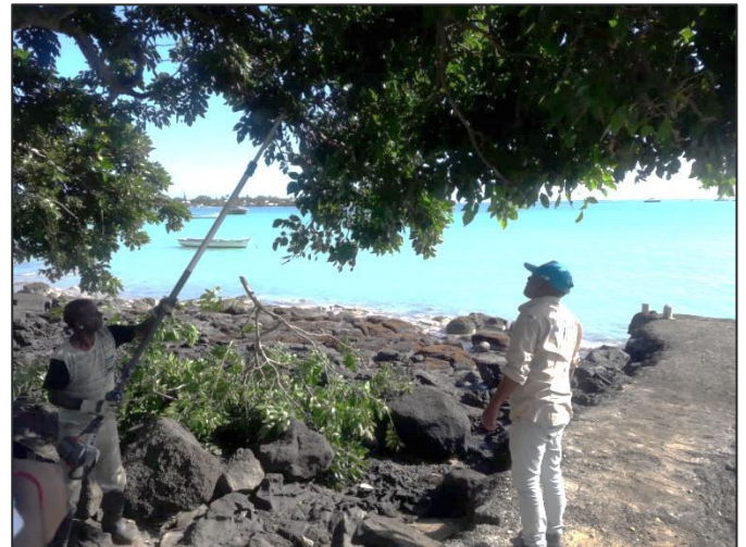
Pruning of branches at Grand Baie public beach (Lot 3) Work in progress