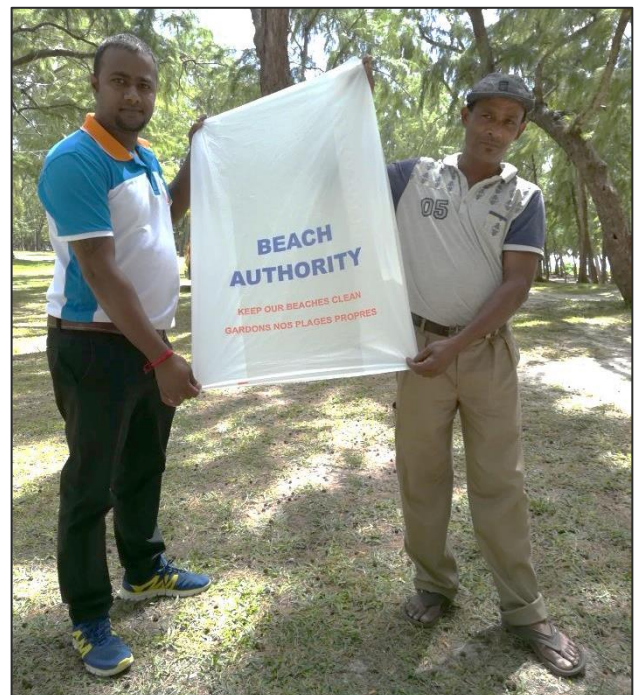
Distribution of plastic bin bags to beach users at Belle Mare public beach