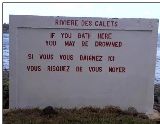
Rivière des Galets public beach After