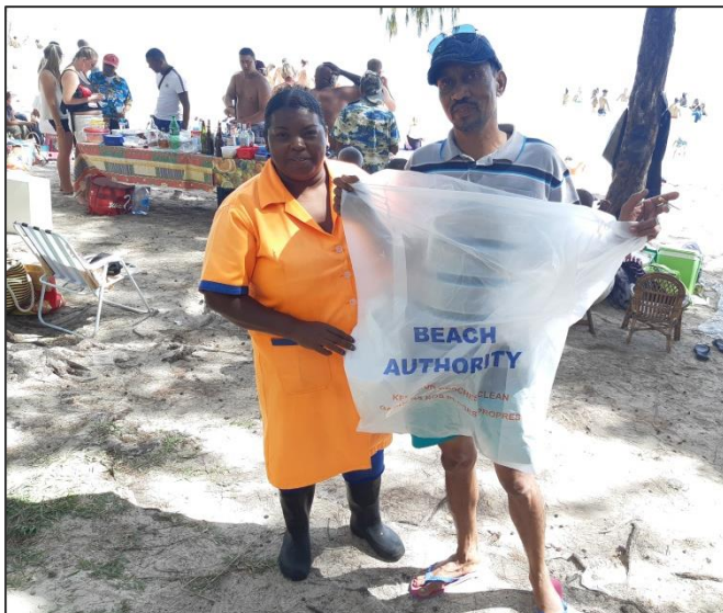
Distribution of plastic bin bags to beach users at Mont Choisy public beach