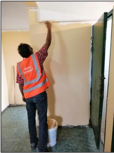
Painting of toilet block at Mont Choisy public beach