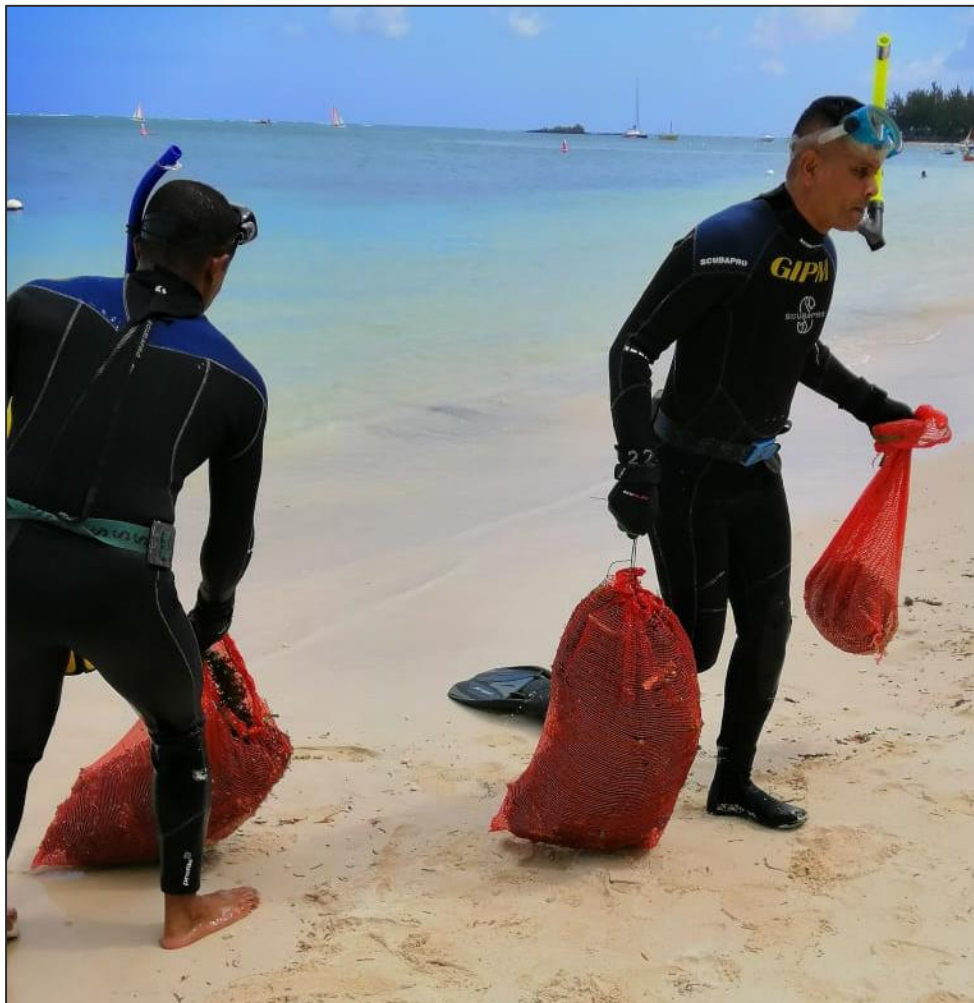
Cleaning of lagoon at Mont Choisy public beach by Divers from Groupe d'Intervention de la Police Mauricienne