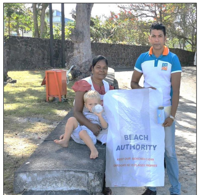
Distribution of plastic bin bags to beach users at Blue Bay public beach