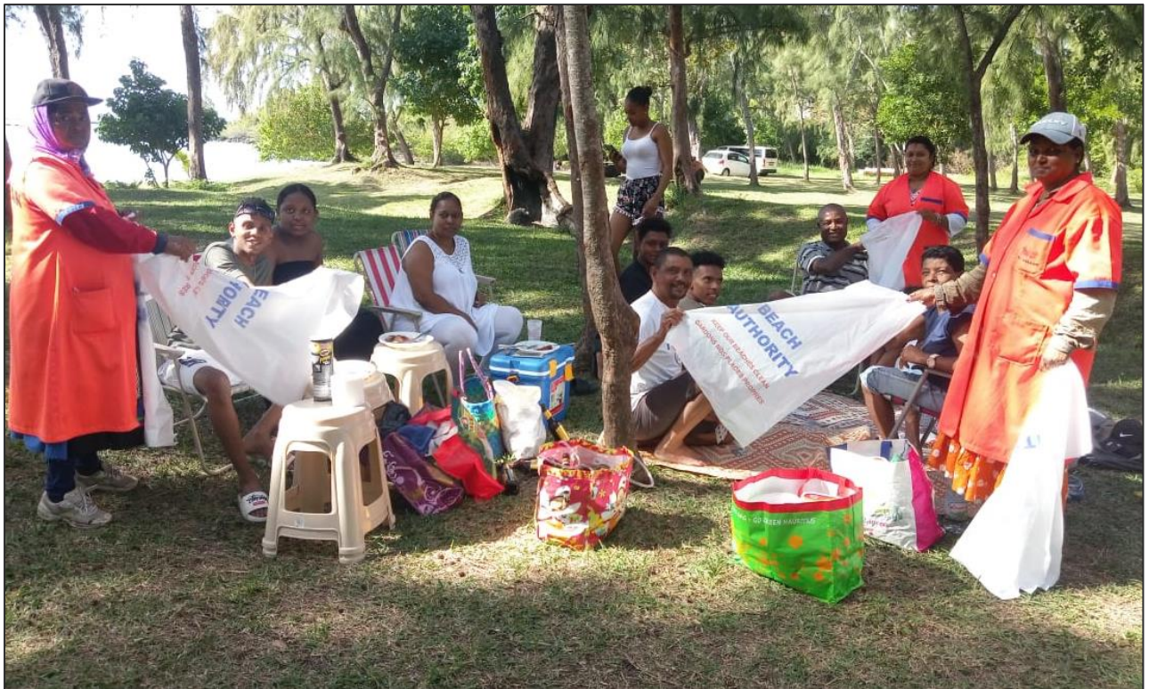
Distribution of plastic bin bags to beach users at P. G. Union Ribet public beach