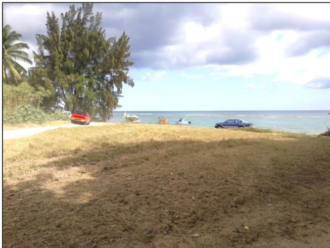
Mowing of grass (Before)