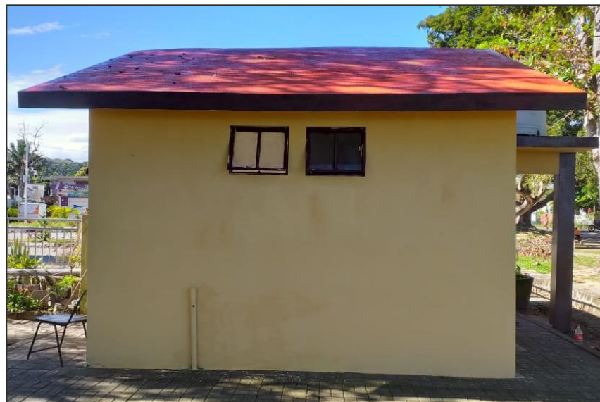
Painting of toilet block After