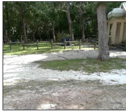
Removal of concrete panel at Bras d'Eau public beach - after