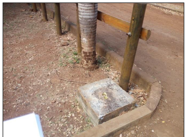
Removal of unused lamp post at Pointe aux Sables public beach After