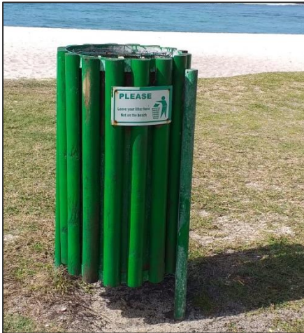
La Cambuse public beach Before