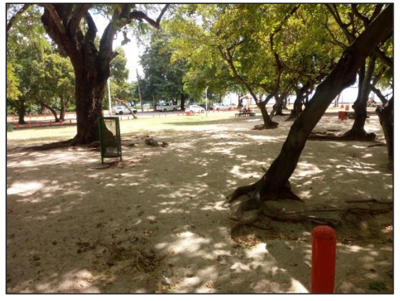
Repair of uprooted panel at Pointe aux Sables public beach After