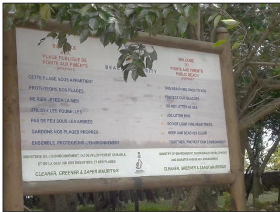
Pruning of branches (Before)