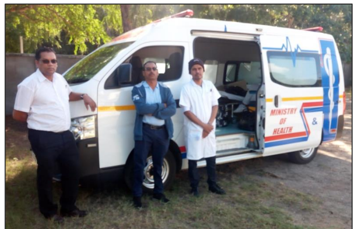
Representatives of Ministry of Health and Quality of Life – provision of ambulance at Albion public beach