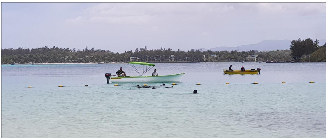
Cleaning of lagoon by Divers National Coast Guard and Special Mobile Force at Blue Bay public beach