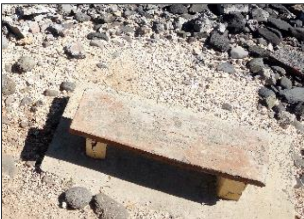
Removal of damaged bench at Pointe aux Sables public beach Before