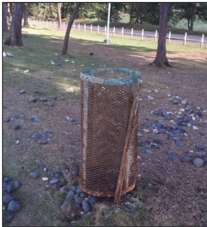
Rivière des Galets public beach Before