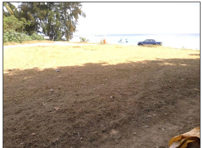
Mowing of grass (After)