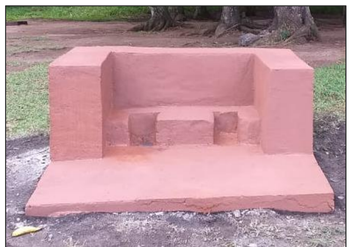
Painting of concrete fire place After