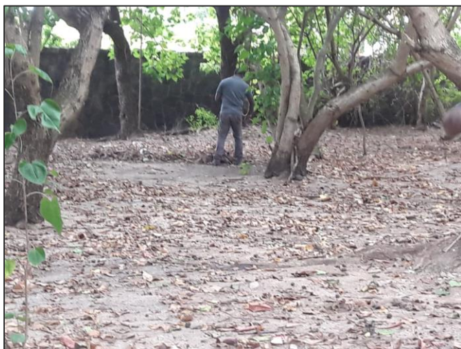
Cleaning of public beach (Before)