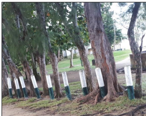
Painting of bollards Before