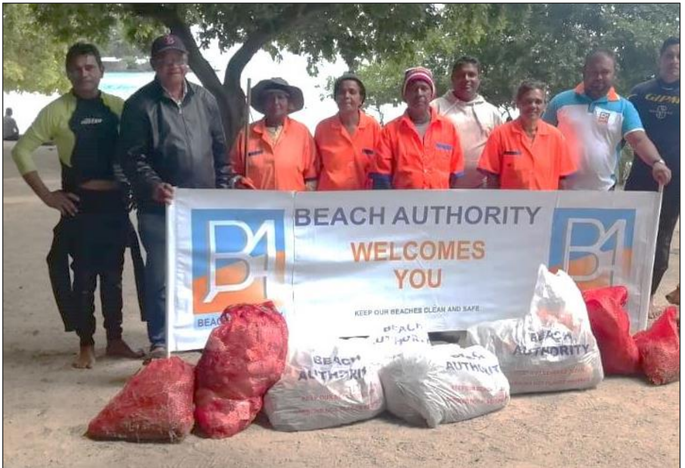
Waste collected at Pereybère public beach together with stakeholders