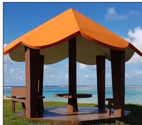
Painting of concrete kiosk After