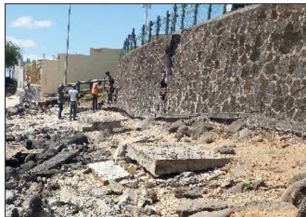
Removal of damaged bench at Pointe aux Sables public beach After