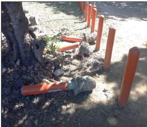
Repair of damaged bollards at Pointe aux Sables public beach Before