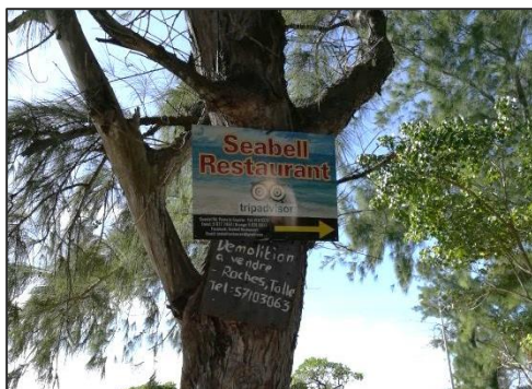
Removal of illegal advertising panel at Roches Noires public beach - before