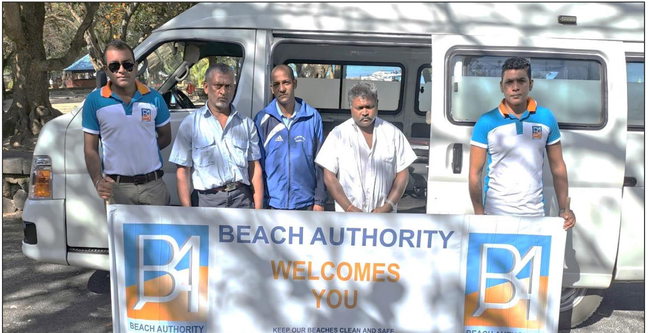
Representatives of Ministry of Health and Quality of Life – provision of ambulance together with staff of the Beach Authority at Blue Bay public beach