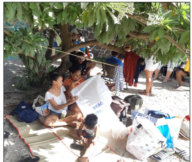
Distribution of plastic bin bags to beach users at Pereybère public beach

For a cleaner, greener and safer public beaches