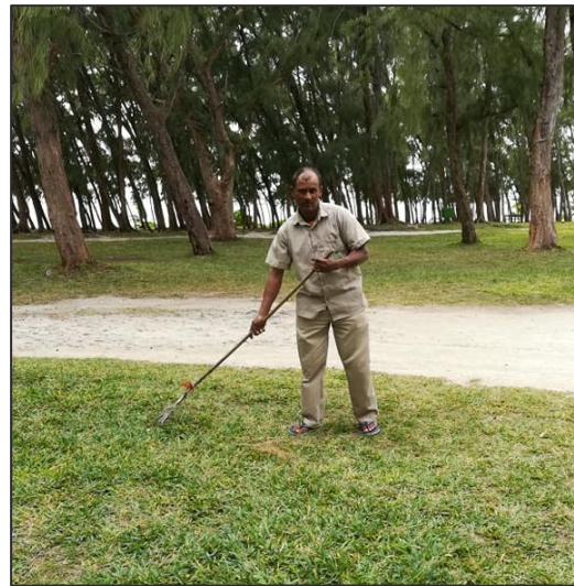
Cleaning of Belle Mare public beach by Personnel of Mauriclean