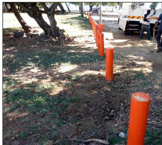
Repair of damaged bollards at Pointe aux Sables public beach After