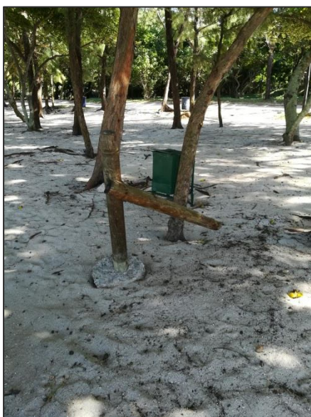
Removal of broken wooden parapet at Bras d'Eau public beach - before