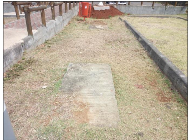
Removal of damaged bench at Pointe aux Sables public beach (near Martello Tower) After