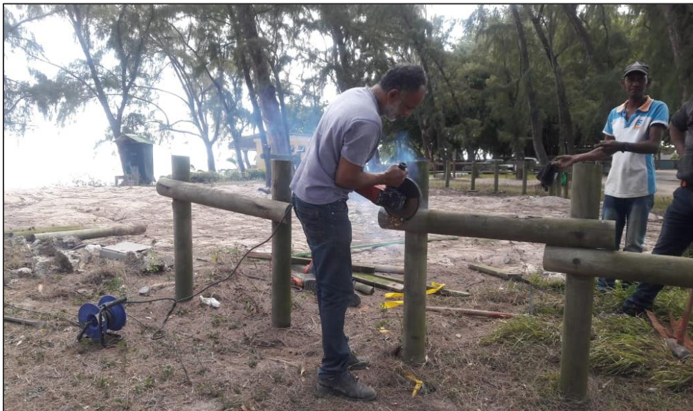
Work in progress