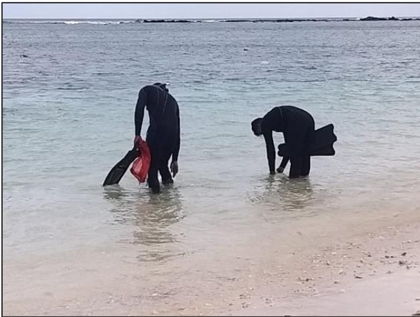
Cleaning of lagoon by Divers of National Coast Guard