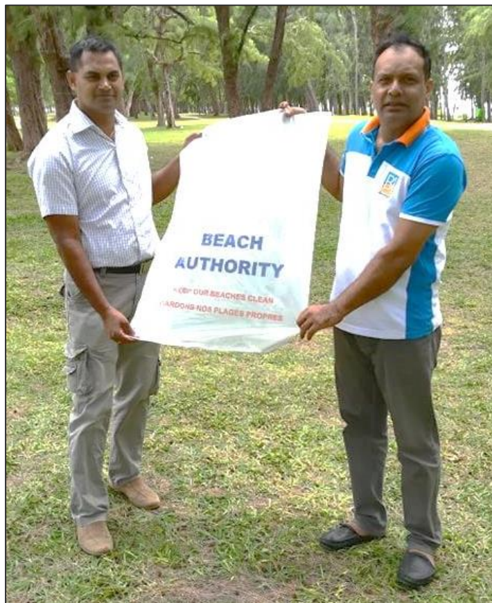
Distribution of plastic bin bags to beach user at Belle Mare public beach