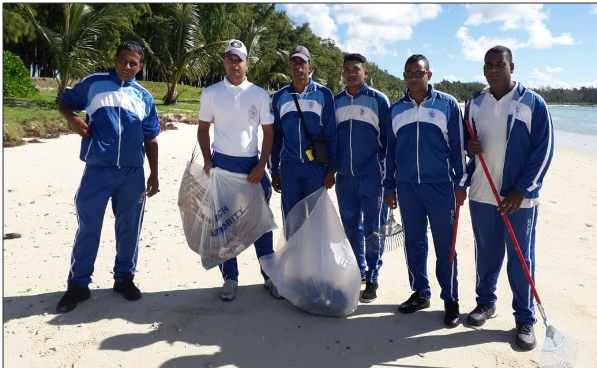
Cleaning of shoreline at Belle Mare public beach by personnel of National Coast Guard