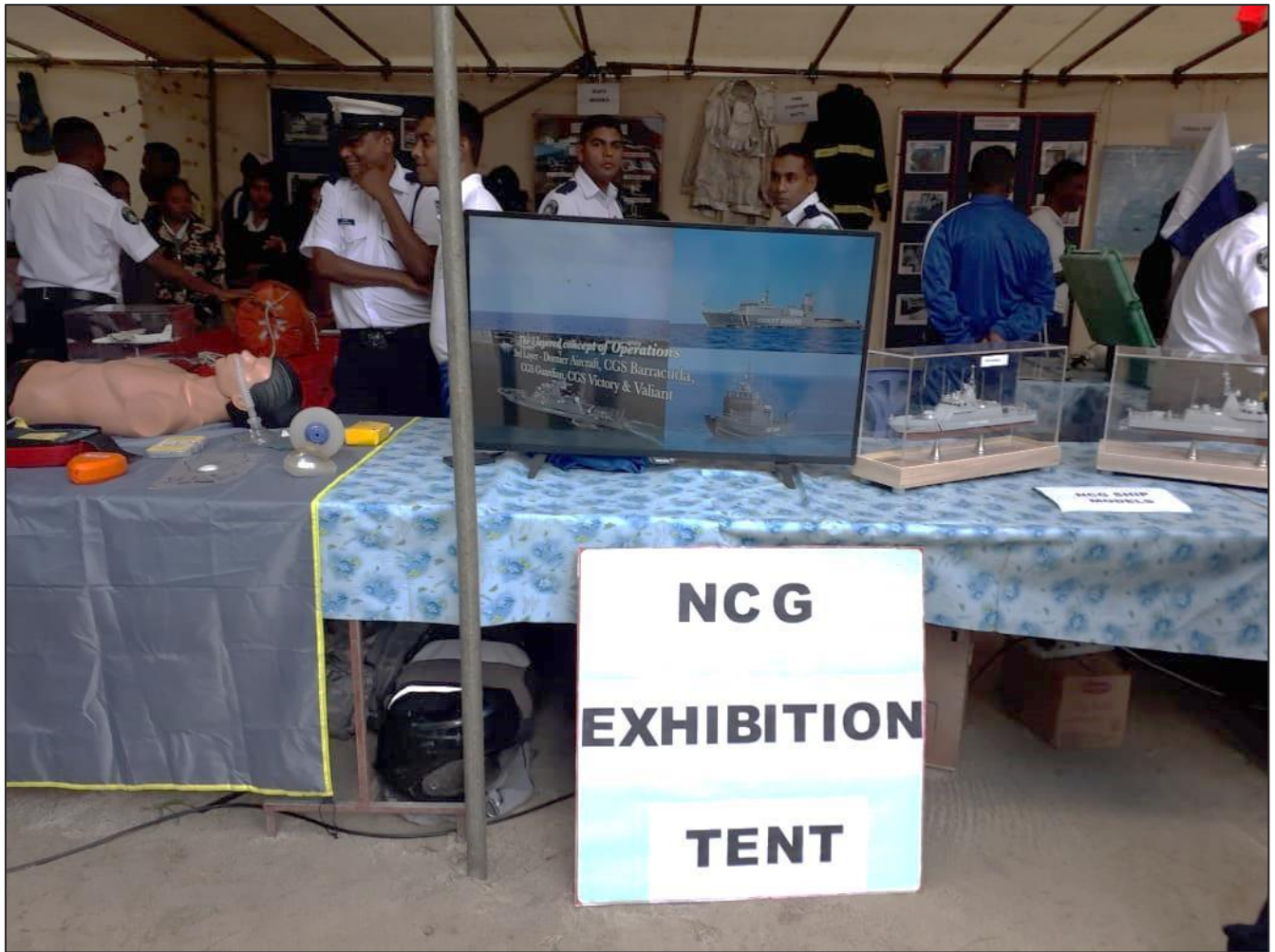
Exhibition by National Coast Guard