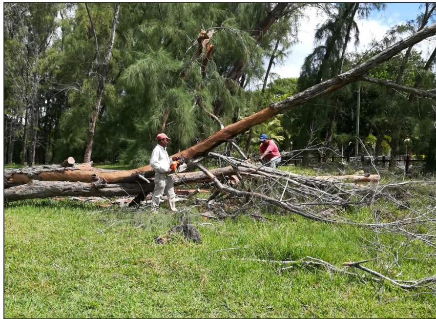
Felling of dry and dangerous trees by personnel of scavenging contractor at Belle Mare public beach

As part of their contractual obligations, it is mandatory for relevant scavenging contractors to also remove all dry and dangerous trees that reasonably represent a danger to public property and safety of beach users. Dry and dangerous trees were felled at Belle Mare public beach in August 2019 by the scavenging contractor with the assistance of personnel of Police Department (Special Mobile Force).