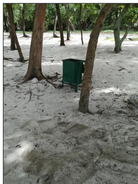
Removal of broken wooden parapet at Bras d'Eau public beach - after