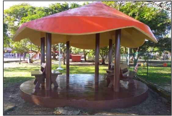
Reinstatement and painting of concrete kiosk - after