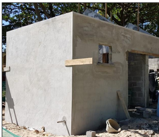
Plastering works for toilet block at Riambel public beach (Work completed)