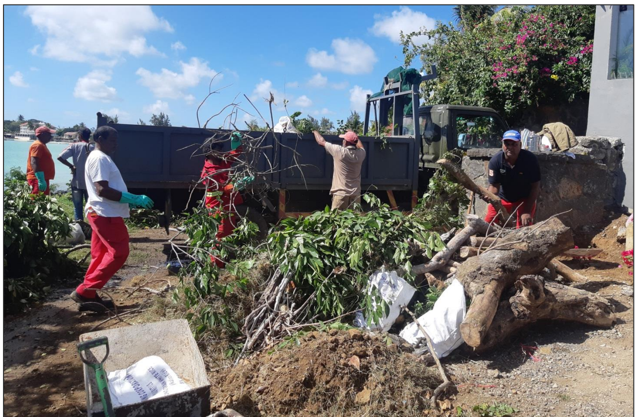
Carting away of wastes at Grand Baie public beach (Lot 3)