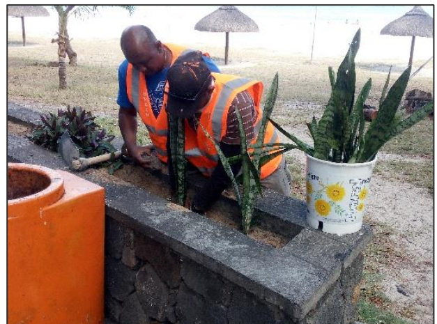
Planting of decorative plants by General Workers of the Beach Authority at Flic en Flac public beach