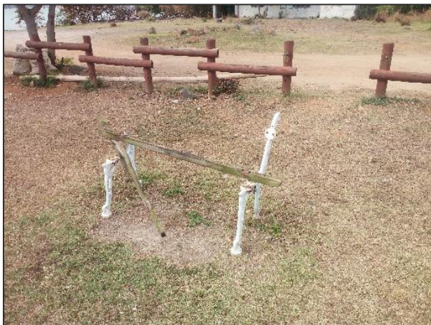
Removal of damaged bench at Pointe aux Sables public beach (near Fisheries Training Centre) Before