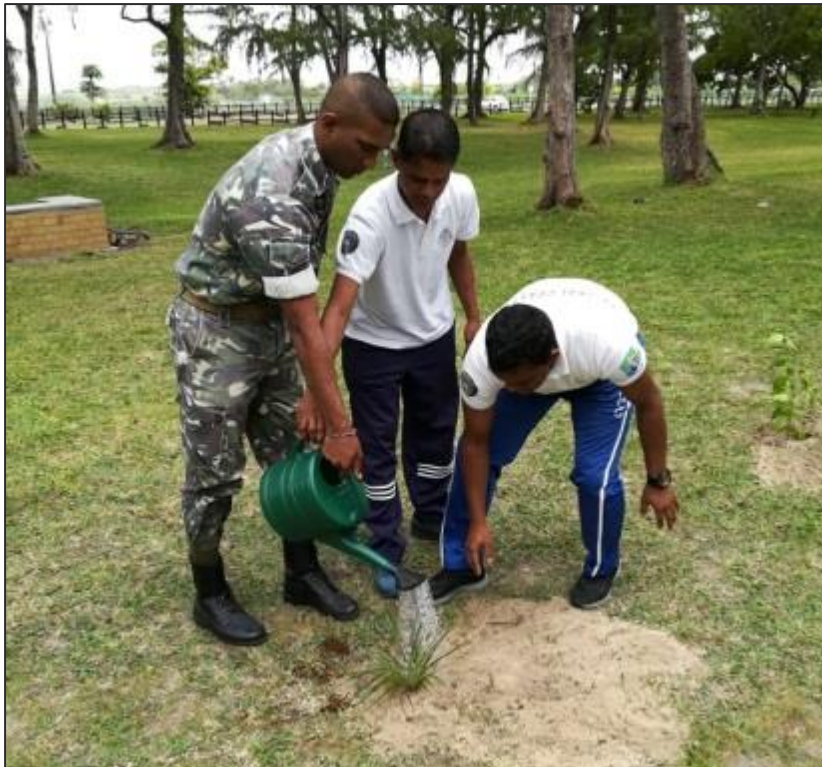
Tree plantation at Belle Mare public beach