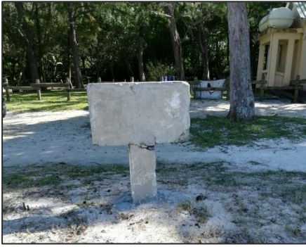
Removal of concrete panel at Bras d'Eau public beach - before