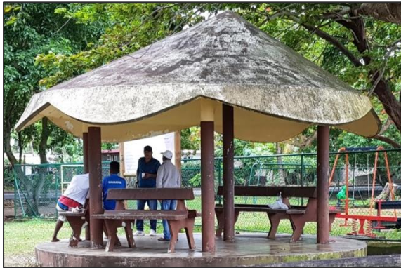
Reinstatement and painting of concrete kiosk - before