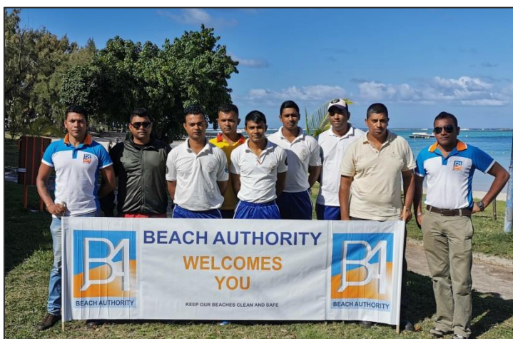
Personnel of Beach Authority and Police Department (Special Mobile Force and National Coast Guard) at Blue Bay public beach