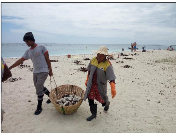
Collection of corals