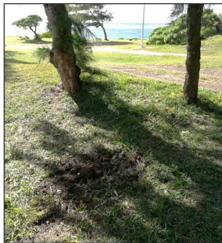
Removal of metal support for bin at Poste Lafayette public beach After