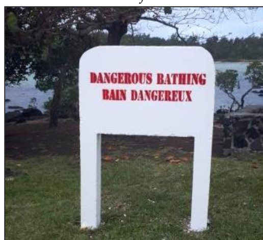
Le Bouchon public beach After