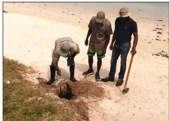
Burying of stumps by personnel of Mauriclean at Blue Bay public beach