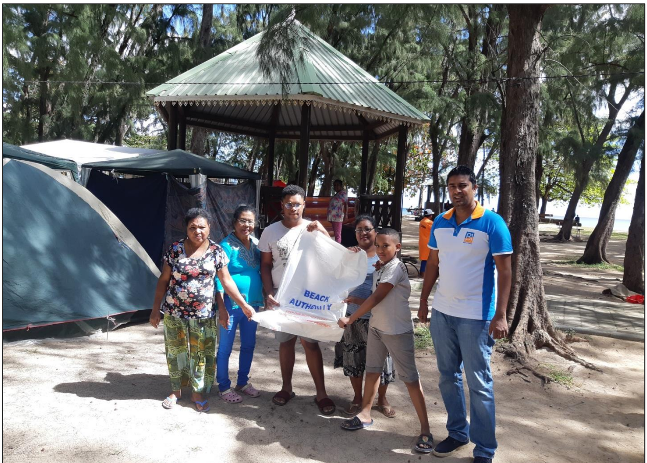
Distribution of plastic bin bags to beach users at Trou aux Biches (near Police Station) public beach