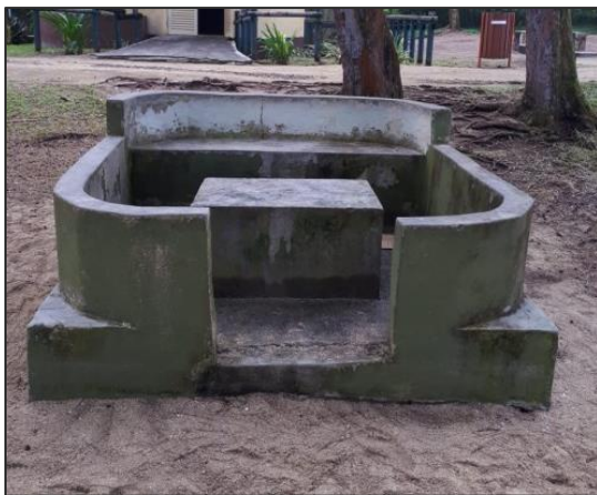
Painting of concrete table and bench Before