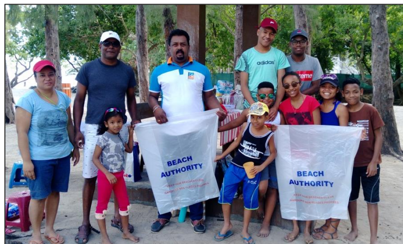
Distribution of plastic bin bags to beach users at Flic en Flac public beach