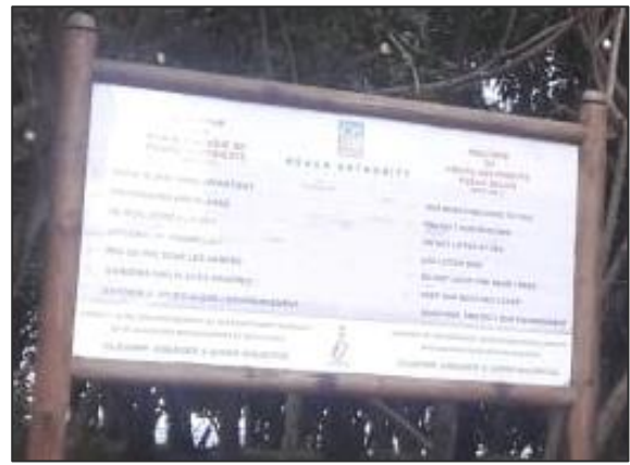
Pruning of branches (After)