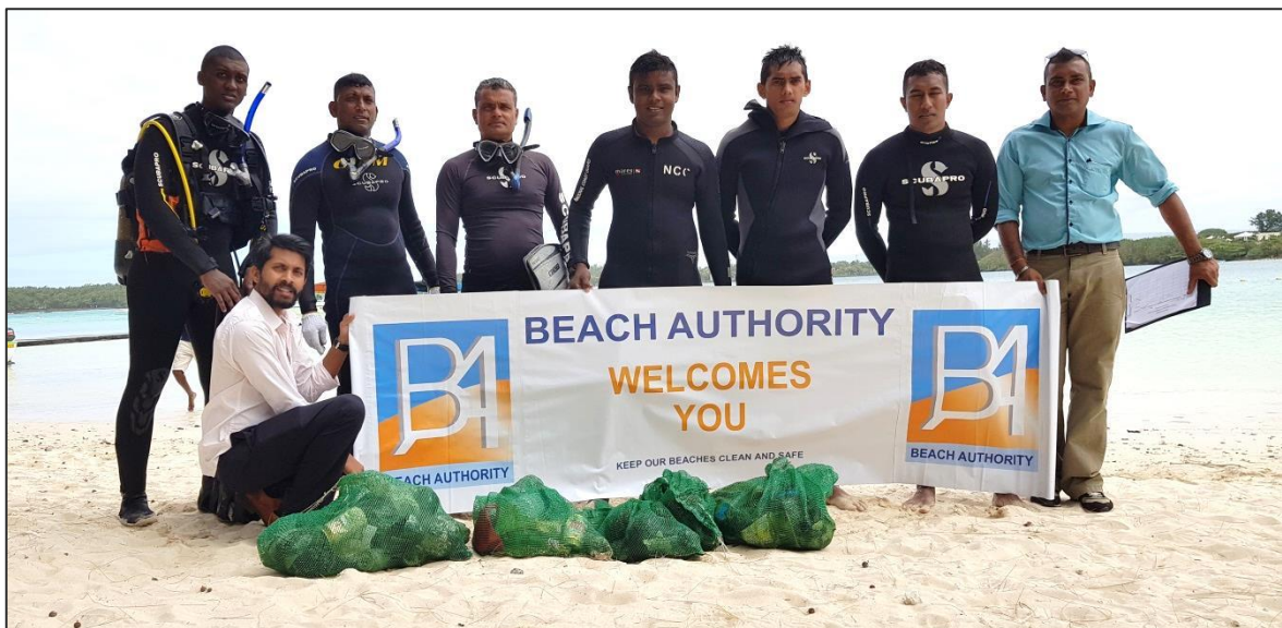
Wastes collected at Blue Bay public beach together with Divers from National Coast Guard and Special Mobile Force and Officers from the Beach Authority