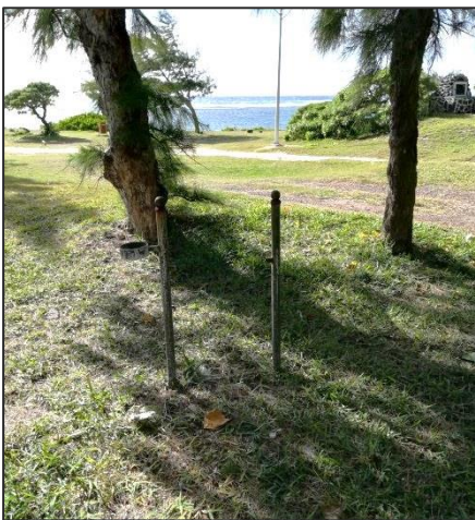
Removal of metal support for bin at Poste Lafayette public beach Before