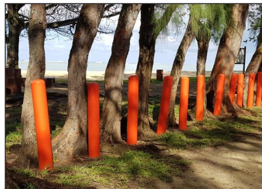
Painting of bollards After