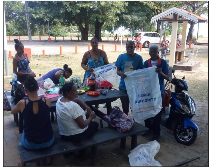
Distribution of plastic bin bags and flyers to beach users at Pointe aux Sables (main) public beach