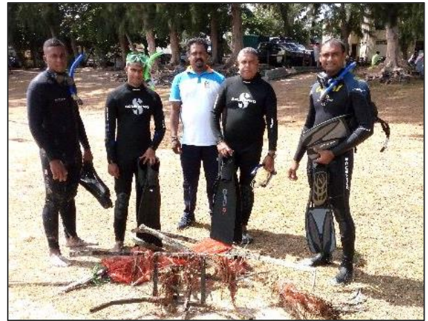
Wastes collected from cleaning of lagoon at Flic en Flac public beach