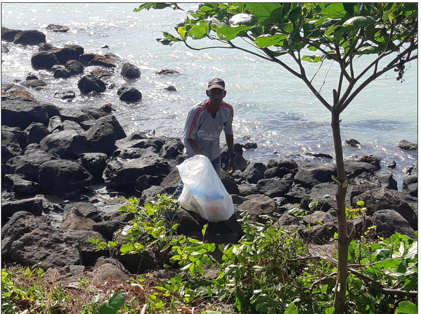
Cleaning of shoreline at Grand Baie public beach (Lot 3)