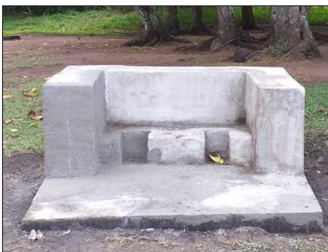
Painting of concrete fire place Before