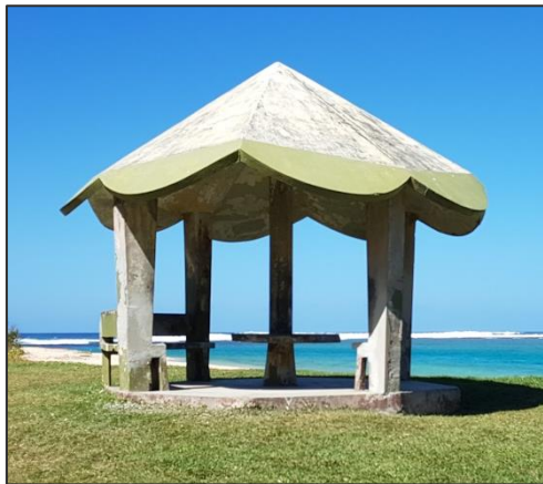
Painting of concrete kiosk Before