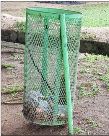
Painting of bins Before