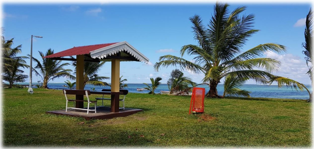
Ruisseau des Créoles public beach

Our main actions aim at upgrading, embellishing, protecting the environment and preventing environmental beach degradation.