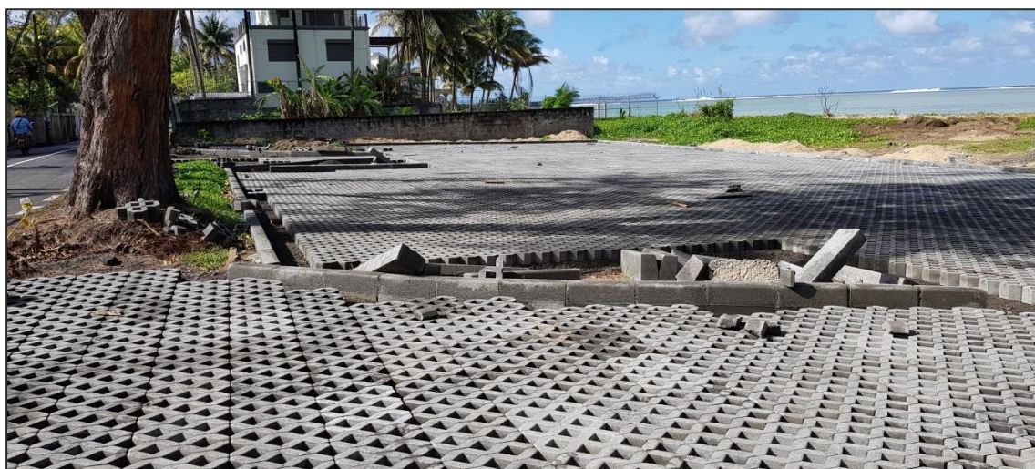
Laying of eco blocks for parking area at Riambel public beach – (work in progress)