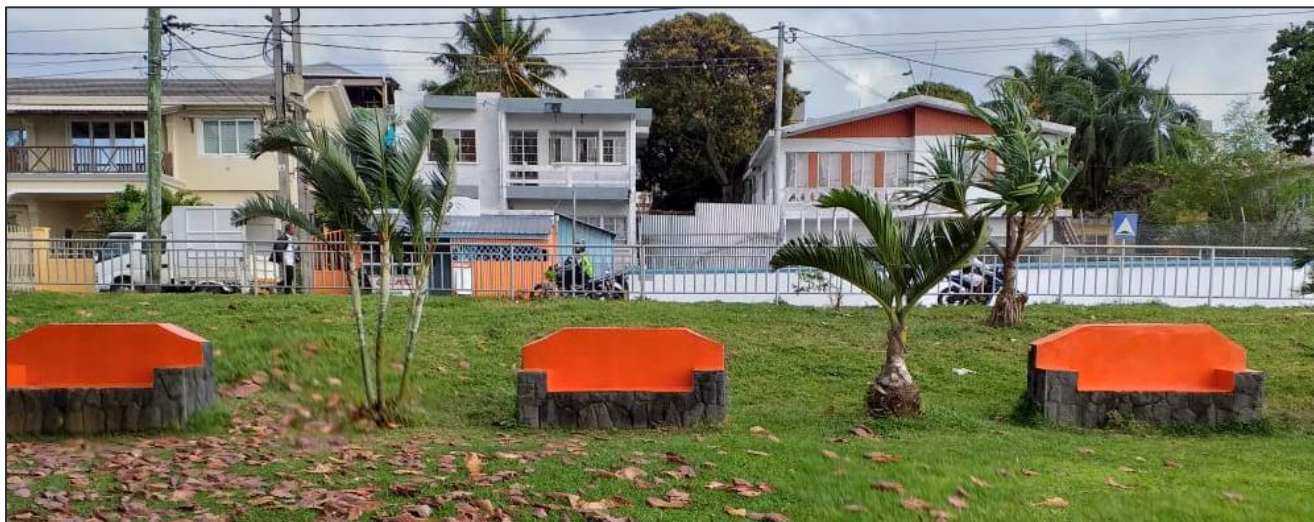
Painting of concrete benches - after