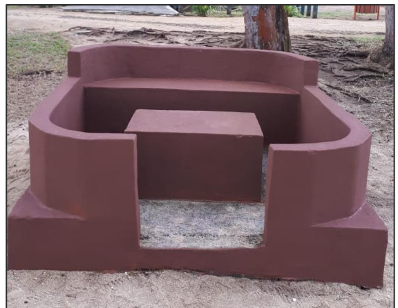
Painting of concrete table and bench After