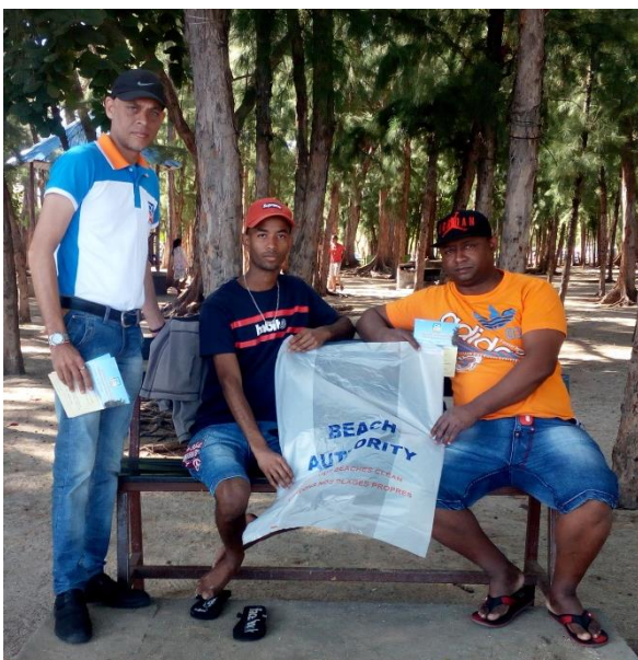
Distribution of plastic bin bags and flyers to beach users at Albion public beach