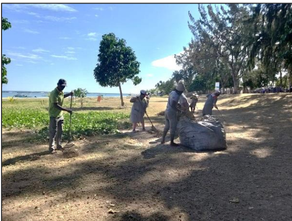
Cleaning of public beach