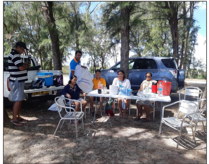
Distribution of plastic bin bags to beach users at Pointe aux Piments (near Oberoi Hotel and near Cemetery) public beaches