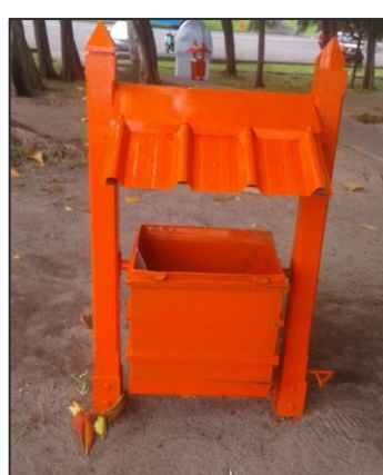
Saint Felix public beach After