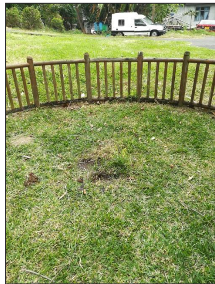
Removal of damaged equipment in children's playground at Petit Sable public beach - after