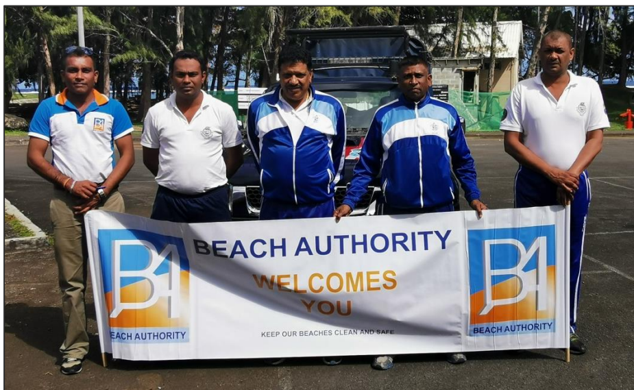
Personnel of Beach Authority and National Coast Guard at Saint Felix public beach