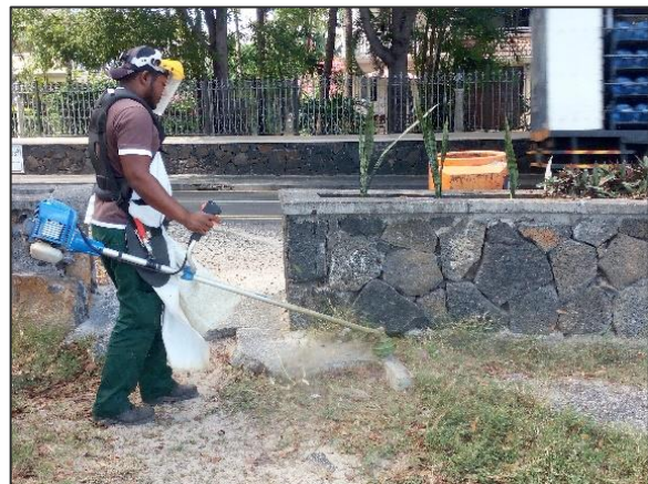
Mowing of grass