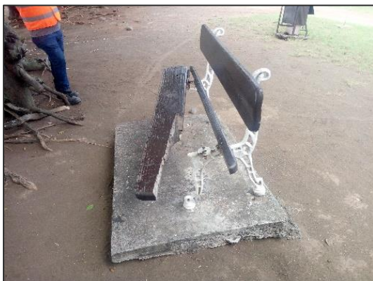
Removal of damaged bench at Sable Noir public beach Before