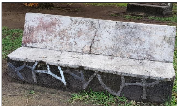
Painting of concrete bench Before