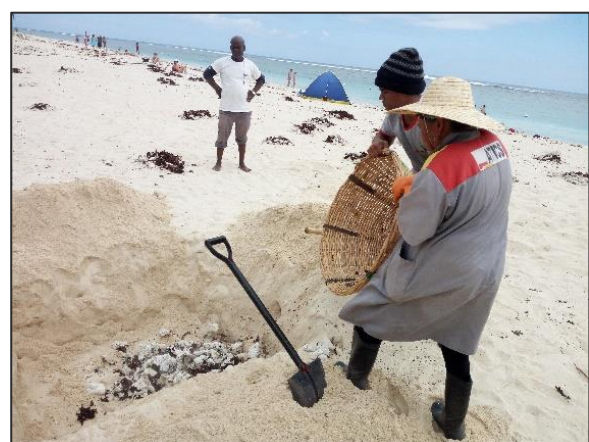
Burying of corals Work in progress