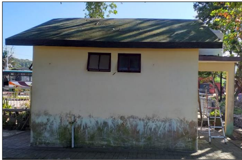
Painting of toilet block Before