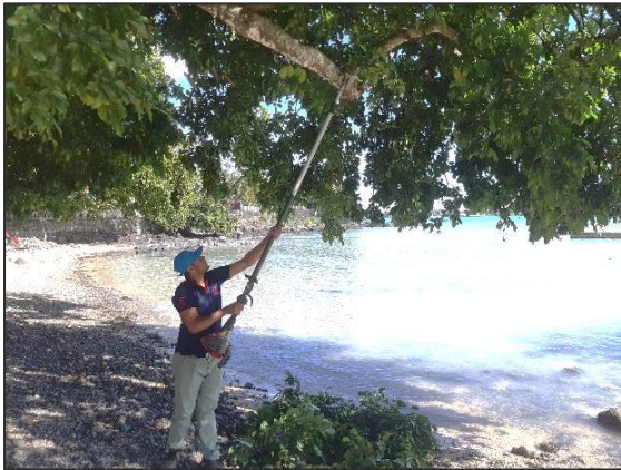
Pruning of branches at Grand Baie public beach (near NCG)