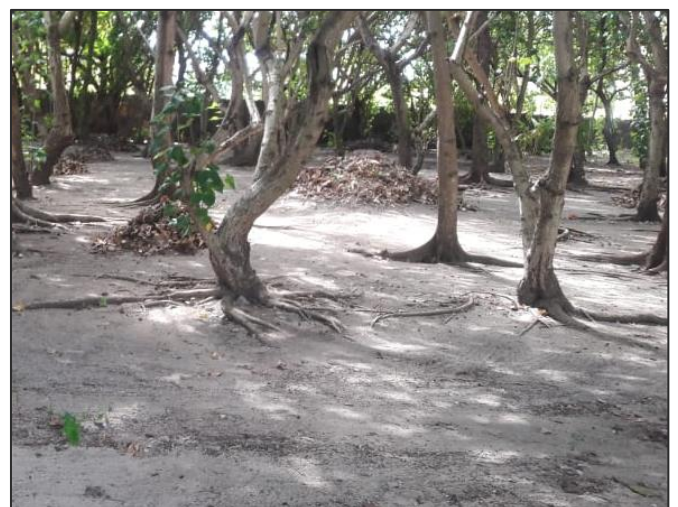
Cleaning of public beach (After)