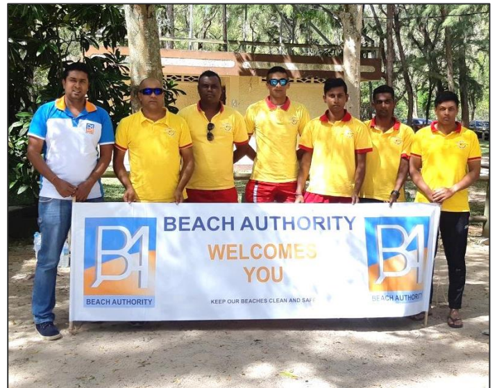
Personnel of the Beach Authority and Special Mobile Force at Mont Choisy public beach