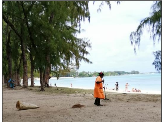
Cleaning of Mont Choisy public beach