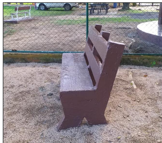
Painting of concrete bench After