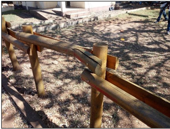
Reinstatement of damaged wooden parapet at Pointe aux Sables public beach Before