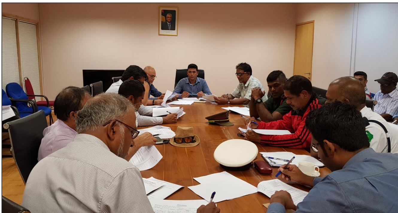
Meeting held at the seat of the Authority in the context of Assumption Day