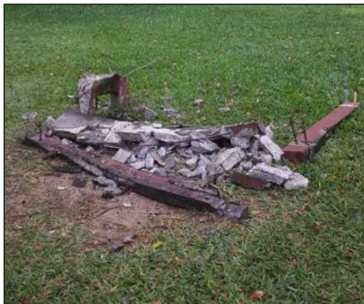
Removal of damaged bench Before