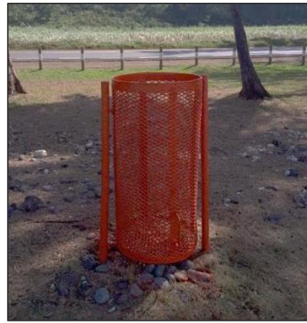
Rivière des Galets public beach After