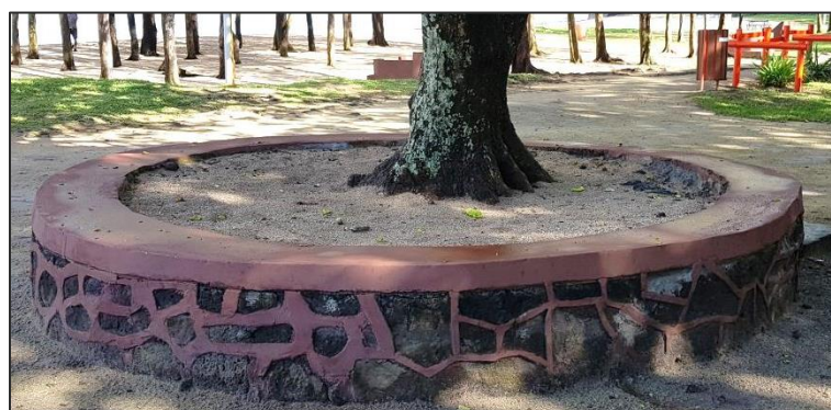
Painting of planter - after