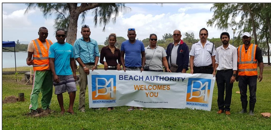
Participants of cleaning of lagoon and embellishment campaign at Blue Bay public beach