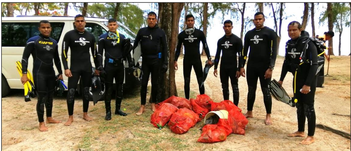
Waste collected at Mont Choisy public beach together with Divers from Groupe d'Intervention de la Police Mauricienne