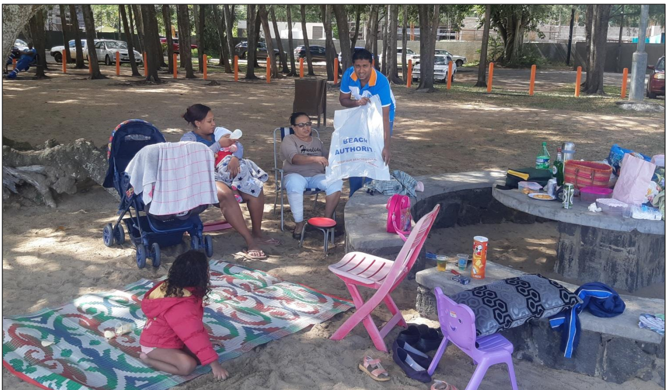
Distribution of plastic bin bags to beach users at Le Goulet public beach