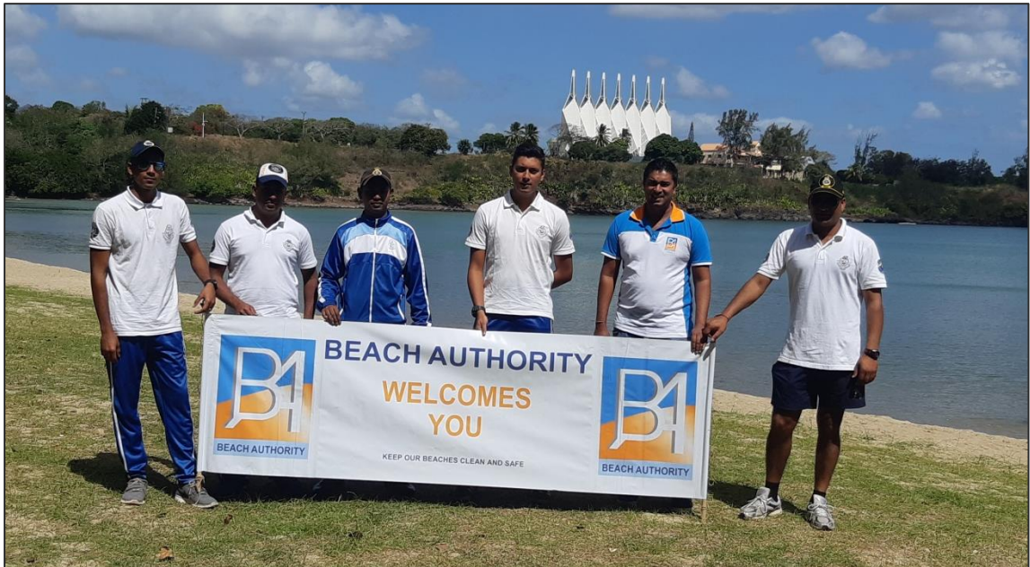
Personnel of National Coast Guard and Beach Authority at Le Goulet public beach