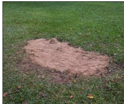
Removal of damaged bench After