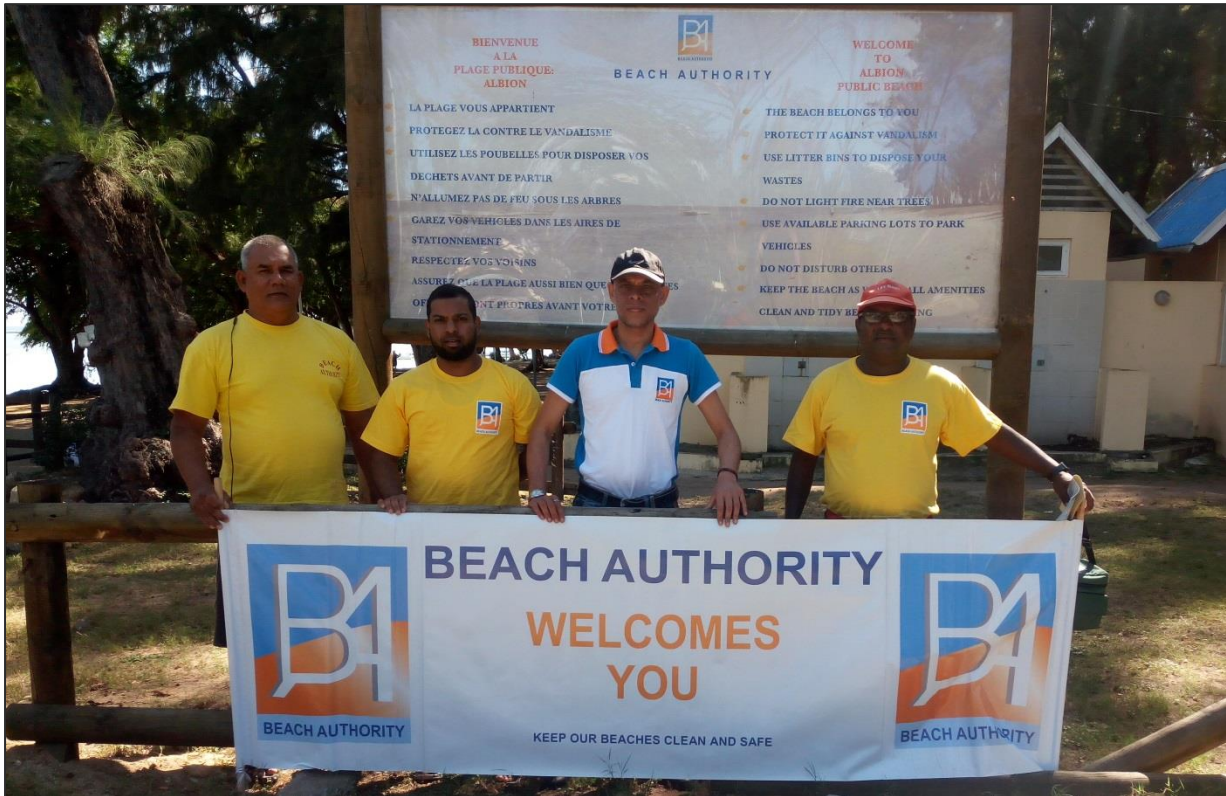
Personnel of Beach Authority and members of Albion Life Saving Club at Albion public beach