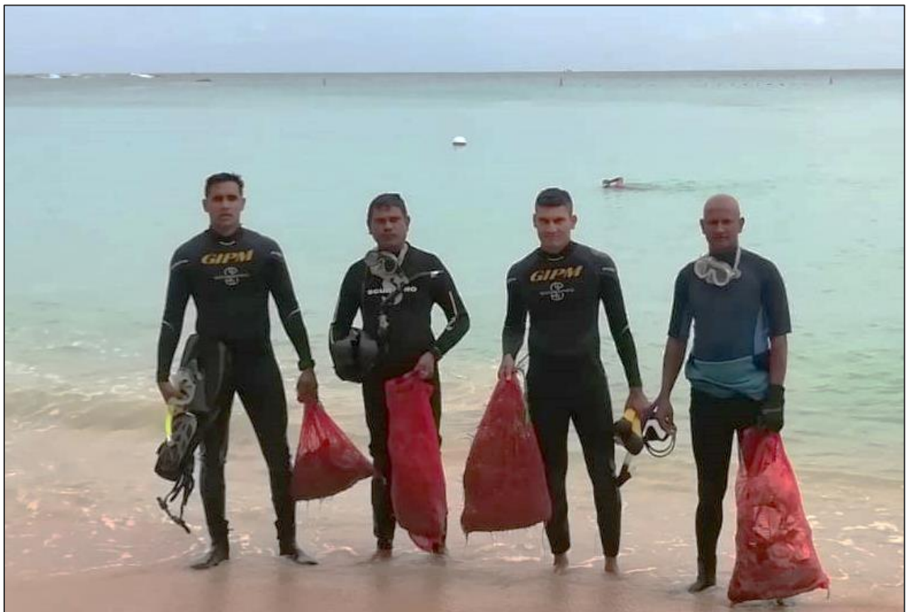
Cleaning of lagoon at Pereybère public beach by Divers from Groupe d'Intervention de la Police Mauricienne