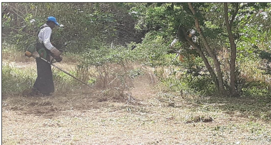
Work in progress