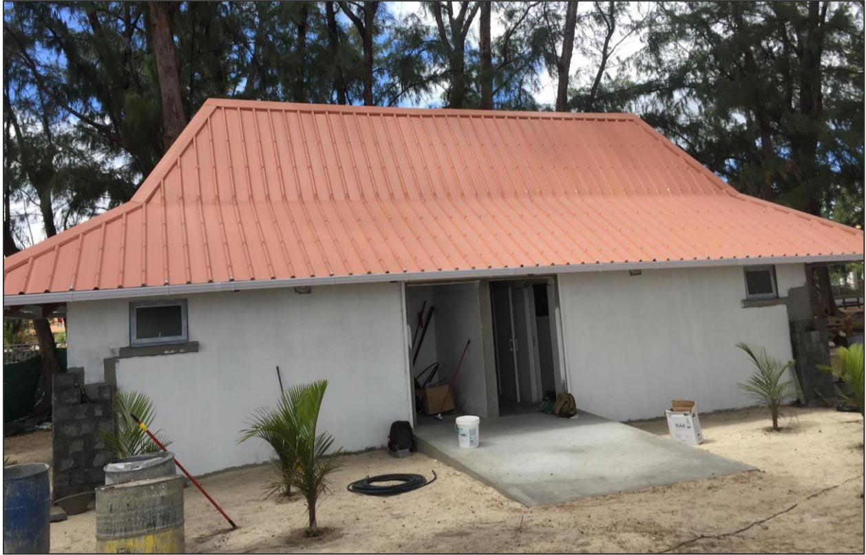
Fixing of iron sheets for new toilet block at Flic en Flac public beach (Work completed)

The Authority has embarked on the construction of a new toilet block at Flic en Flac public beach (near ex-Mer de Chine) with a view to provide better facilities to beach users. The works have started since April, 2019 and are expected to be completed by mid-September, 2019 .