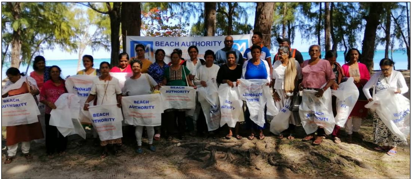
Distribution of plastic bin bags to beach users at Mont Choisy public beach