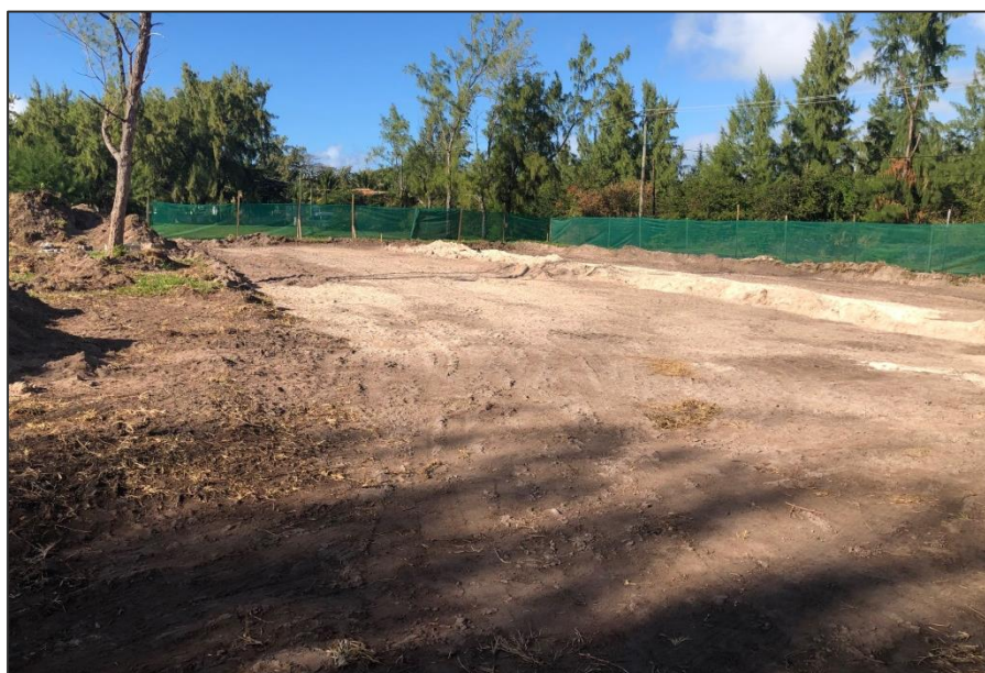
Setting out and excavation to required lines and level for new parking area at Palmar public beach (Work completed)