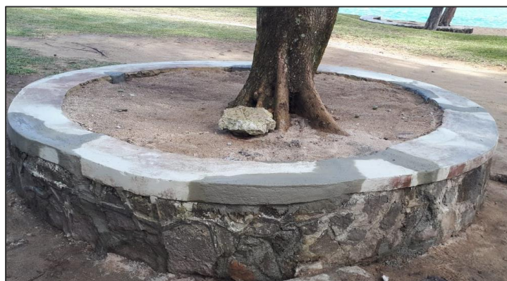
Painting of planter - before