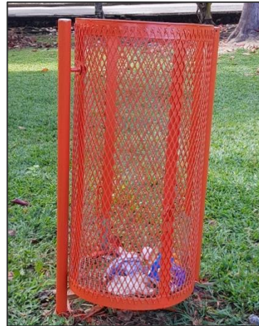
Painting of bins After