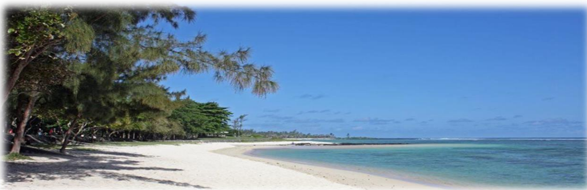
Saint Felix public beach