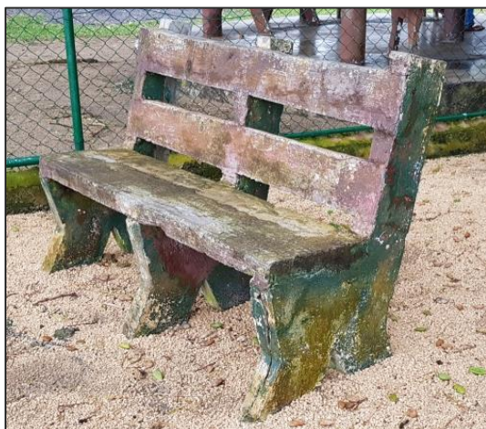
Painting of concrete bench Before