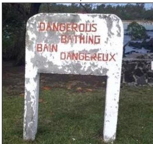
Le Bouchon public beach Before