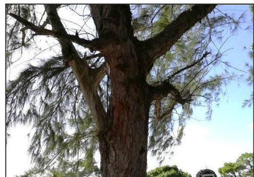
Removal of illegal advertising panel at Roches Noires public beach - after