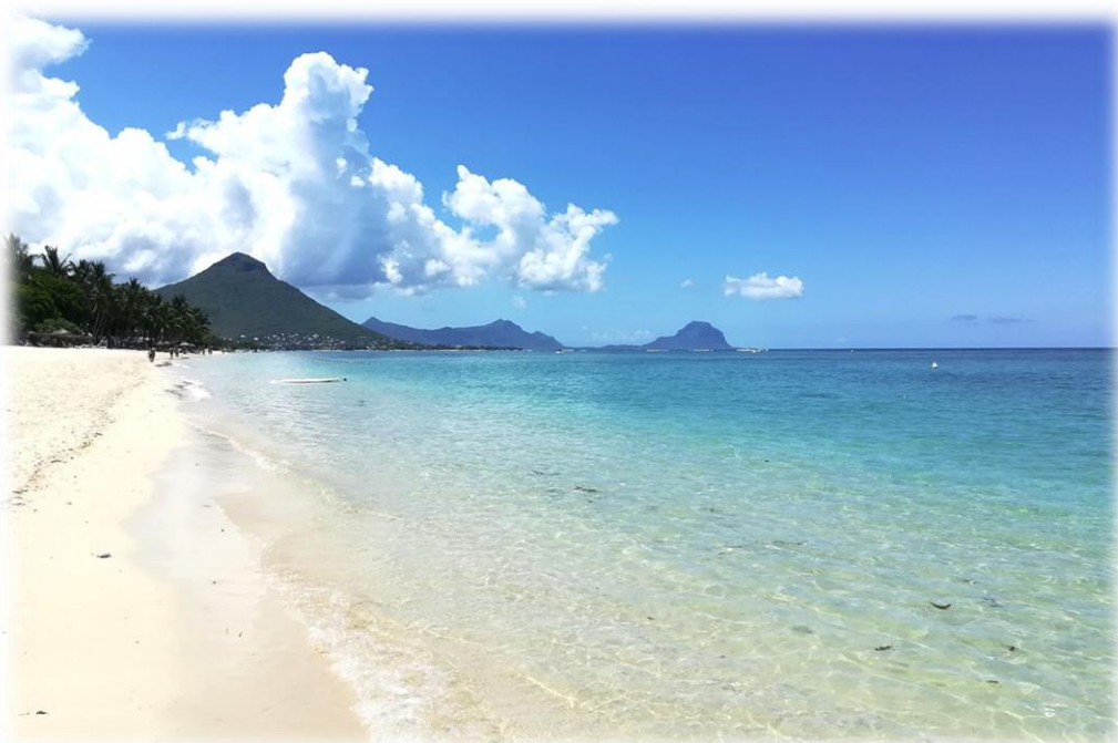
Flic en Flac public beach