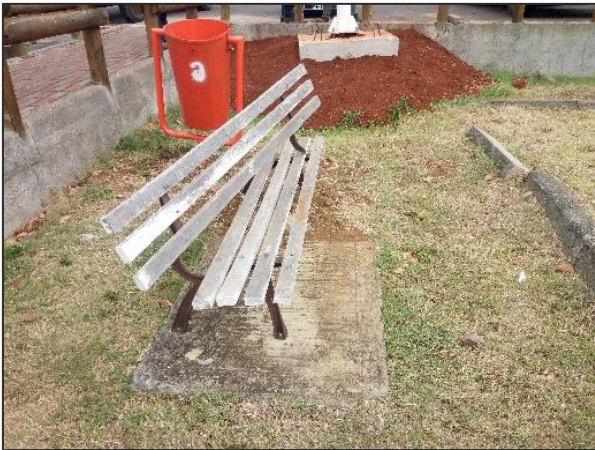
Removal of damaged bench at Pointe aux Sables public beach (near Martello Tower) Before