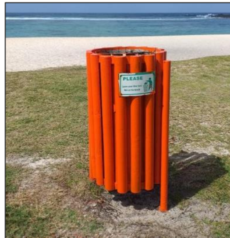
La Cambuse public beach After