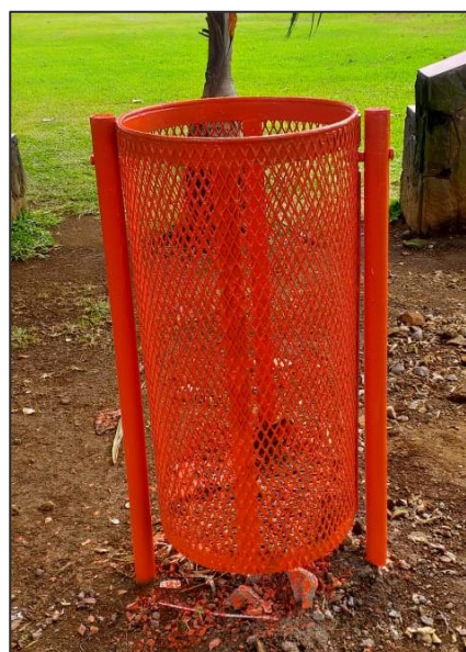
Painting of bin After