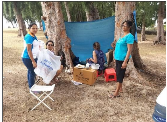
Distribution of plastic bin bags and flyers to beach users at Flic en Flac public beach