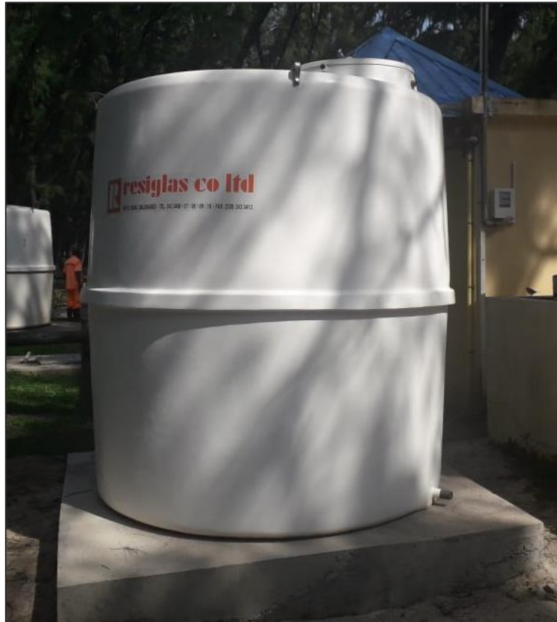
Water tank with concrete platform installed at Mont Choisy public beach