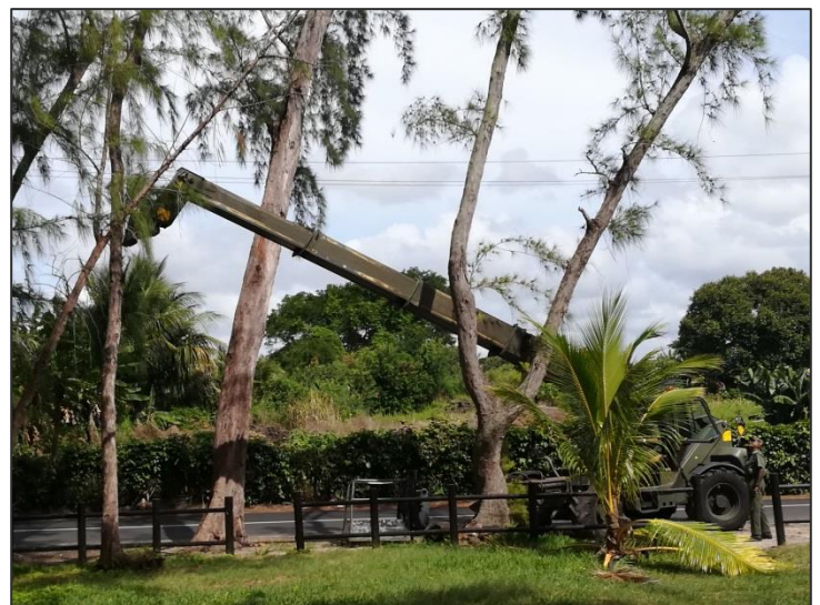
Felling of dry and dangerous trees by personnel of Special Mobile Force at Belle Mare public beach