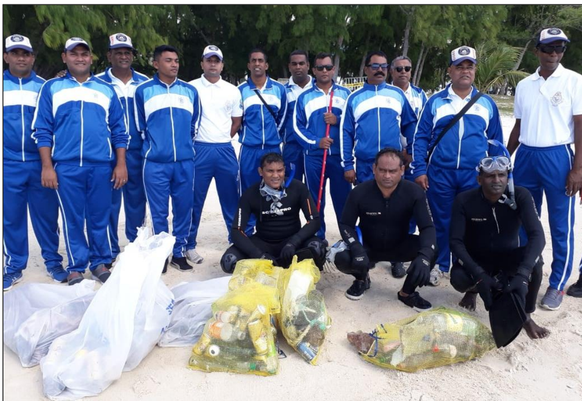
Personnel of National Coast Guard together with waste collected from cleaning of lagoon at Belle Mare public beach