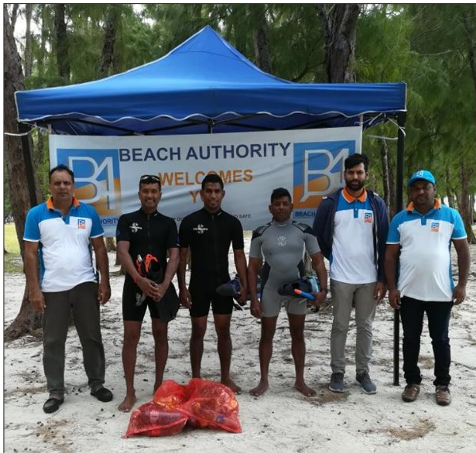
Wastes collected at Belle Mare public beach together with Staff of the Beach Authority and Divers from Crystal Diving Limited