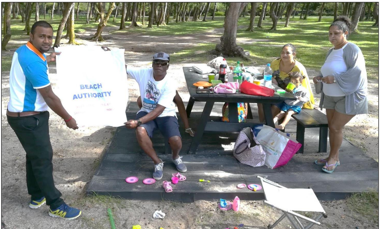
Distribution of plastic bin bags to beach users at Palmar public beach