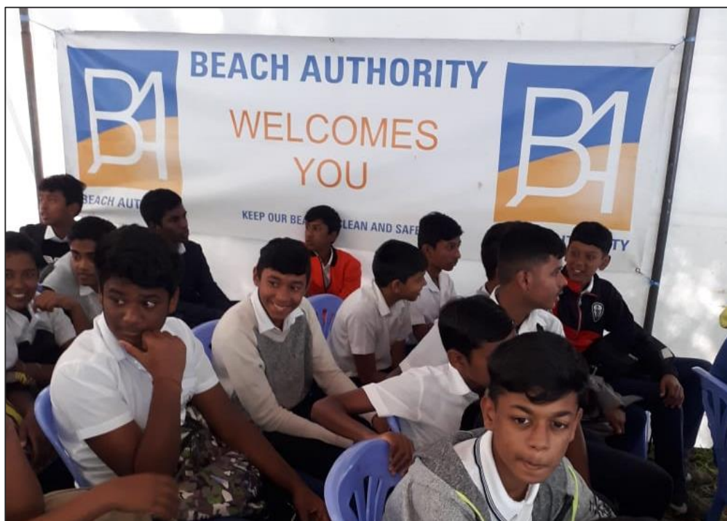
Students from Professor Basdeo Bissoondoyal College