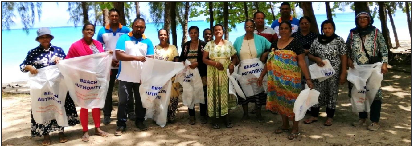
Distribution of plastic bin bags to beach users at Mont Choisy public beach