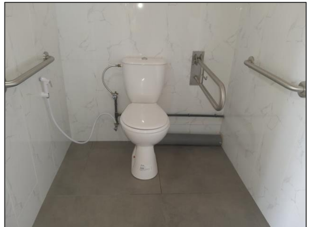
Provision of toilet facilities to disabled persons