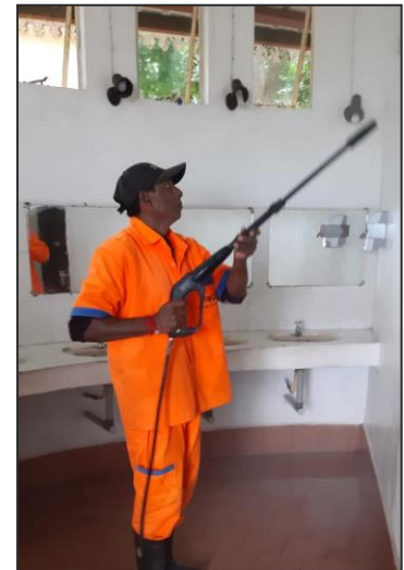
Pressure cleaning of toilet block at Riambel toilet block