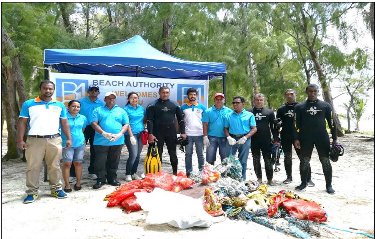
Wastes collected at Belle Mare public beach and Staff of the Beach Authority, Emeraude Beach Attitude Hotel and Divers from Groupe d'Intervention de la Police Mauricienne (GIPM)