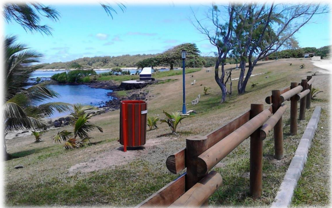
Le Bouchon public beach

The support of all stakeholders is of vital importance to enable the Beach Authority to continue in its everlasting quest for clean-up and embellishment of all proclaimed public beaches around the island.