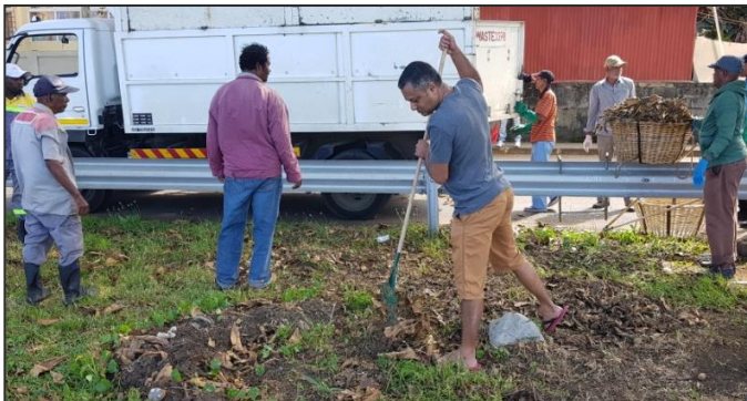
Clearing of grass and dry leaves by village councillors and personnel of FSU