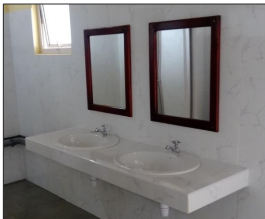
Fixing of wash hand bassin mounted on a concrete platform and fixing of mirror