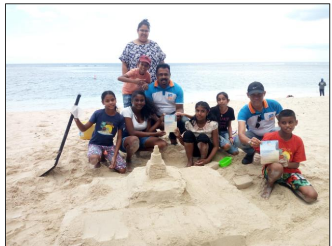
Distribution of plastic bin bags and flyers to beach users at Flic en Flac public beach