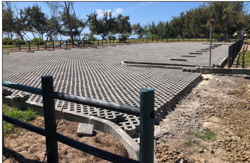
Laying of eco blocks and fixing of plastic composite poles for parking area at Palmar public beach - work in progress