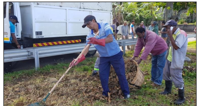
Cleaning of the beach by the personnel of FSU