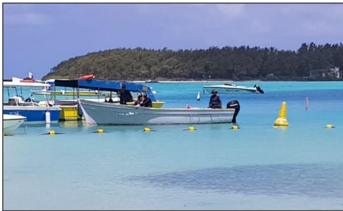
Provision of boat from Ministry of Ocean Economy, Marine Resources, Fisheries, Shipping and Outer Islands (Fisheries Division) and Divers from National Coast Guard