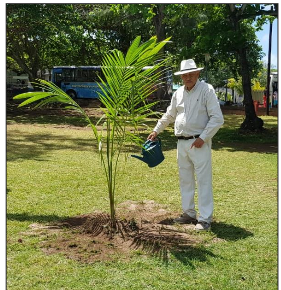
Watering of coconut tree