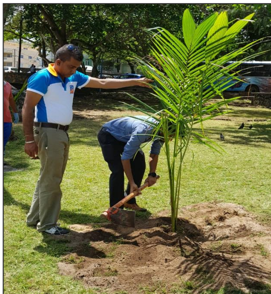
Planting of coconut tree