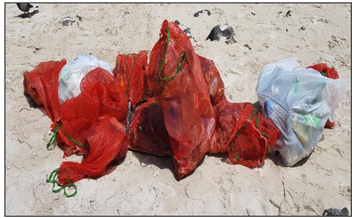
Waste collected from cleaning of lagoon