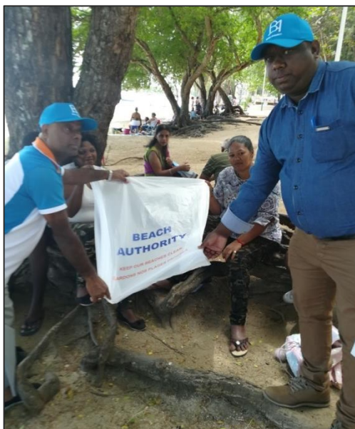
Wolmar public beach