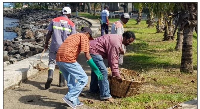
Clearing of grass and dry leaves by personnel of FSU