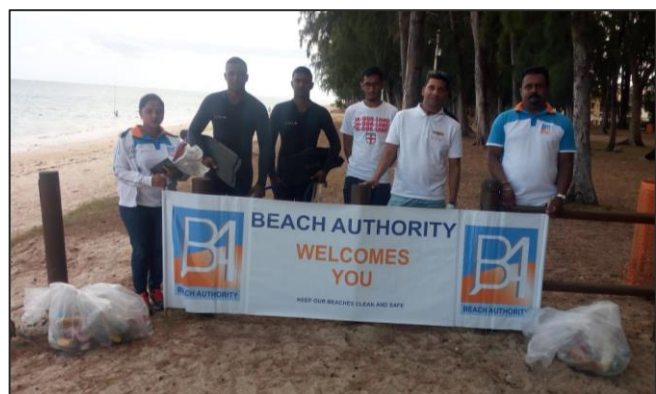
Waste collected following cleaning of lagoon at Flic en Flac public beach