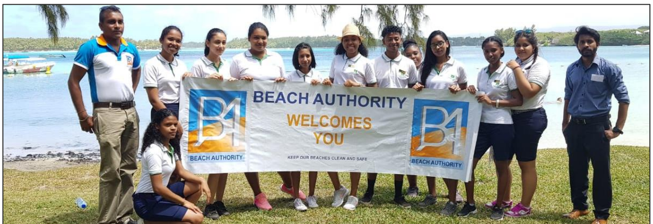
Staff of the Beach Authority together with students from Ecole Hôtelière Sir Gâetan Duval