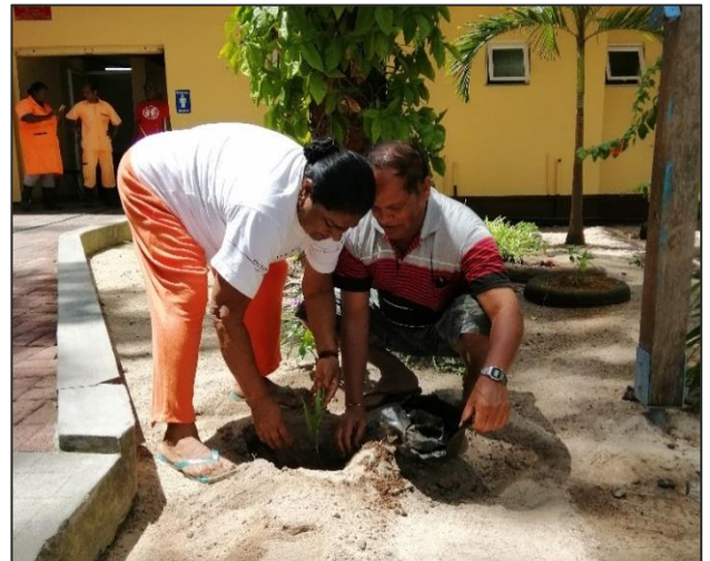
Tree plantation at Mont Choisy public beach