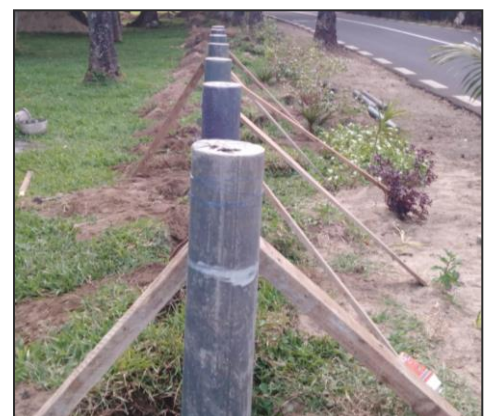
Enclosure of public beach with plastic composite poles (Work in progress)