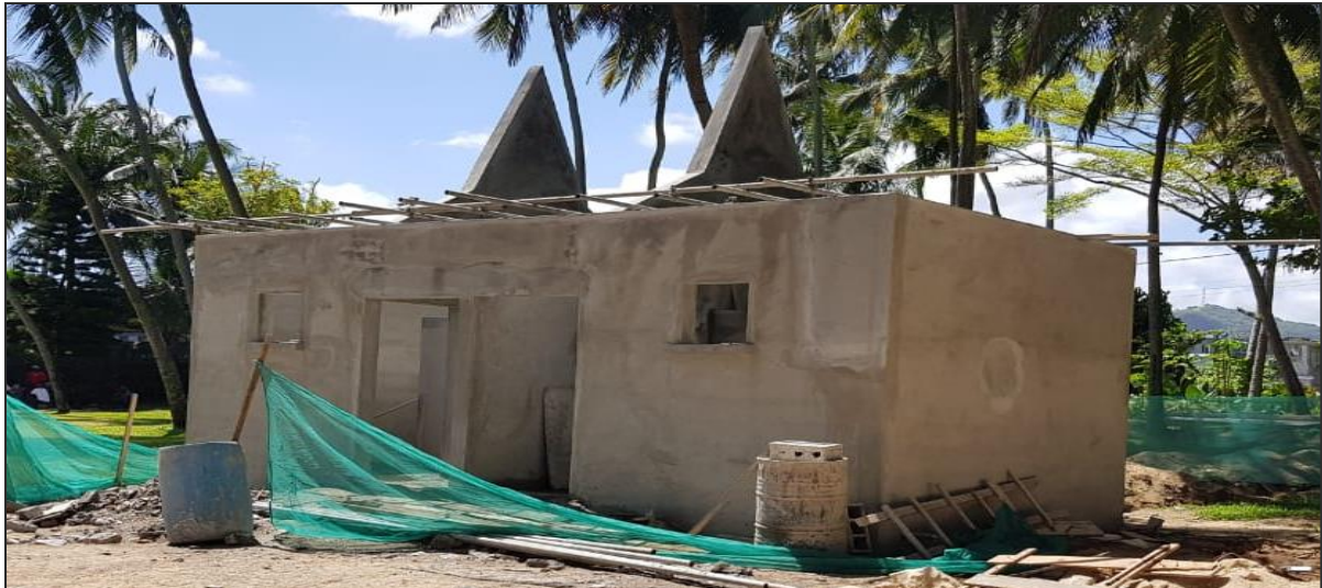
Construction of a new toilet block at Riambel public beach (Work in progress)