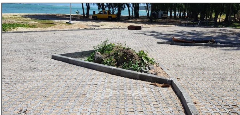
Laying of ecoblocks and backfilling with crushed corals (Work completed)