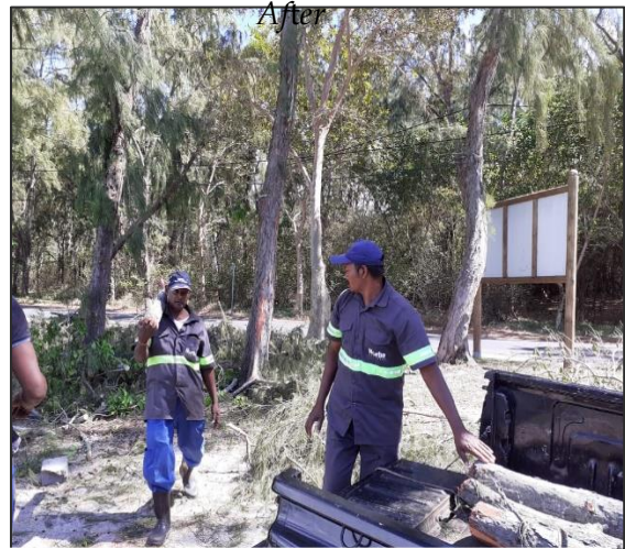
Felling and carting away of dangerous trees by personnel of Norba Nettoyage Ltd, the scavenging contractor at Bras d'Eau public beach