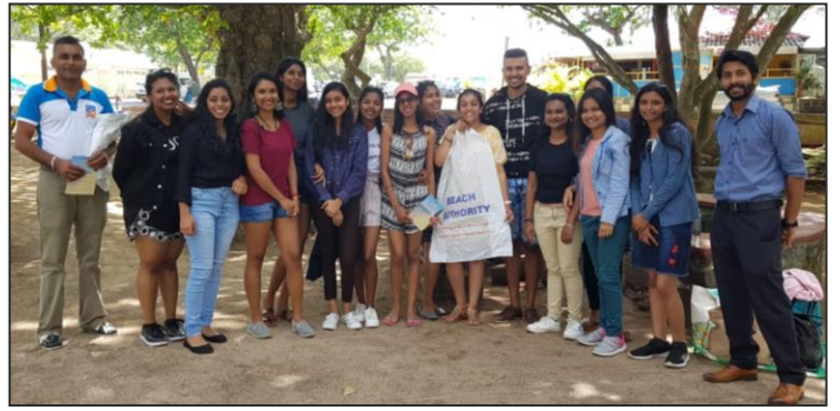
Distribution of plastic bin bags and flyers at Blue Bay public beach