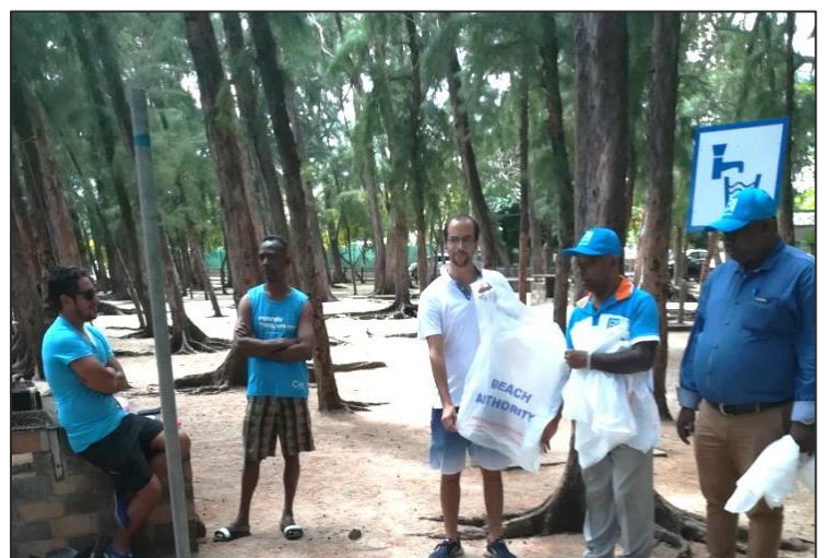
Albion public beach