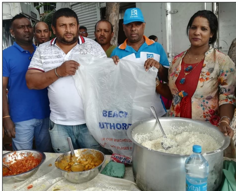
Distribution of plastic bin bags to beach users at Flic en Flac public beach

In its quest for arousing awareness amongst the beach users and to ensure a clean and safe public beach, the Beach Authority is continuously carrying out sensitisation campaigns through the distribution of plastic bin bags and pamphlets to beach users. This laudable initiative has been well appreciated by the general public. Sensitisation campaigns were carried out at Flic en Flac, Wolmar and Albion public beaches on 3 September, 2019 in the context of the celebration of Ganesh Chaturthi Festival.