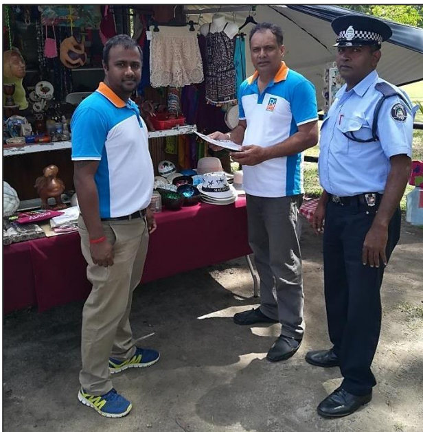
Verification of Beach Trader Licence at Belle Mare public beach