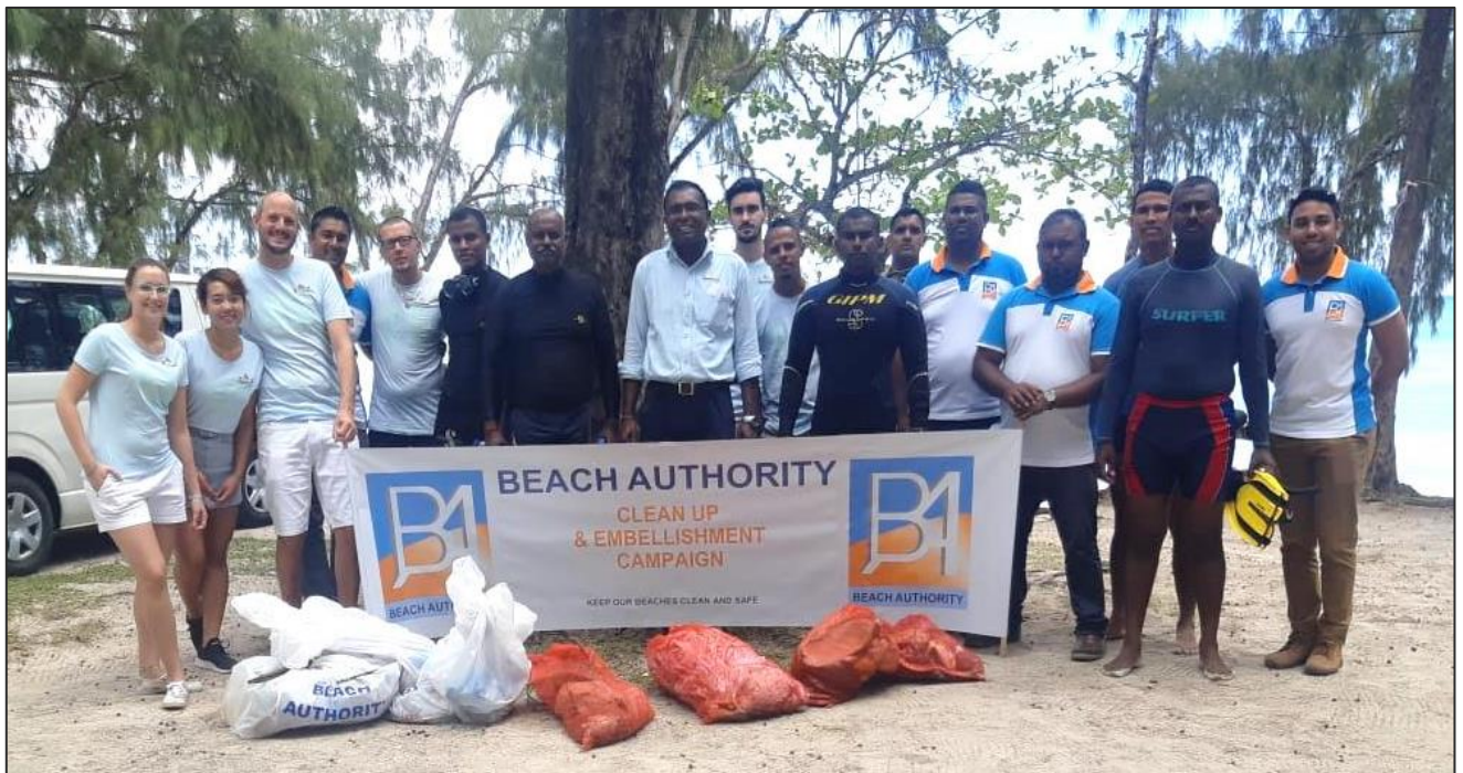
Divers from Groupe d'Intervention de la Police Mauricienne, Staff of the Beach Authority and Club Med La Pointe aux Cannoniers