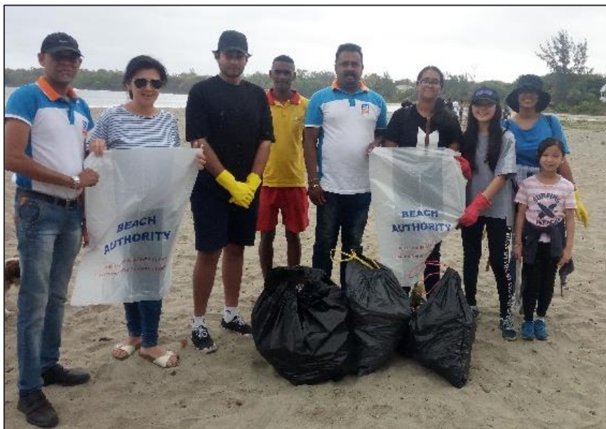
Wastes collected at Tamarin public beach together with participants of the clean-up campaign, Divers from Special Mobile Force and Staff of the Beach Authority