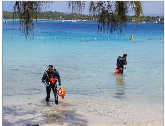
Cleaning of lagoon by Divers from Special Mobile Force and Groupe d'Intervention de la Police Mauricienne