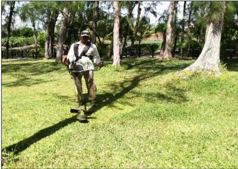
Mowing of grass at Belle Mare public beach