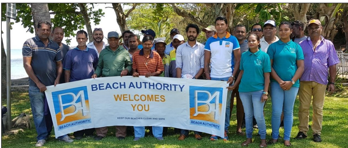
Participants of the clean-up campaign at Ruisseau des Créoles public beach together with Staff of the Beach Authority