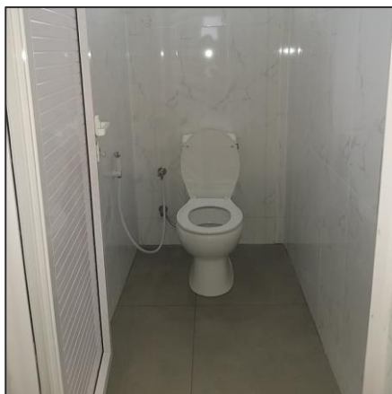
Supply and fixing of new water closet (wc) and tiling works