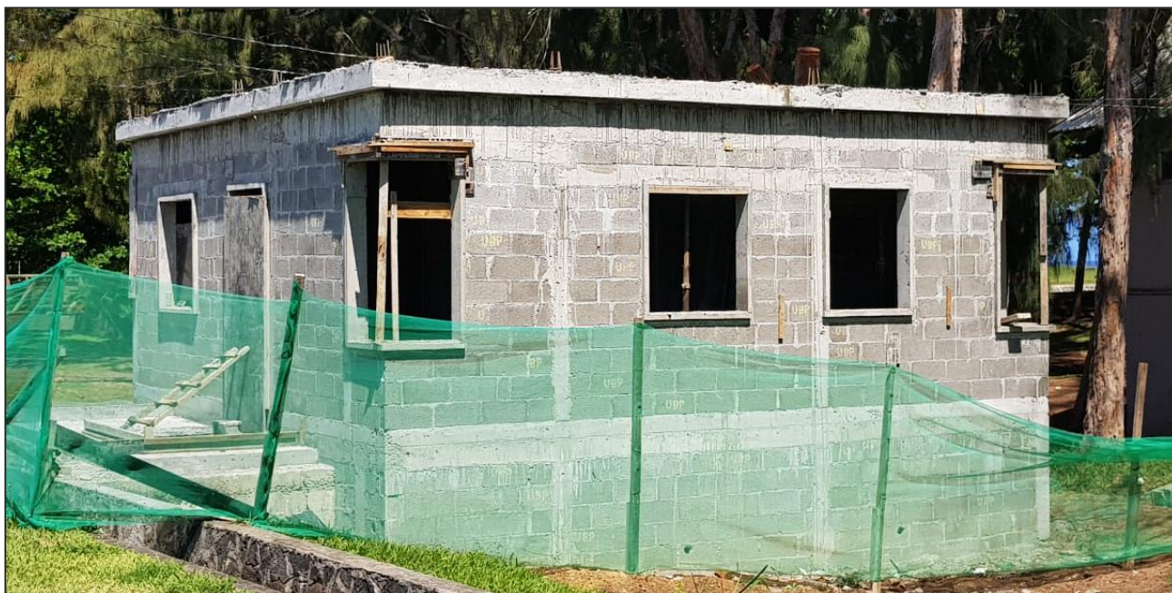
Construction of superstructure (Work completed)

In the context of the decentralisation of its activities, a fourth sub office is presently under construction at Saint Felix (South) public beach as from June, 2019. Works are expected to be completed by end of October, 2019 .