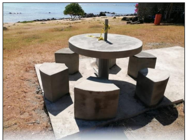
Work in progress