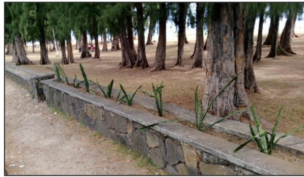
Planting of decorative plants