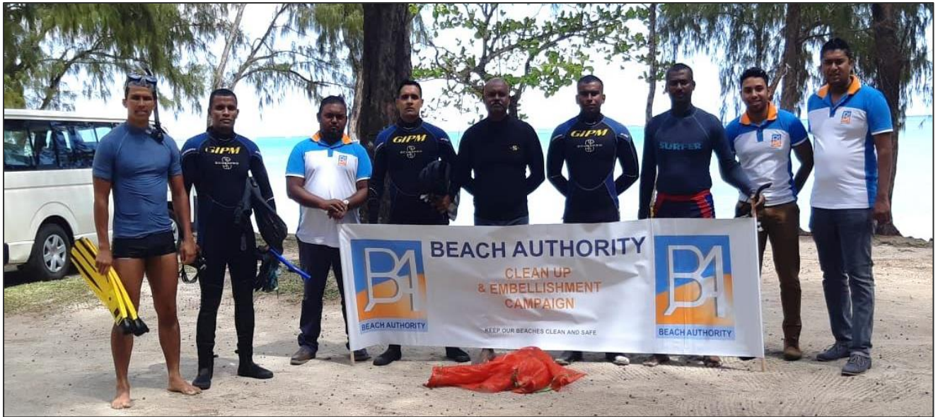
Staff of the Beach Authority together with Divers from Groupe d'Intervention de la Police Mauricienne prior to cleaning of lagoon at Mont Choisy public beach