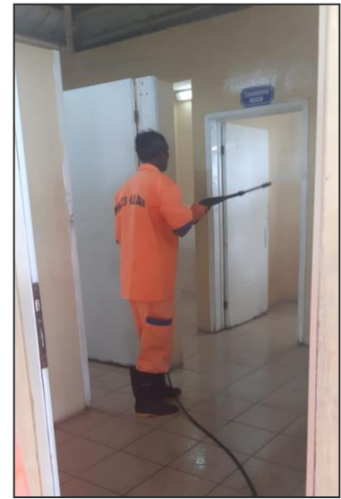
Pressure cleaning of toilet block at Saint Felix toilet block