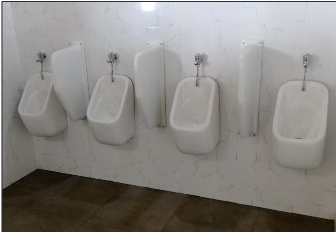
Supply and fixing of urinals with separators including bottle traps and flushing mechanism