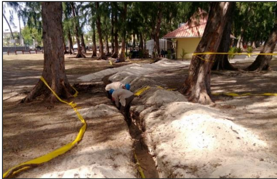
Excavation of trench – Work in progress