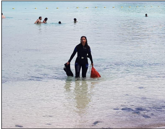
Cleaning of lagoon by Diver from Eco Sud