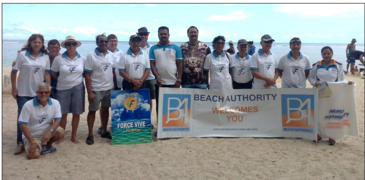
Participants at the cleaning of lagoon and embellishment campaign at Flic en Flac public beach