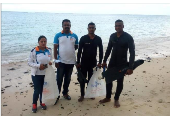
Staff of the Beach Authority together with Divers from National Coast Guard prior to cleaning of lagoon