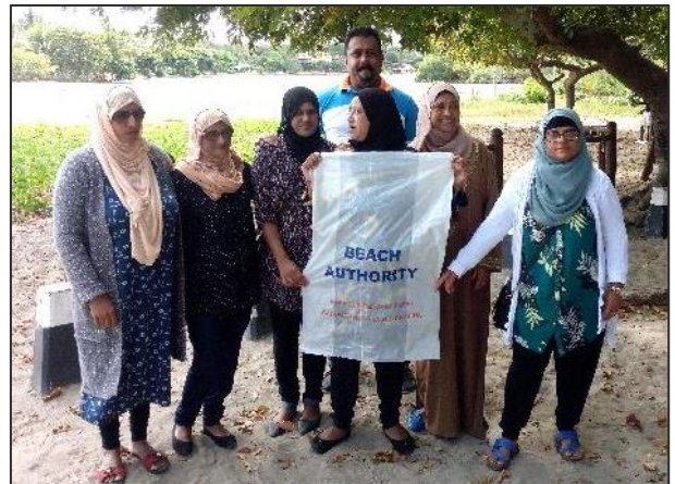
Distribution of plastic bin bags to beach users