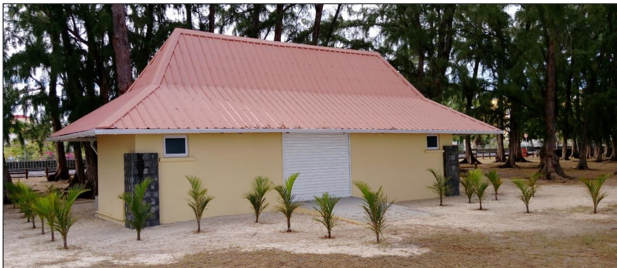
Newly constructed toilet block at Flic en Flac public beach

The construction of a new toilet block at Flic en Flac public beach (near ex-Mer de Chine) has been completed on 02 September, 2019 . The new toilet block with its associated amenities and facilities will provide better facilities and more comfort to beach users.