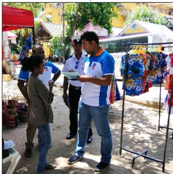
Verification of Beach Trader Licence at Grand Baie public beach