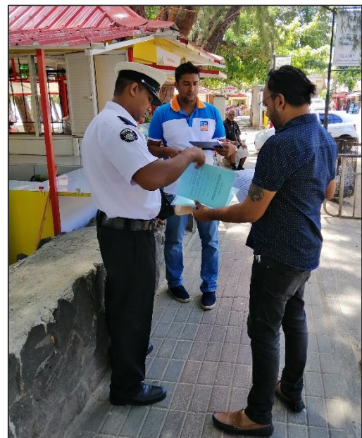
Verification of Beach Trader Licence at Grand Baie public beach