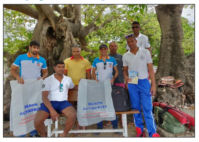
Distribution of plastic bin bags and pamphlets to beach users at Tamarin public beach