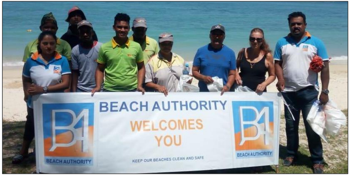
Staff of the Beach Authority together with members of Force Vives de Flic en Flac and personnel of Atics (Scavenging Contractor)