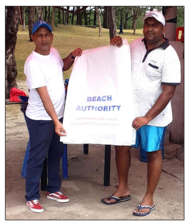
➤ Distribution of plastic bin bags to beach users at Le Bouchon and Blue Bay public beaches