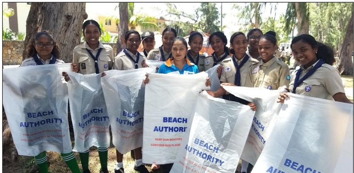
Distribution of plastic bin bags to beach users