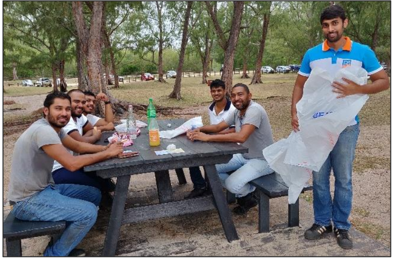
Distribution of plastic bin bags to beach users at Le Morne public beach