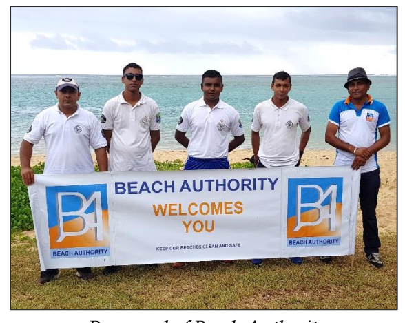
Personnel of Beach Authority and National Coast Guard