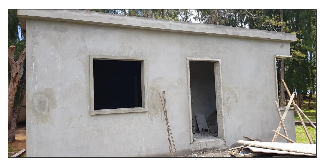
External rendering (work completed)