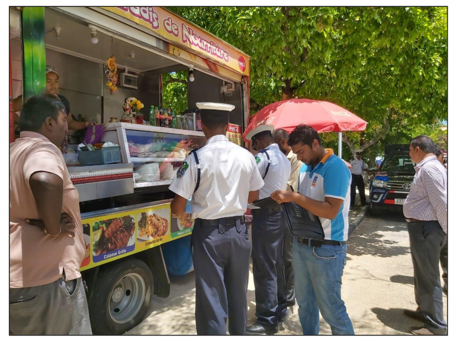
Verification of Beach Trader Licence at Grand Baie public beach