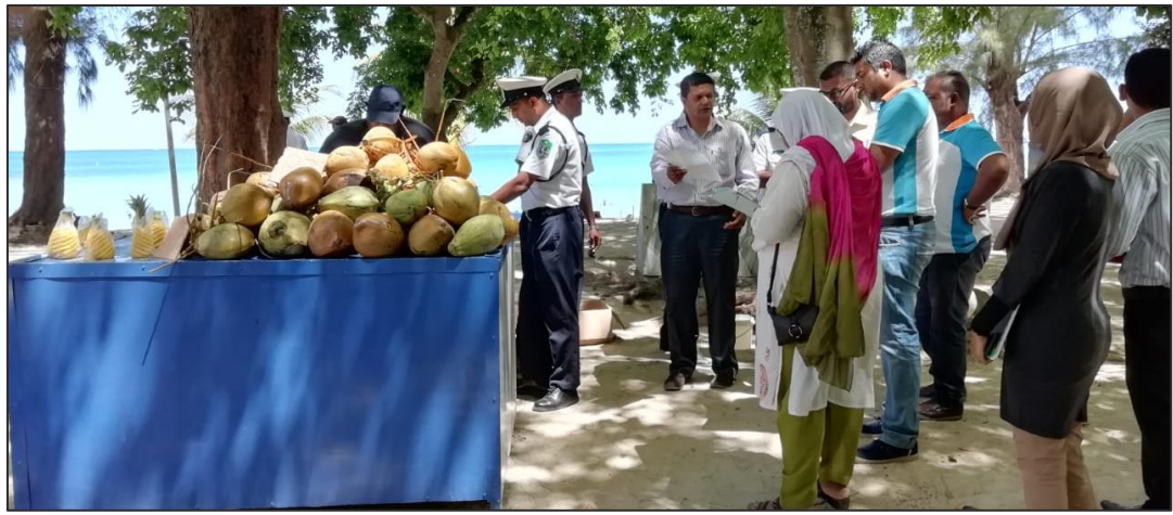
Verification of Beach Trader Licences by personnel of Ministry of Health and Wellness, National Coast Guard and Mauritius Revenue Authority at Pereybère public beach