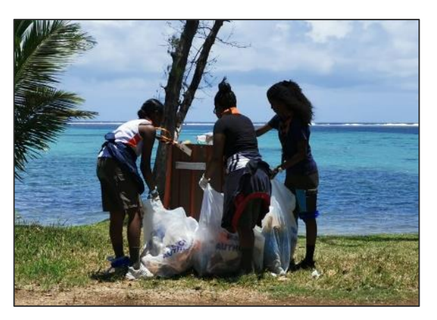
Carting away of wastes at Ruisseau des Créoles public beach