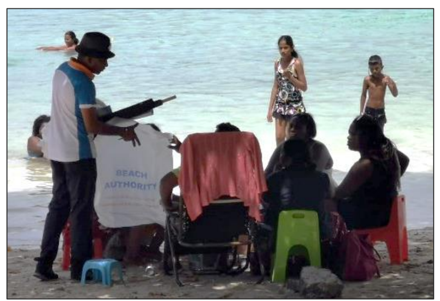
Distribution of plastic bin bags to beach users