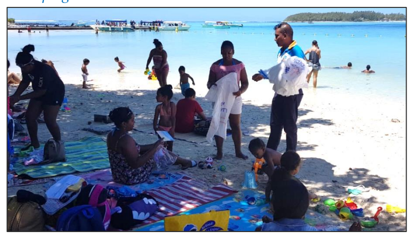
Distribution of plastic bin bags and pamphlets to beach users