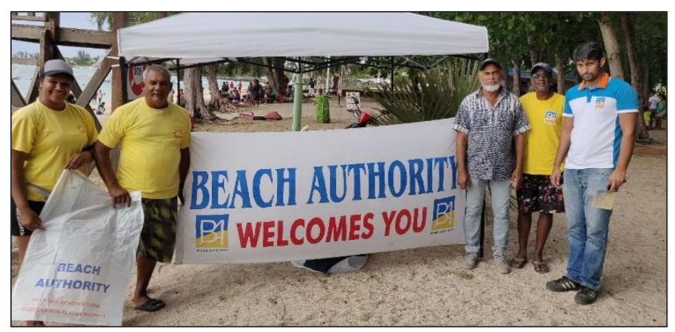
Personnel of Beach Authority and members of Albion Life Saving Club

➤ Lifesaving programme and sensitisation campaign at Albion public beach