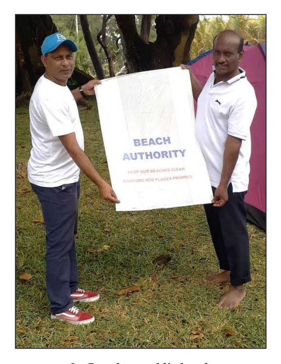
Le Bouchon public beach