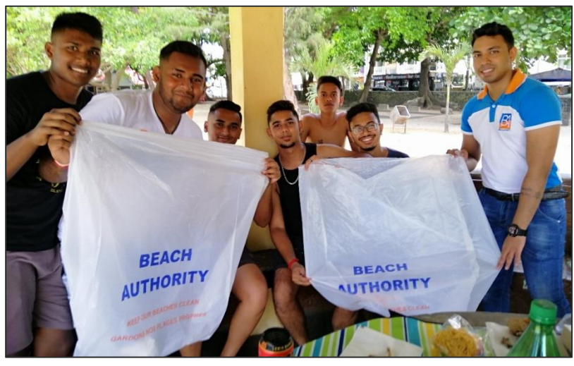
Distribution of plastic bin bags to beach users at Pereybère public beach