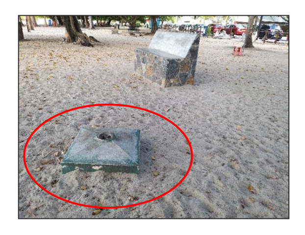
Painting of bins - Before