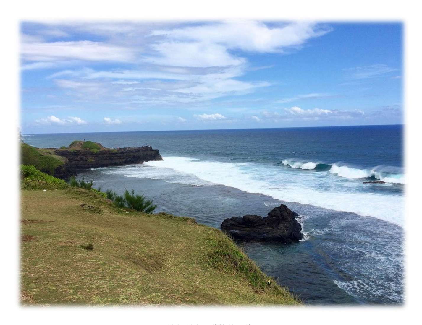
Gris Gris public beach

Moreover, in line with its mandate, the Beach Authority is doing its utmost effort to uplift all proclaimed public beaches in Mauritius with basic facilities such as toilet blocks, fireplaces, lighting facilities, picnic tables, kiosks and bins for the benefit and comfort of the beach users.