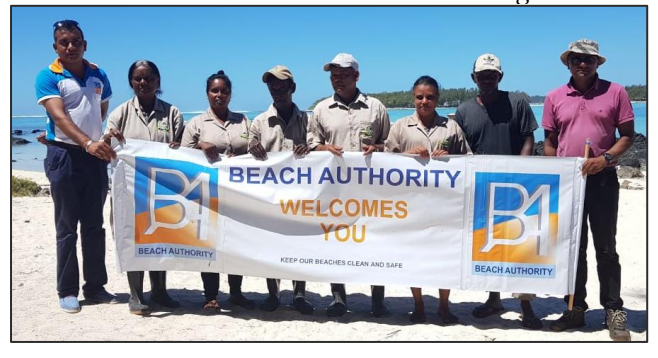
Personnel of Mauriclean Ltd