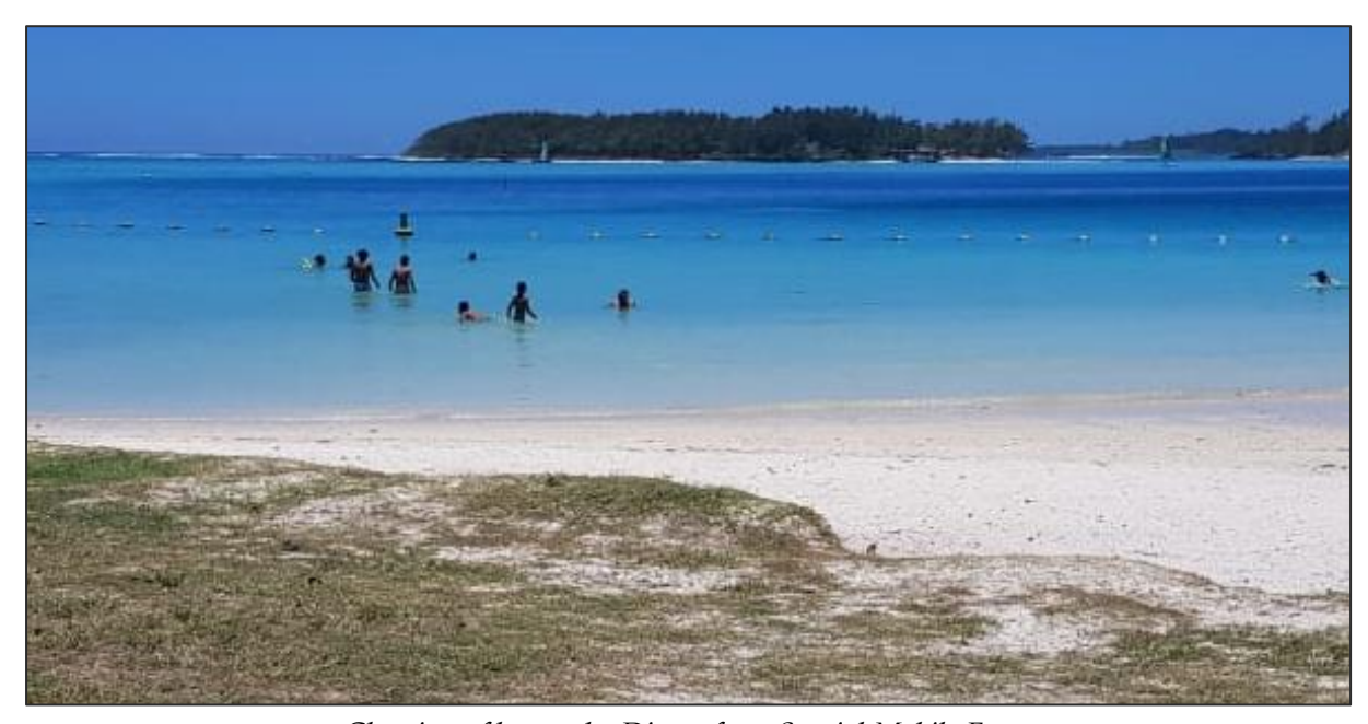
Cleaning of lagoon by Divers from Special Mobile Force