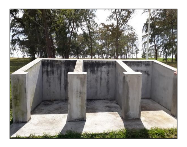
Painting of bins - Before