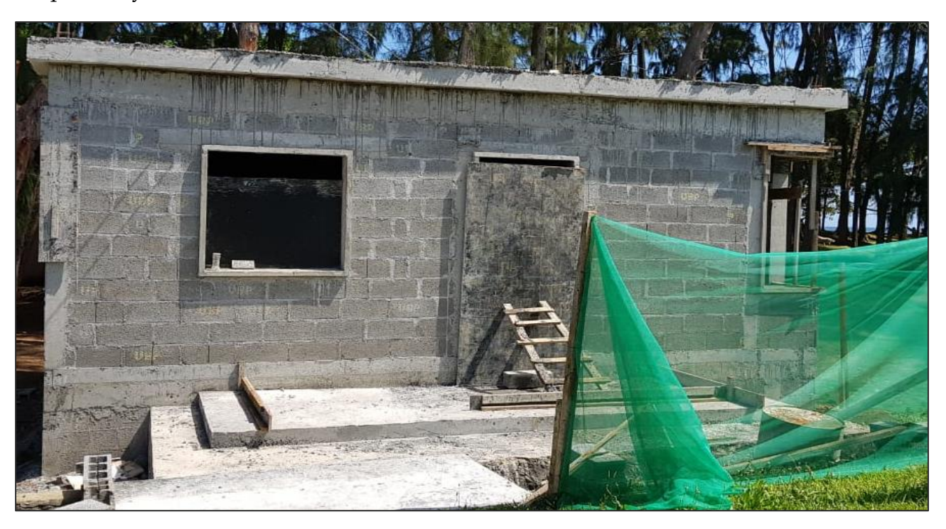
Casting of slab (work completed)

In the context of the decentralisation of its activities, a fourth sub office is presently under construction at Saint Felix (South) public beach as from June, 2019. Works are expected to be completed by end of December , 2019.