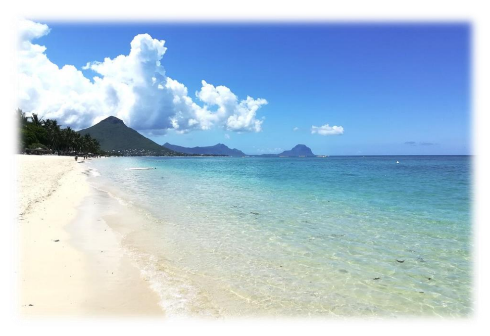
Flic en Flac public beach