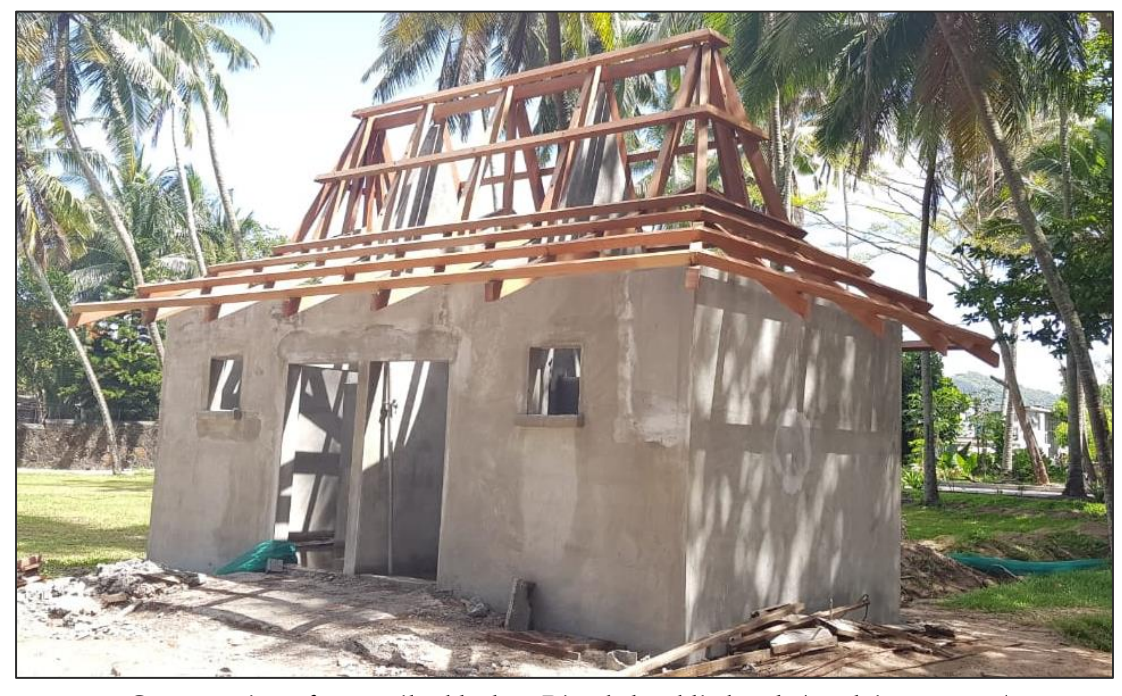
Construction of new toilet block at Riambel public beach (work in progress)