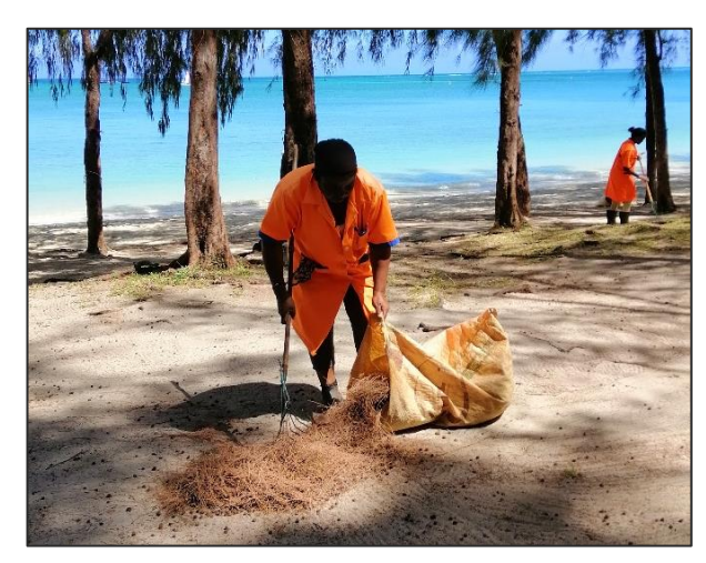
Mont Choisy public beach