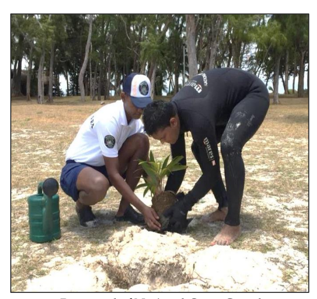
Personnel of National Coast Guard