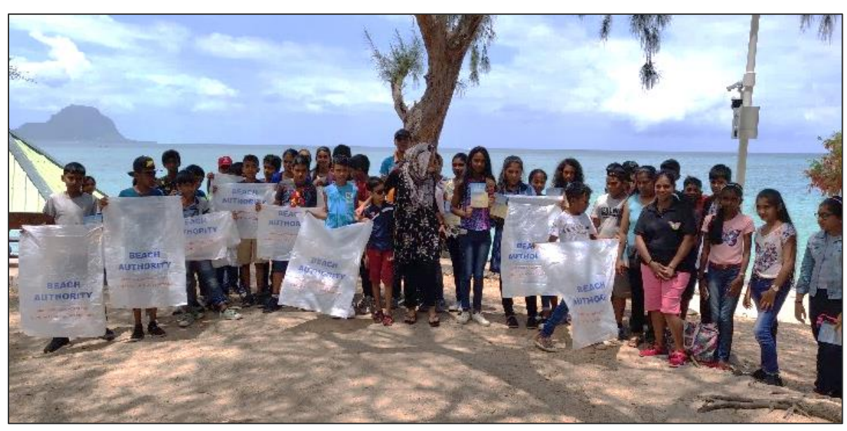
Distribution of plastic bin bags and pamphlets to beach users at La Preneuse public beach