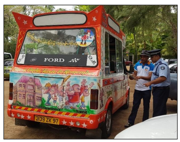
Monitoring of Beach Traders' Licence by Personnel of Beach Authority in collaboration with the Mauritius Police Force