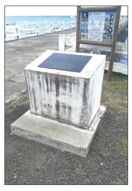
Painting of concrete base of lever arm - Before