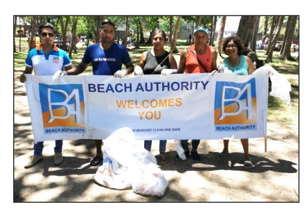
Association Brancardier de Plaine Magnien