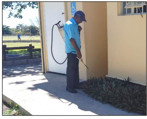
Pest control by personnel of Ministry of Health and Wellness