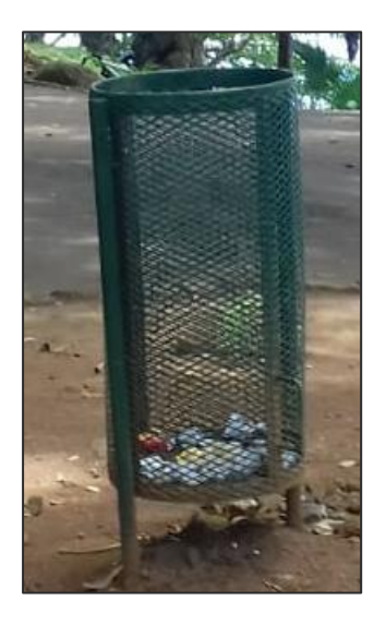
Painting of water fountain - Before