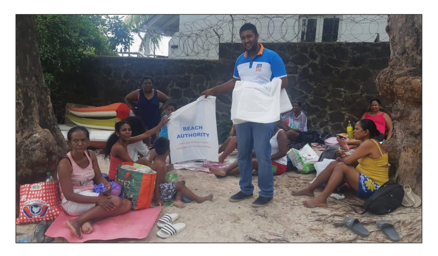
Distribution of plastic bin bags to beach users at Pereybère public beach