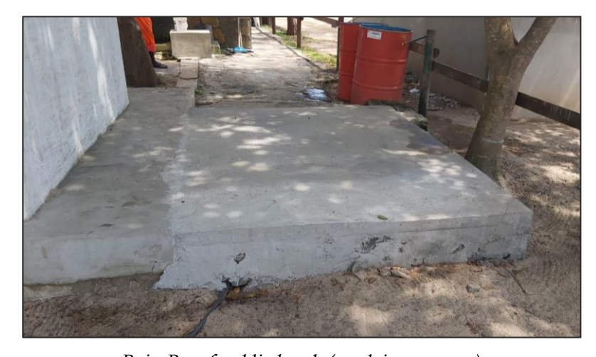
Bain Boeuf public beach (work in progress)