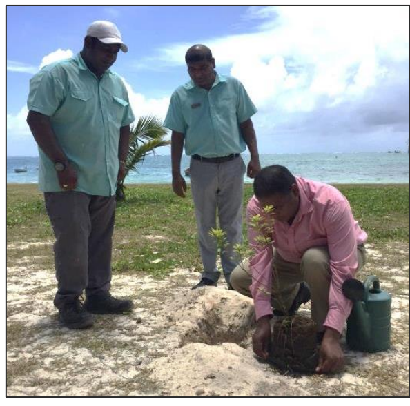
Staff of Emeraude Beach Attitude Hotel