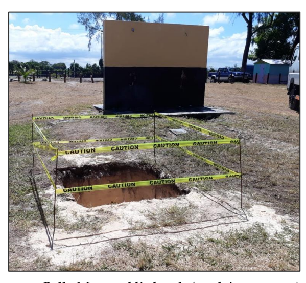
Belle Mare public beach (work in progress)