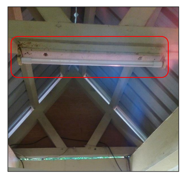
Upgrading of soak away - Before