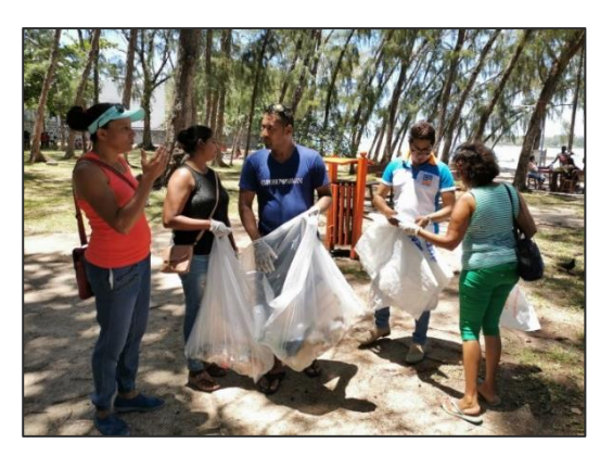
Cleaning of public beach by Association Brancardier de Plaine Magnien (NGO)