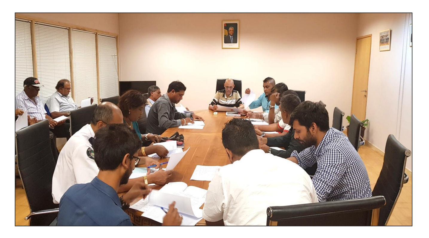
Meeting held at the seat of the Authority in the context of Ganga Snan Festival