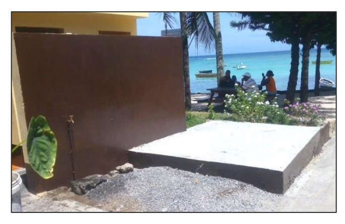
Trou aux Biches public beach (opposite Ex-Aquarium)

➤ Construction of concrete platforms for toilet blocks at Trou aux Biches (opposite Ex-Aquarium) and Grand Gaube public beaches