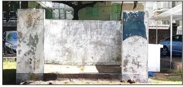
Repair of damaged bench (due to vandalism) at Pomponette public beach Before After