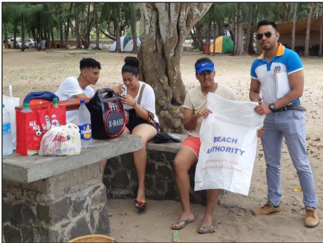
Distribution of plastic bin bags to beach users at Le Goulet public beach