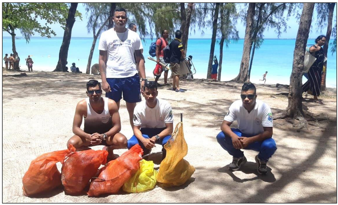
Waste collected at Mont Choisy public beach together with Personnel of National Coast Guard