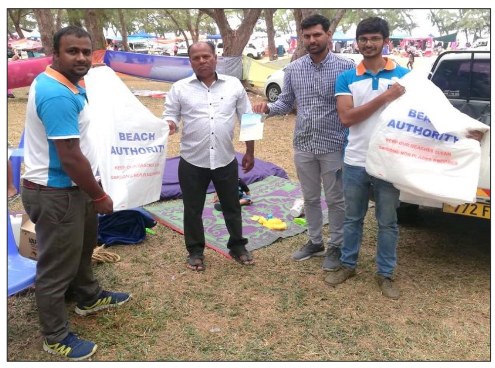
Distribution of plastic bin bags to beach users at Belle Mare public beach