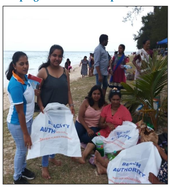
Distribution of plastic bin bags to beach users