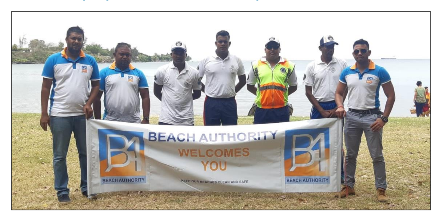
Personnel of National Coast Guard and Beach Authority

➤ Lifesaving programme and sensitisation campaign at Le Goulet public beach