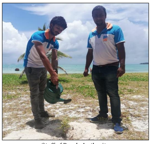
Staff of Beach Authority