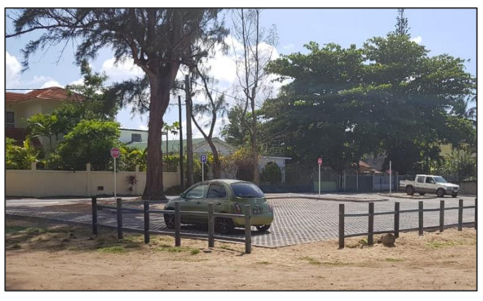
Enclosure of public beach and parking area with plastic composite poles (work in progress)