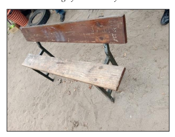
Painting of bench – Before

Upgrading works at Tamarin public beach (continued)