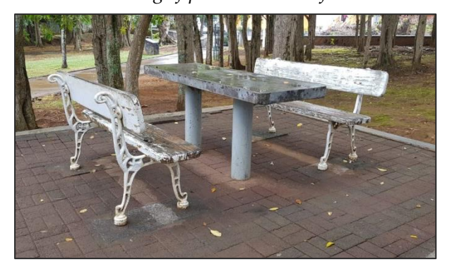
Painting of bin - Before