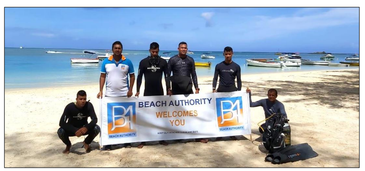
Grand Baie public beach