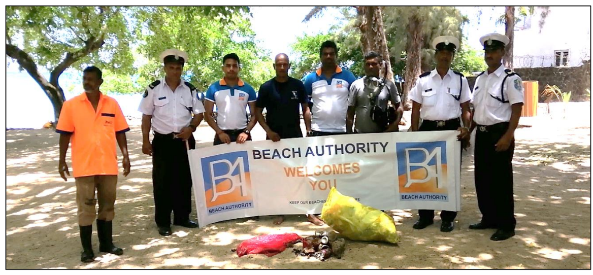
Waste collected at Pereybère public beach together with Staff of Beach Authority, Personnel of National Coast Guard and Maxi Clean Ltd