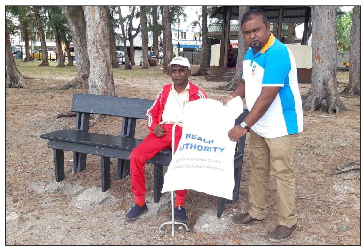
Distribution of plastic bin bags to beach users at Pointe aux Piments public beach (near Fish Landing Station)

➤ Lifesaving programme and sensitisation campaign at Pointe aux Piments (near Fish Landing Station) and Pereybère public beaches