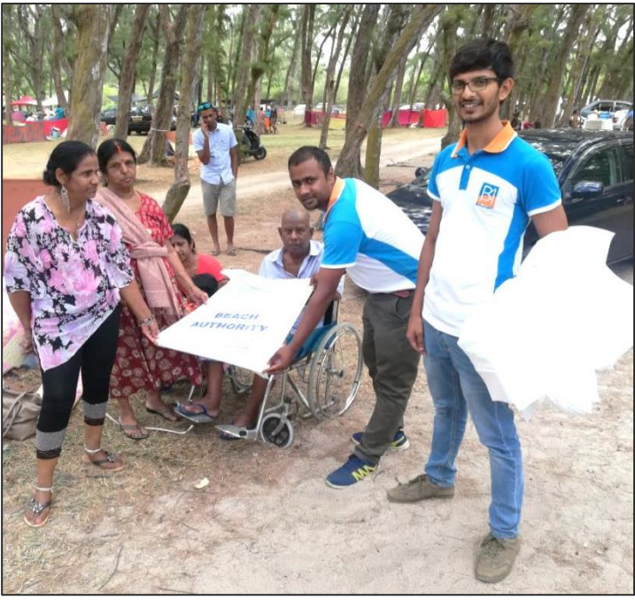
Distribution of plastic bin bags to beach users at Palmar public beach