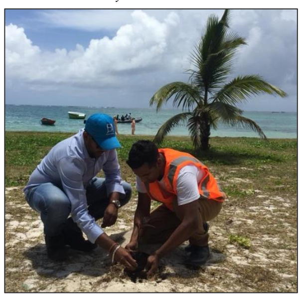
Staff of Beach Authority