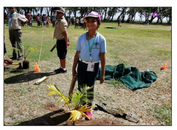
Tree plantation by members of Mauritius Scouts Association at Bel Ombre public beach