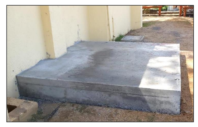
Grand Gaube public beach