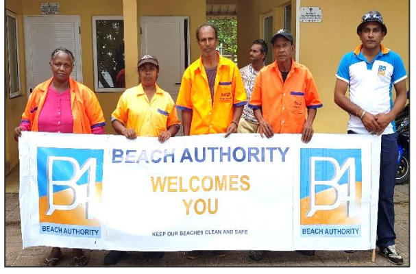
Personnel of Beach Authority and Maxiclean Ltd