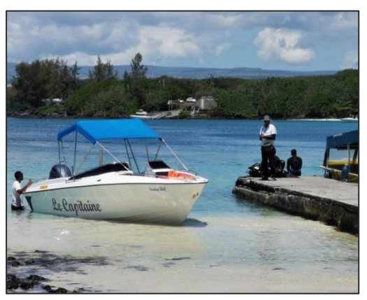
Monitoring of pleasure craft activities by personnel of Tourism Authority