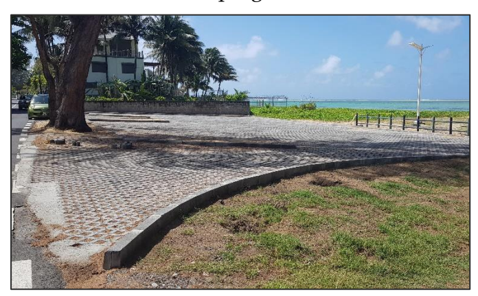
Laying of ecoblocks and backfilling with crushed corals (work completed)