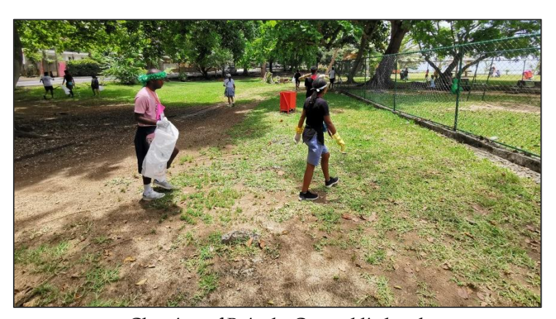
Cleaning of Baie du Cap public beach