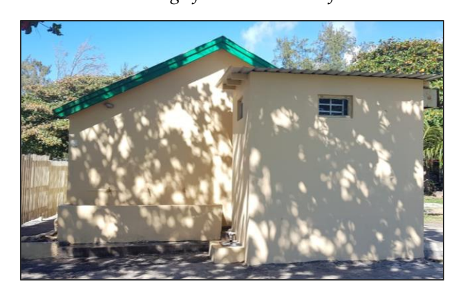
Painting of main bin - Before