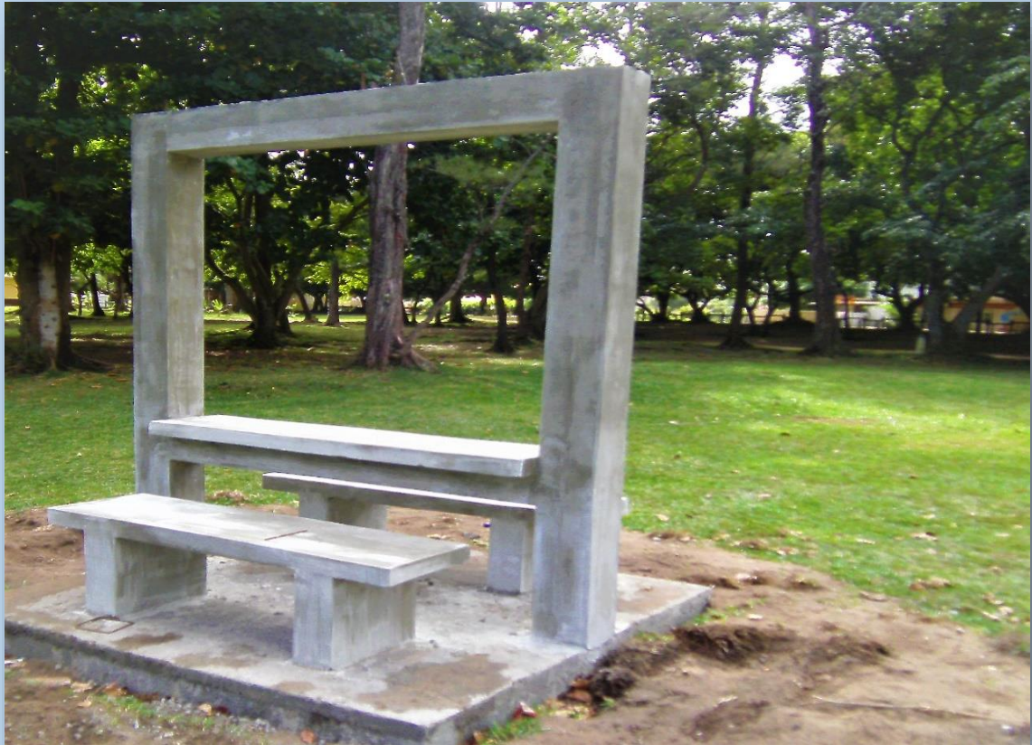
Construction of new kiosks

In line with its mandate to embellish public beaches of Mauritius, the Beach Authority has embarked on the infrastructural development at Bel Ombre public beach. The project consists of provision of parking area, construction of new kiosks and provision of bins to cater for the high number of beach users.