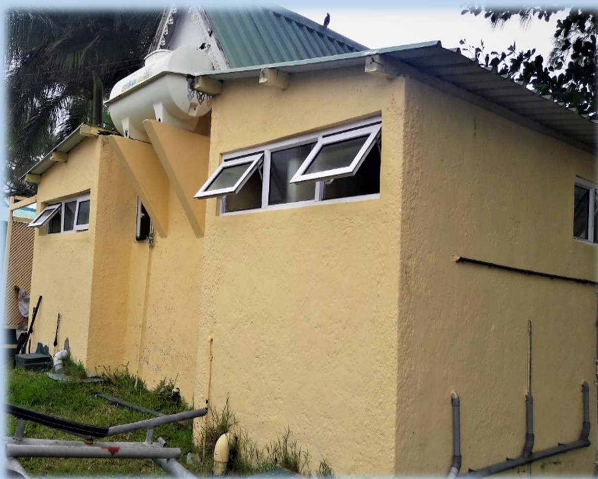
Toilet blocks at Trou d'Eau Douce public beach

In view of providing a good service to beach users in general, the toilet blocks at Trou d'Eau Douce public beach is being upgraded.