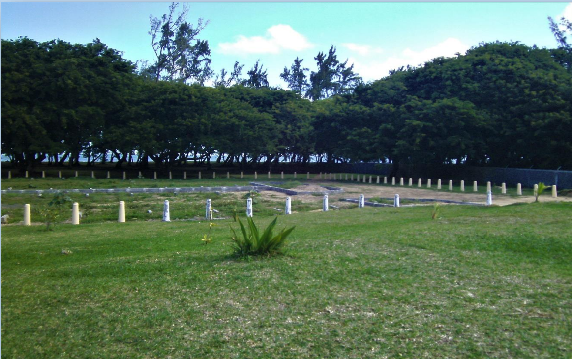
After – Parking with bollards enclosure