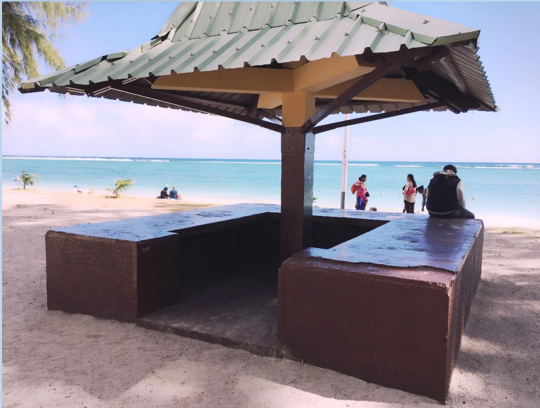
Kiosk embellished at Flic en Flac public beach