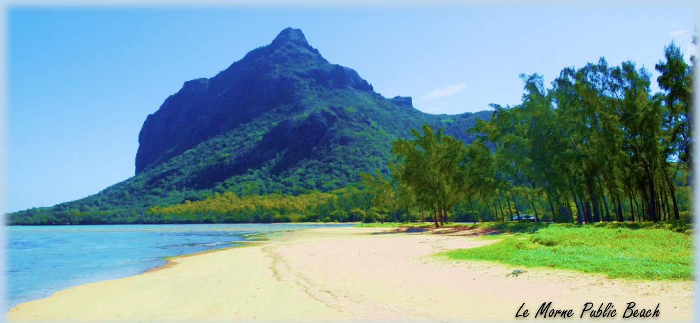
Le Morne Public Beach

The Beach Authority will continue with its activities of clean up and embellishment on all proclaimed public beaches and the action plan for period March 2017 to March 2018 is annexed.