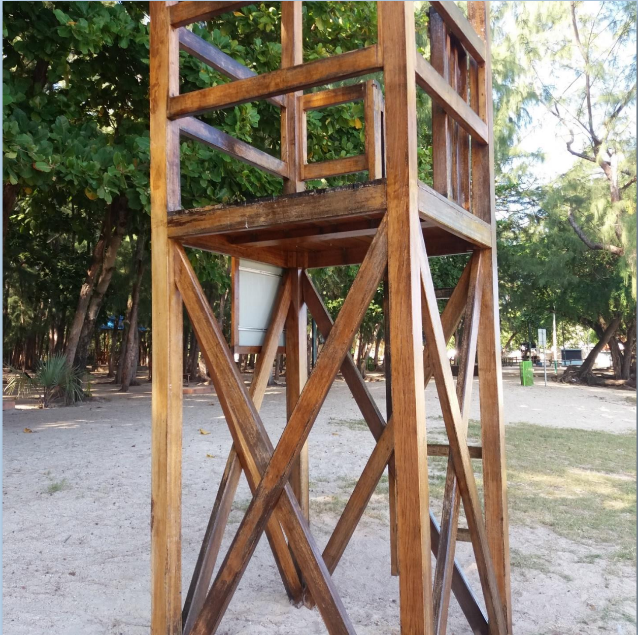
Varnishing of Vigilance Tower

The purpose of vigilance towers is for the safety and security of beach users.