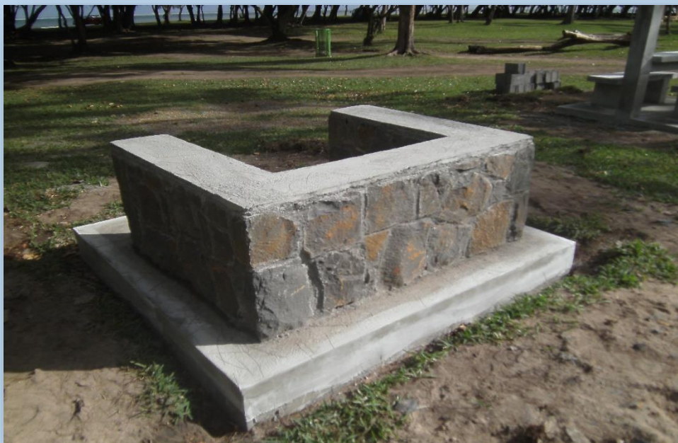
Fireplace at Bel Ombre public beach

Infrastructural development at Bel Ombre includes major constructions such as fire place, kiosks, parking facilities with bollards enclosure and kerb.