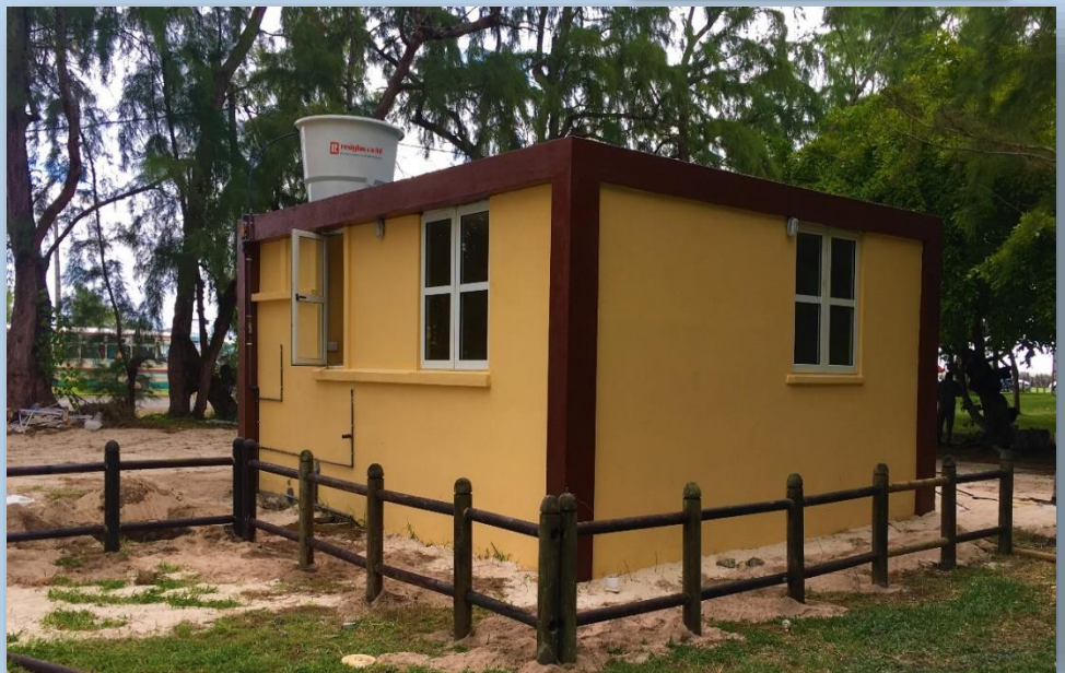
Sub-office at Belle Mare public beach