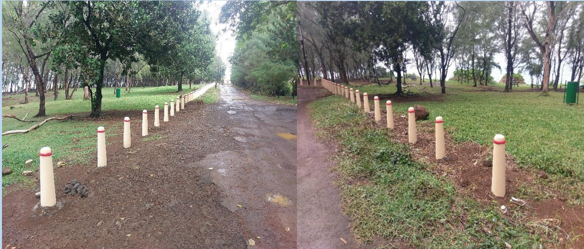
Bollards at Terracine public beach